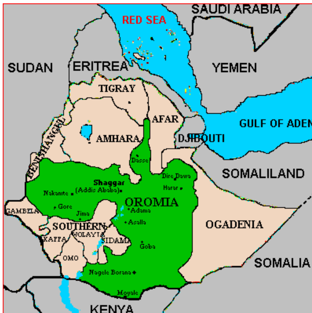
Annex 1: The OLF's map of Oromia.