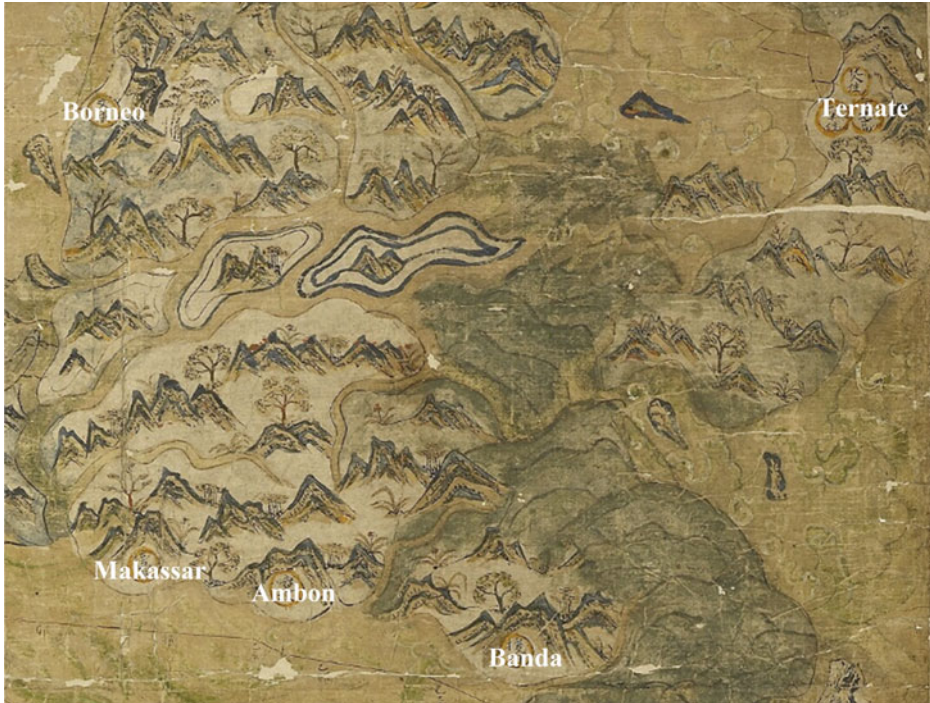
Figure 2. The world of Maluku and its adjacent area on the Selden Map. Bodleian Library, University of Oxford, MS Selden Supra 105. https://seldenmap.bodleian.ox.ac.uk/

On this map, the Spice Islands are distortedly situated on the lower right corner (Figure 2). Zooming in to the islands, one might find that this map is full of mistakes: Ternate is separated from the rest of the Indonesian Archipelago and is at the end of a sea route extending from the north; Timor is situated to the east of Ambon and is placed on Java Island; Makassar and Ambon are located on one and the same big island; and the island of Banda is incommensurately huge.