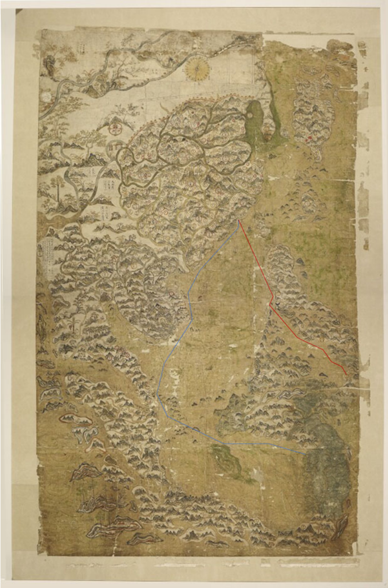
Figure 3. The two navigation routes connecting China and the world of Maluku on the Selden Map.

The critical section in the eastern route to Maluku was from Manila to Ternate. This section is desperately understudied, as it is outside the conventional scope of the Galleon Trade, which focuses almost exclusively on China's connection with the "New World" via Manila while neglecting the role played by the rest of the Philippine Islands.