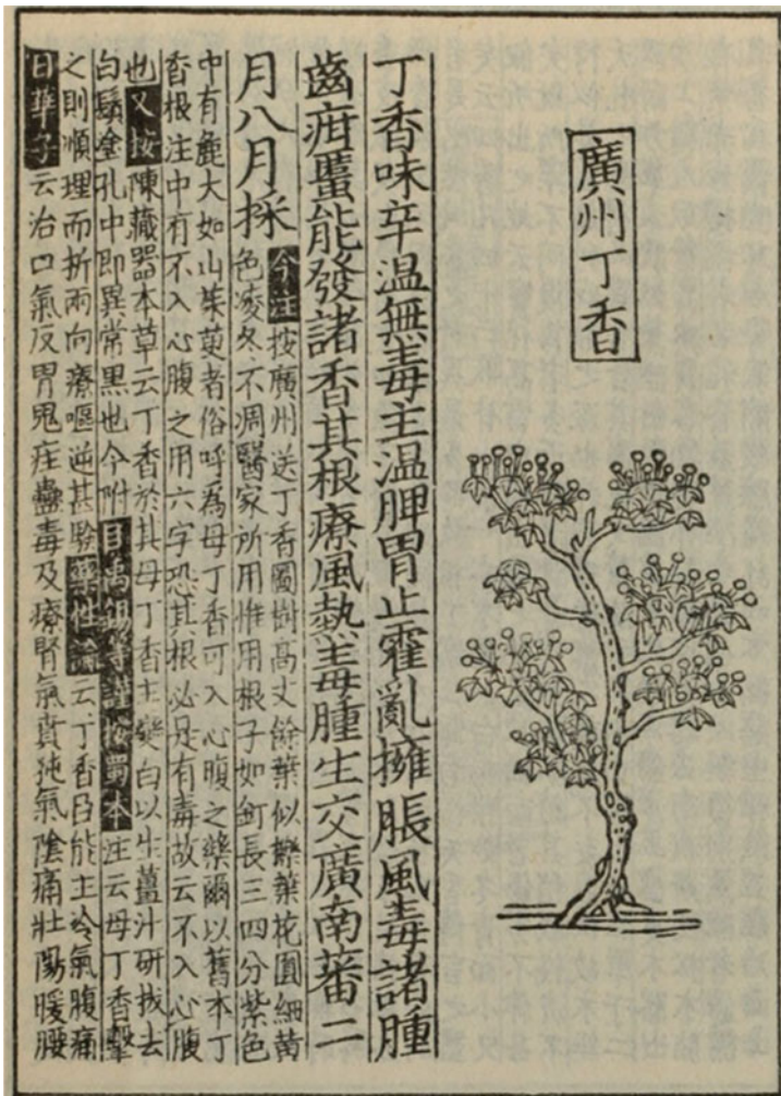
Figure 1. The illustrated Canton cloves (1249 CE). 21

Cloves figured even in an illustrated national medicinal survey of the eleventh century. 19 In that survey, the local officials in Canton commissioned a drawing of the plant of a simulacrum of cloves, the so-called Canton cloves, for the Bureau for Revising Medical Texts of the Northern Song dynasty. That Bureau adopted that image and published it in an illustrated materia medica ( Bencao tujing 本草圖經), which in turn shaped Chinese visual understanding of cloves for centuries to come