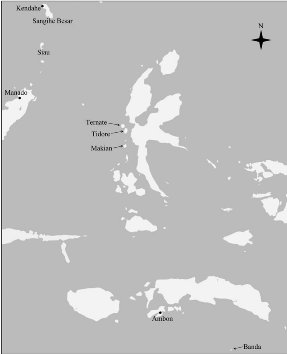
Figure 5. The world of Maluku with place names mentioned in this study.