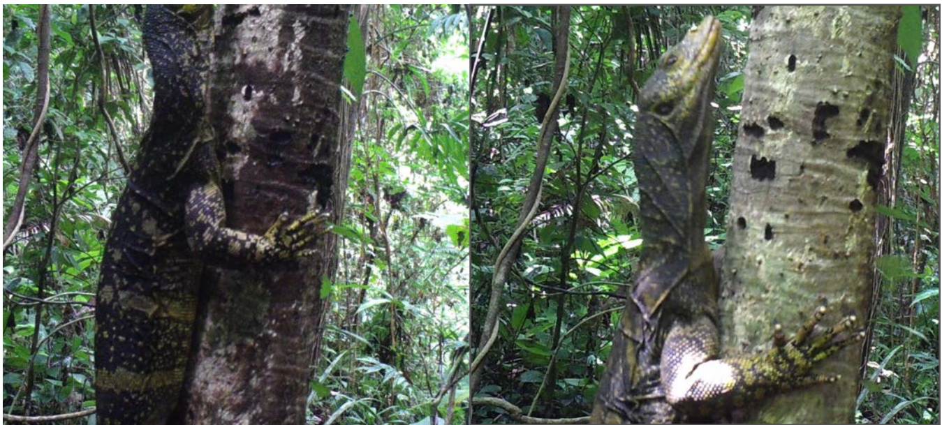
Fig. 1. Images of untagged Varanus bitatawa climbing the same fruiting Pandanus tree. Variation in dorsal patterns indicate that the images captured are of different individuals.

successful trigger events. All trigger events occurred between 0700 and 1559 h. A single camera placed for 7 days captured 8 trigger events including images of three different individuals ascending and descending the tree and a further two individuals captured ascending the tree only. Individuals were distinguished by variation in coloration patterns. Cameras had been set close to the predicted detection zone to increase the sensitivity of a trigger event but this resulted in images that did not include the whole body of the lizard, making size estimations of the lizard difficult (Fig. 1). Time spent in the Pandanus tree by three individuals ranged from 13 - 18 minutes, with a mean time of 16.3 minutes. This is