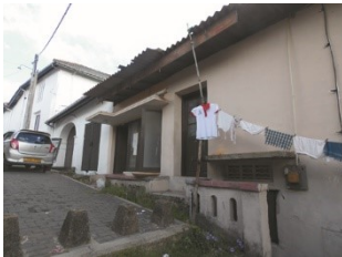
MB_6, 8 & 10