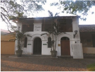
FC_1 & 1A