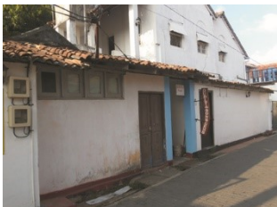
NL1_53/2 & 53/3