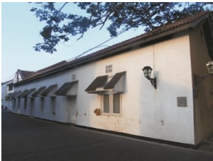
HS_4 & 6