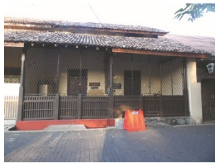
LB_8 & 6