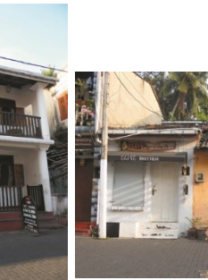
PD_34 & 32