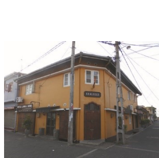
PD_13A & 13