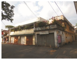
LH_8, 6 & 4