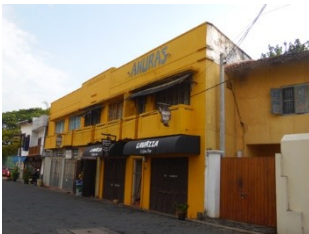
LH_7,9 & 11