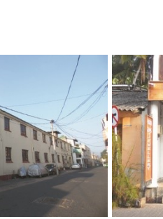
PD_28 & 30