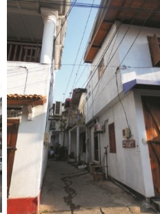
PD_60/1, 60/2 & 60/3