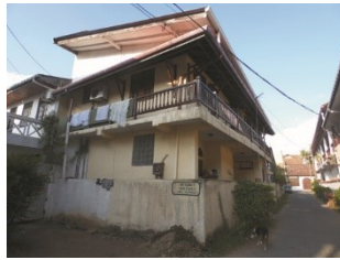
NL2_17 & 15