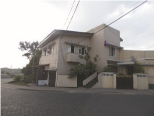
RP_7 & 7A