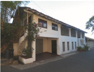
CC_1 & 1A