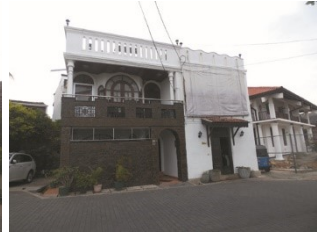
RP_19A & 19B