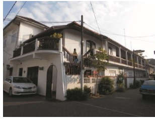
LH_65 & 65A