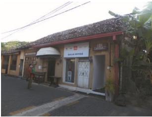
LB_25 & 27