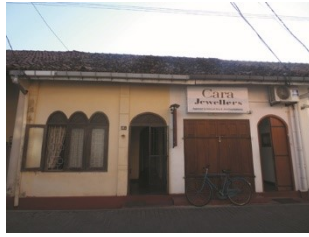
CH_45A & 45