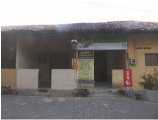
FC_9 & 11