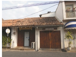
PD_82, 80 & 78