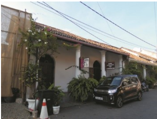
PD_67A & 67