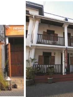
PD_33 & 35