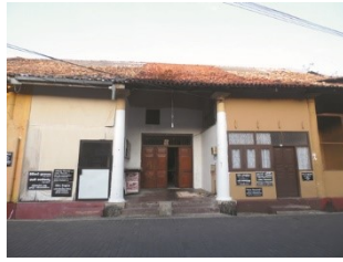
LB_24, 22 & 20