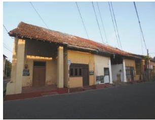
LB_28 & 26