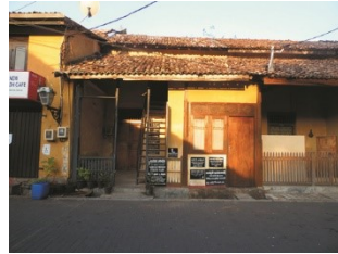
LB_14 & 12