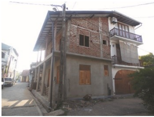
NL2_7 & 7A