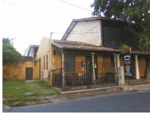
HS_28 & 28A