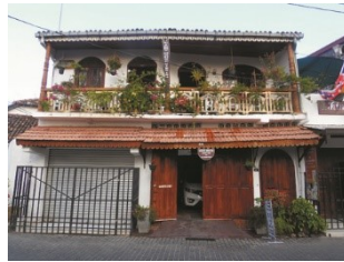
HS_42 & 42A