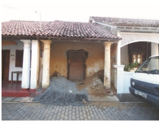
CH_71 & 73