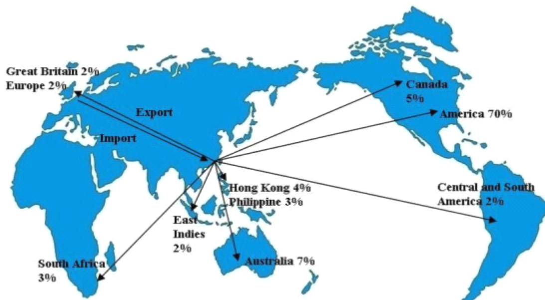
Figure 36: Routes of Import 912 and Export 913 of the Chaozhou Needlework Industry (From The History , p.6)