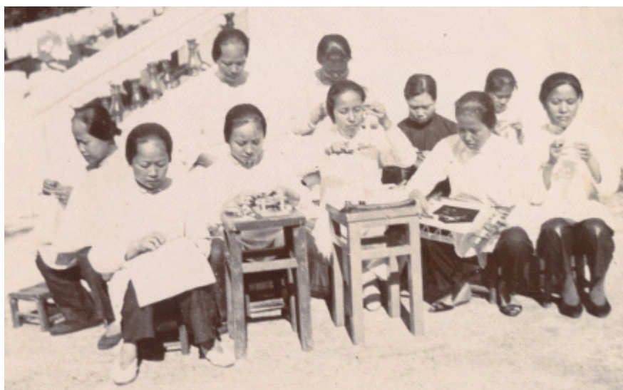
Figure 32: Earning their way in the Women's School

With the passing of time, new sorts of needlework were introduced. Lida Ashmore chose a photo (See Figure 32) to illustrate a group of local Christian women (probably in the compound, the photo was taken between 1911 and 1920) doing a variety of needlework: embroidering, beading, making tassels, making bead bags, crocheting. 825 The first three techniques were part of the repertoire of traditional Chaozhou embroidery, but the last two, making bead bags and crocheting, were typical Western handicrafts.