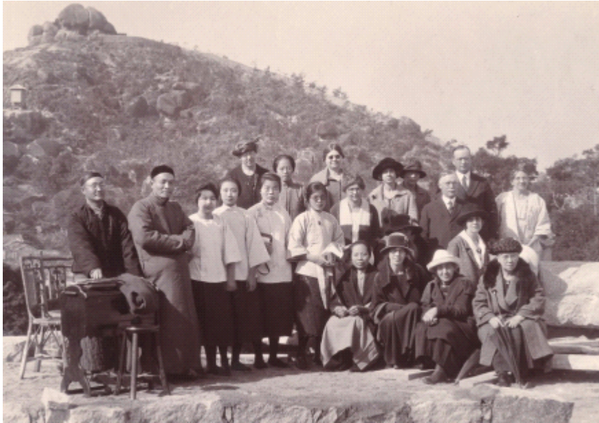
Figure 33: Laying the Foundation Stone of the Jubilee Building in Queshi, Swatow, China, Dec. 26, 1924.

The school staff and some of the American guests at the Laying of the Foundation Stone