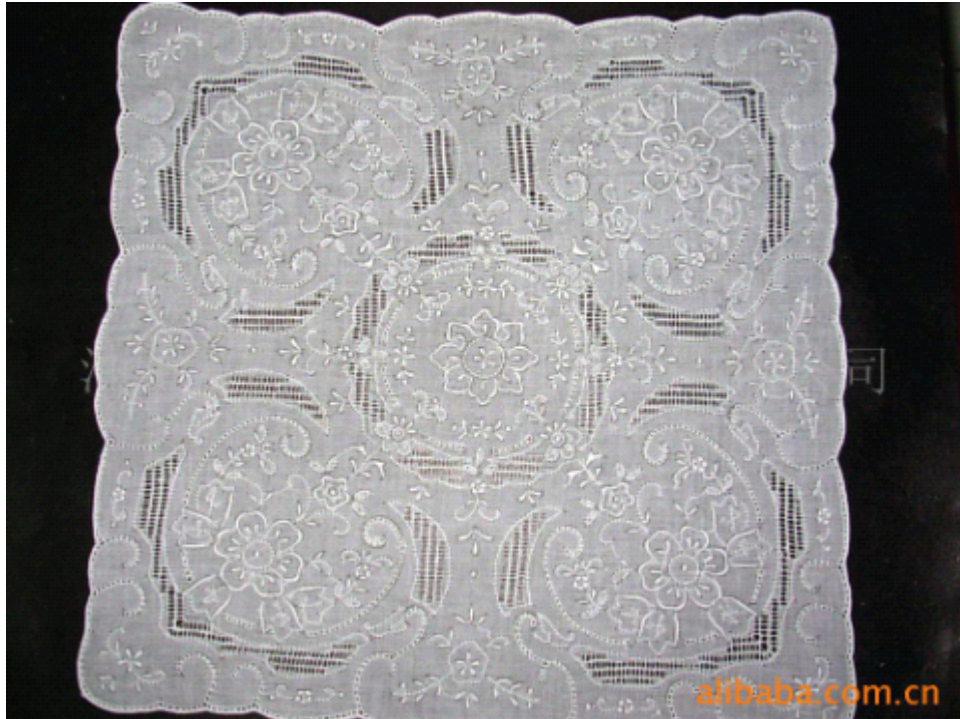
Figure 28: A piece of drawn-thread handkerchief made in Swatow (hand-made, modern)