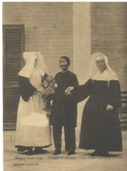
Figure 16: Sisters of St. Paul des Chartres in Swatow, ca. 1910

The orphans came from three sources: some were brought by their parents who were unable to rear a baby because of their poverty or because they did not want the baby (most of them were girls); priests and sisters also encouraged non-Roman Catholic families to bring their babies to orphanage instead of abandoning them, some of them even paid a handful of money (10 sous) for each baby; 320 the civil orphanage (养生堂, or 育婴堂) also brought dying babies to the Roman Catholic orphanage for baptism. 321 The inferior appreciation of female offspring meant that there was a high percentage of baby girls against the baby boys in the Roman Catholic orphanages. Father Antoine Douspis' report in 1910 states that "each year orphanage of Chaozhou fu collected hundreds of abandoned little girls." 322 The death rate of babies in the orphanage was very high, Le Corre reported in 1909 that "in Paotai, our Holy Childhood collected 57 babies this year, nearly all of whom departed for Heaven after having spent some time (long or short) under our roof." 323 The situation was the same under the care of the Canadian sisters in the 1920s. 324