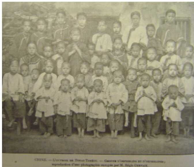
Figure 17: The Workshop in Chaozhou—the group of orphan boys and girls

food, the production of candles and the Host (bread or wafer of the Eucharist). 325 At fixed times, Anne Lim instructed different classes in reading and writing Chinese characters and also in the doctrine in the books of religion. Furthermore, “every year for four months she is charged with preparing for the sacrament all the young pupils in the house, in an outbuilding of the convent.” 326