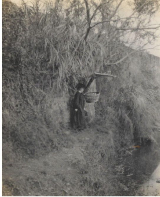
Figure 18: “Place your babies here. Do not throw them into the pond”, 1911