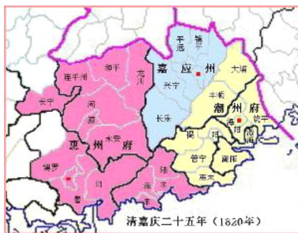
Figure 1: The prefectures of Huizhou, Chaozhou and Jiayingzhou in the late Qing period

In the Qing dynasty, three prefectures made up the eastern part of Guangdong province. From west to east they were: Huizhou, Jiayingzhou and Chaozhou. 3 They were administered by the Hui-Chao-Jia Daotai (惠潮嘉道台, the circuit intendant of Huizhou-Chaozhou-Jiayingzhou) who resided in the prefectural city of Chaozhou. 4 The city of Chaozhou was the political and cultural centre of east Guangdong. Chaozhou prefecture, situated in the coastal region, will be the main geographical area of my study. The prefecture had two natural geographical boundaries: the sea coast in the south-east and the range of Lotus Mountains 5 to the north-west.