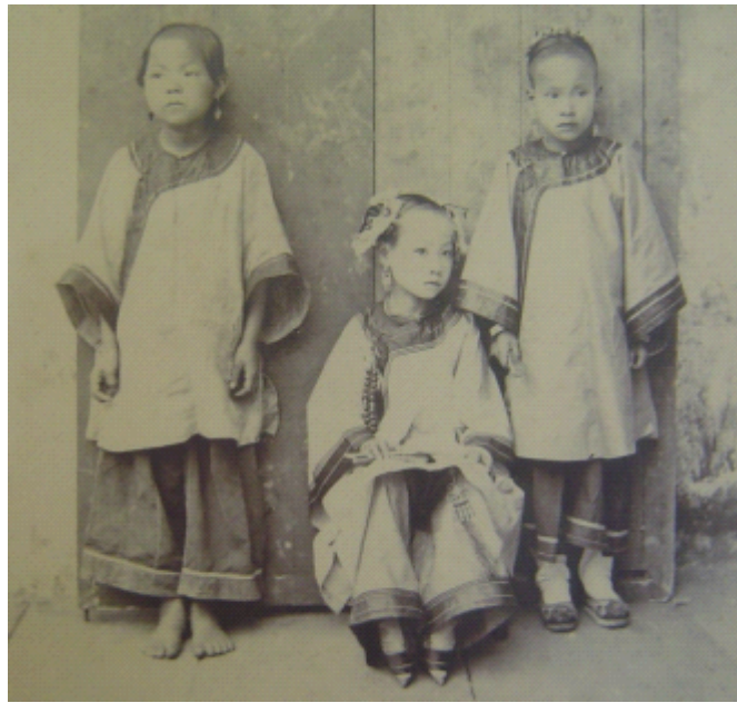
Figure 3: Girls with bound feet and natural feet in Chaozhou

The custom of foot-binding was also widespread in the Chaozhou region. Most of the Hoklo women, whether rich or poor, followed this custom, with the difference that girls in the rich families had their feet bound at seven or eight years of age, while those from the poor families only underwent this process when they were thirteen or fourteen years old, shortly before their marriage. The reason for the postponement of the binding was that they were expected to assist in all sorts of housework. The Hoklo women of the sojourner families (this refers to families with a husband or a son working in South-East Asia) did not have their feet bound, because they had to till the farmland. 18