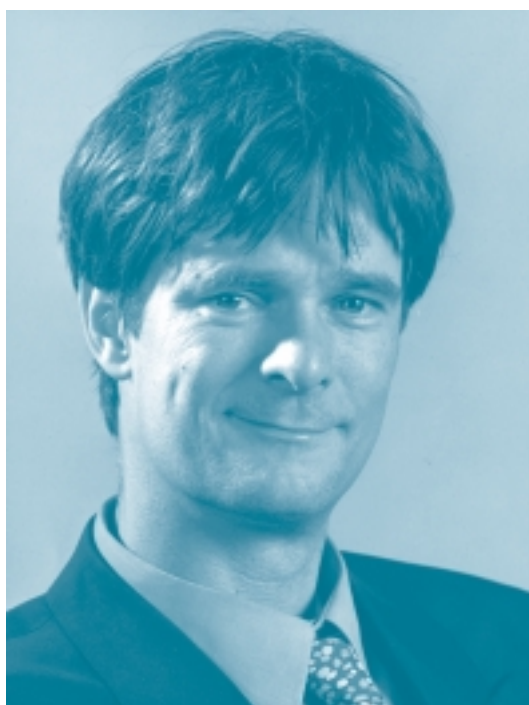
13 • Dr. F. van der Ploeg, the Dutch Secretary of State for Culture.

For this reason, I thought it was important to be here today, because I do support the idea of an association that is intended to bring together all organisations from European countries that are involved in managing the archaeological heritage. We are all confronted with similar problems, and the organisations can learn from each other, exchange experiences, and work together at the European level. This is absolutely necessary when we want to provide a real future for the European past - not only because of the process of unification, which is primarily motivated by politics and, of course, economics. Archaeology itself is in fact also European and, when you think about it, it doesn't really make any sense to talk about the archaeological past of the Netherlands, or of any other country. The concept of the nation state is a comparatively recent invention and I would rather prefer to see the present-day nations as stewards of a territorial portion of a larger and common, European heritage.