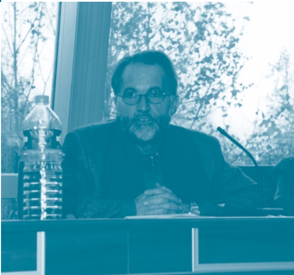
10 • Director General Raymond Weber of the Council of Europe welcomes the Consilium.