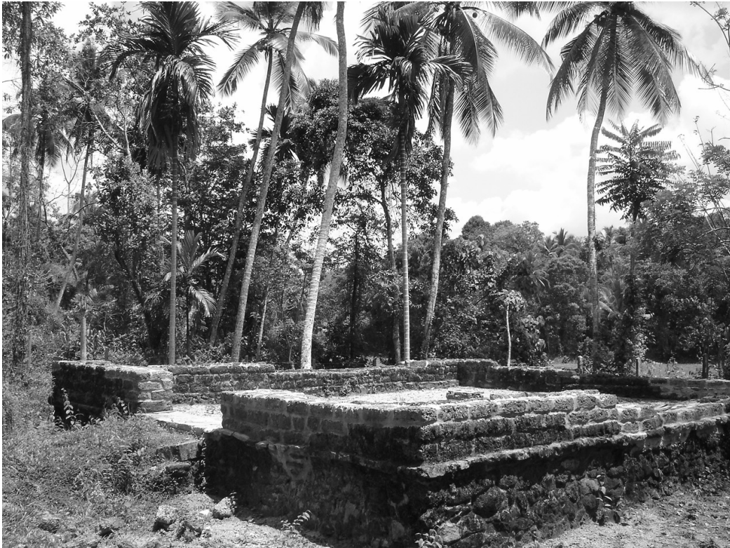
Picture No. 2: remnants of an Ambalama - rest house- after restoration In Uduwoda (Hina/Mäda)