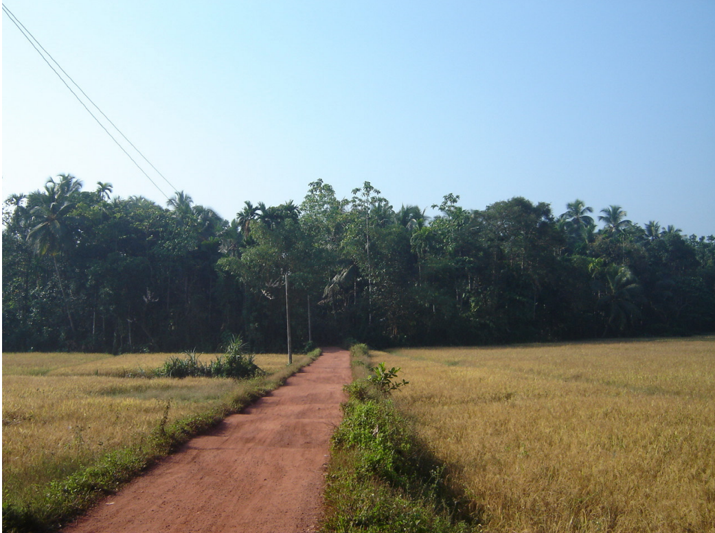
Picture No. 1: Rural Landscape (overlooking Radaliyagoda (Hina/Mäda))