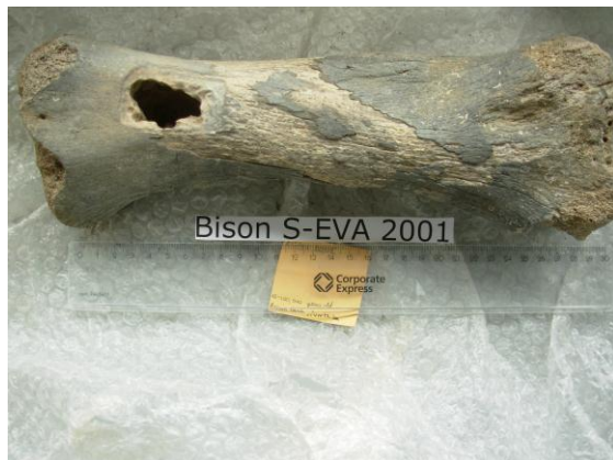
Figure 6.2 Bison sample involved in this work