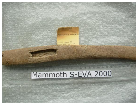
Figure 6.1 Mammoth rib sample involved in this work

The study involves two different bone samples. The first one is a Mammoth rib from North Sea (lab code S-EVA 2000, Figure 6.1) and the second is a bison bone, also from North Sea (lab code S-EVA 2001, Figure 6.2)