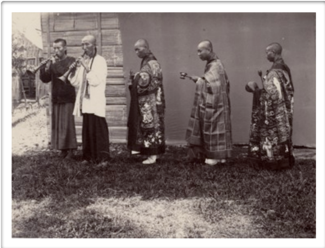
Chinese priests, presumably in Batavia, c.1900