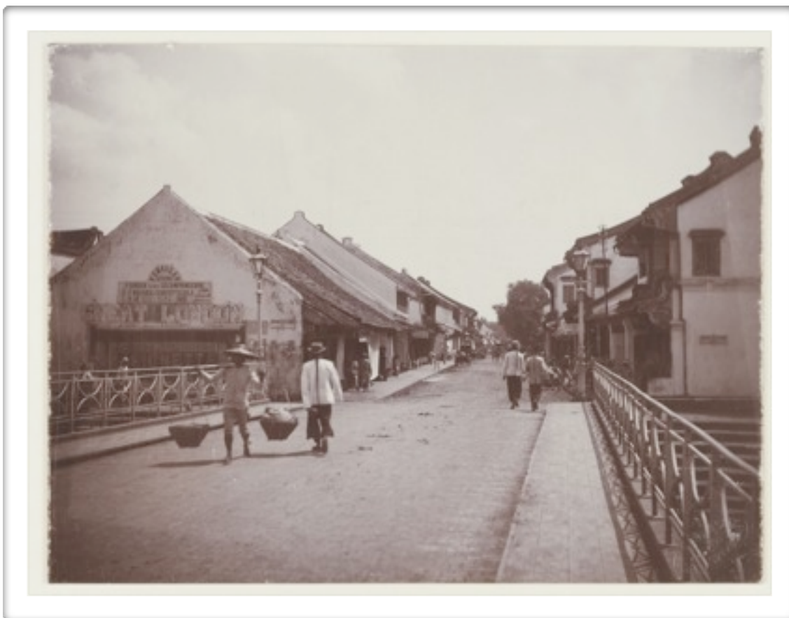
Chinese on the way to Pasar Baroe, c.1900

The neighbourhood chiefs were in charge of a group of night watchmen, appointed to patrol in the Chinese neighbourhoods at night and paid for with money the chiefs collected from the Chinese people. 226 The neighbourhood chiefs also assisted the police in criminal investigations. They accompanied the police when house searches were carried out in their neighbourhoods, and tracked down illegal opium sellers and illegal female immigrants who had been forced into prostitution by women traffickers. 227 The Chinese Council did not maintain a separate police force, as asserted by James Rush. 228