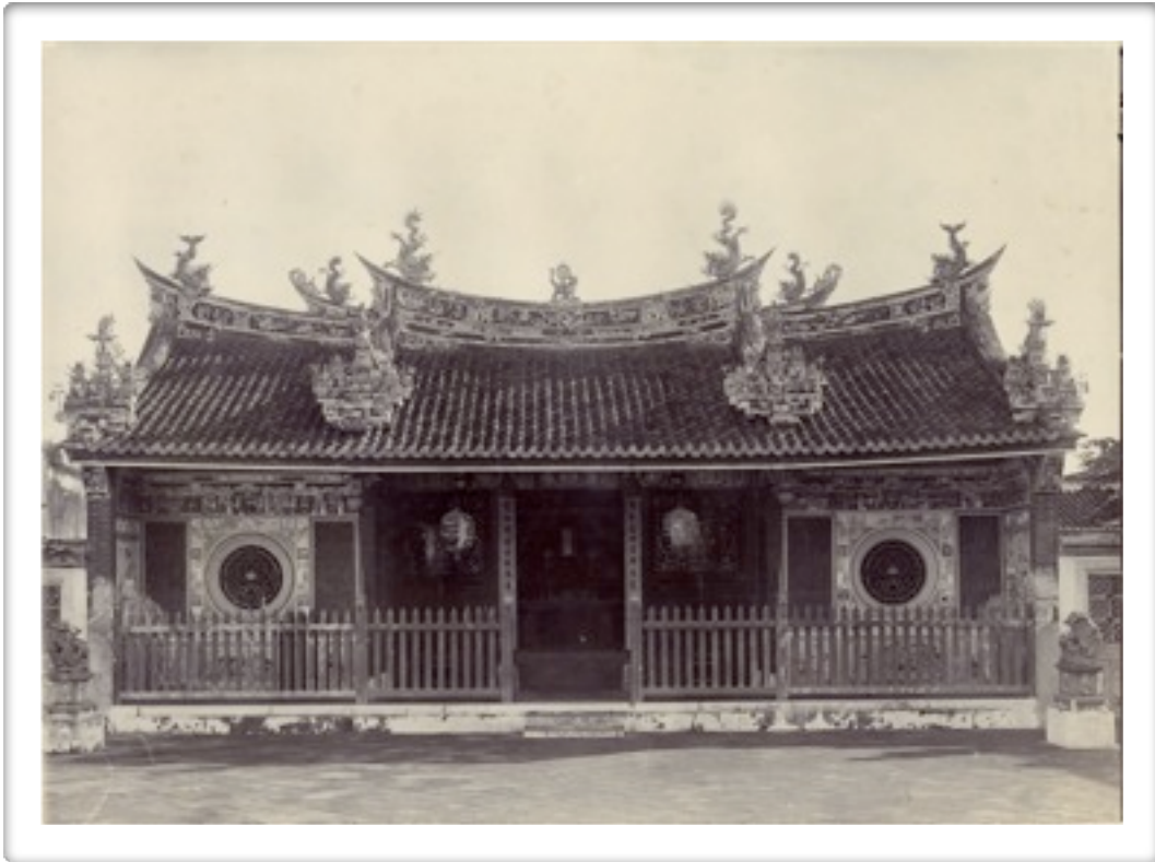
Chinese temple in Batavia c.1900