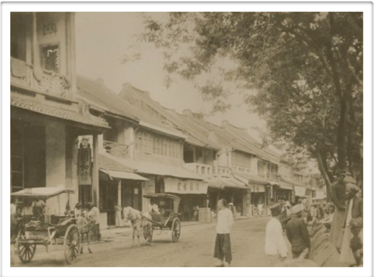
Chinese neighbourhood, presumably in Batavia, 1920

took care of the immunisation of females and children. The men were vaccinated by an indigenous vaccinator, hired by the Council. 237 Newly arrived immigrants from China also had to be vaccinated, but this turned out not to be so easy. Lack of knowledge probably resulted in their resistance against the vaccinations. Only the threat of being sent back to China or the closing down of their shops made the Hakka and Macao Chinese give in. 238 Neighbourhood chiefs who failed to report a case of infection, or failed to bring in a considerable number of people for the vaccination rounds were fired. 239