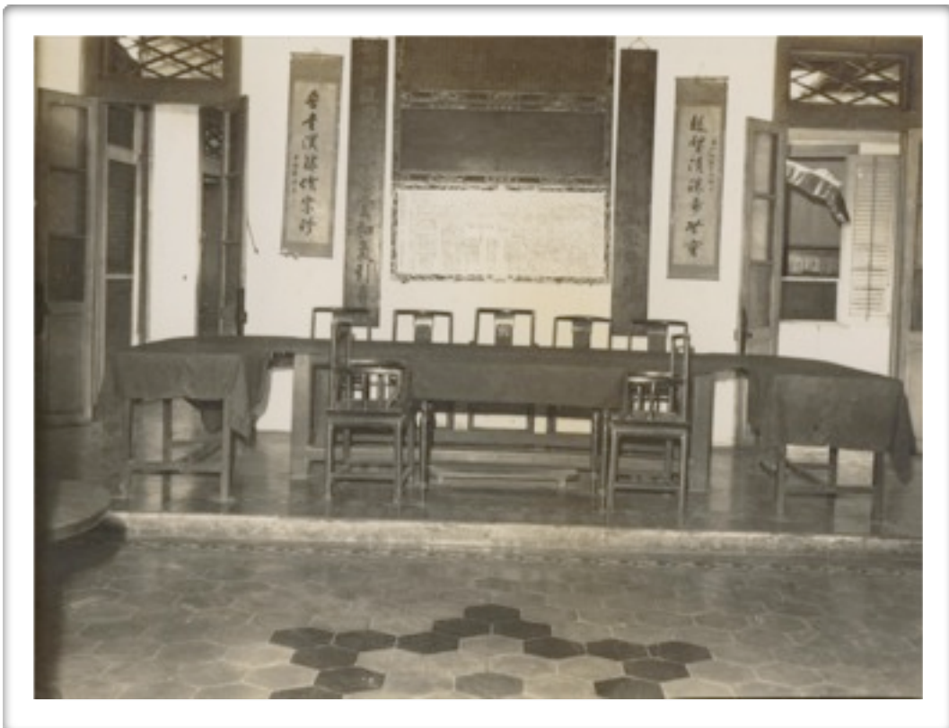
Meeting room in the former Tongkangan office, c.1930