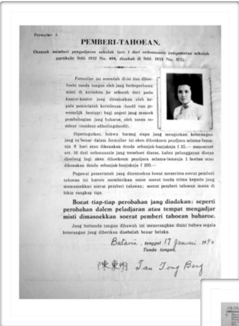
An application for a teaching position in Batavia