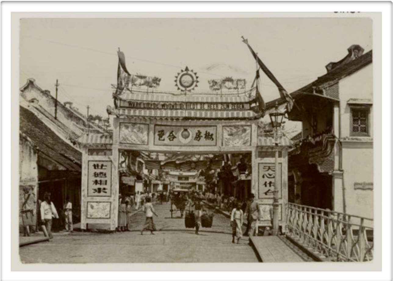
Special gate erected to celebrate the marriage of Queen Wilhelmina at Pasar Baroe, 1901

celebrations. The Dutch holidays were celebrated in the Chinese neighbourhoods and temples with great enthusiasm; special ceremonies were organised in the Chinese temples, as was entertainment such as music, wayang performances, and other kinds of theatre. The Chinese neighbourhoods were cheerfully decorated with flags and lanterns. In 1913 the assistant-resident sent a letter to the Chinese Council to say how impressed the governor-general was to see the enthusiasm of the Chinese people in preparing the festivities for celebrating the centennial independence of the Kingdom of the Netherlands. 225