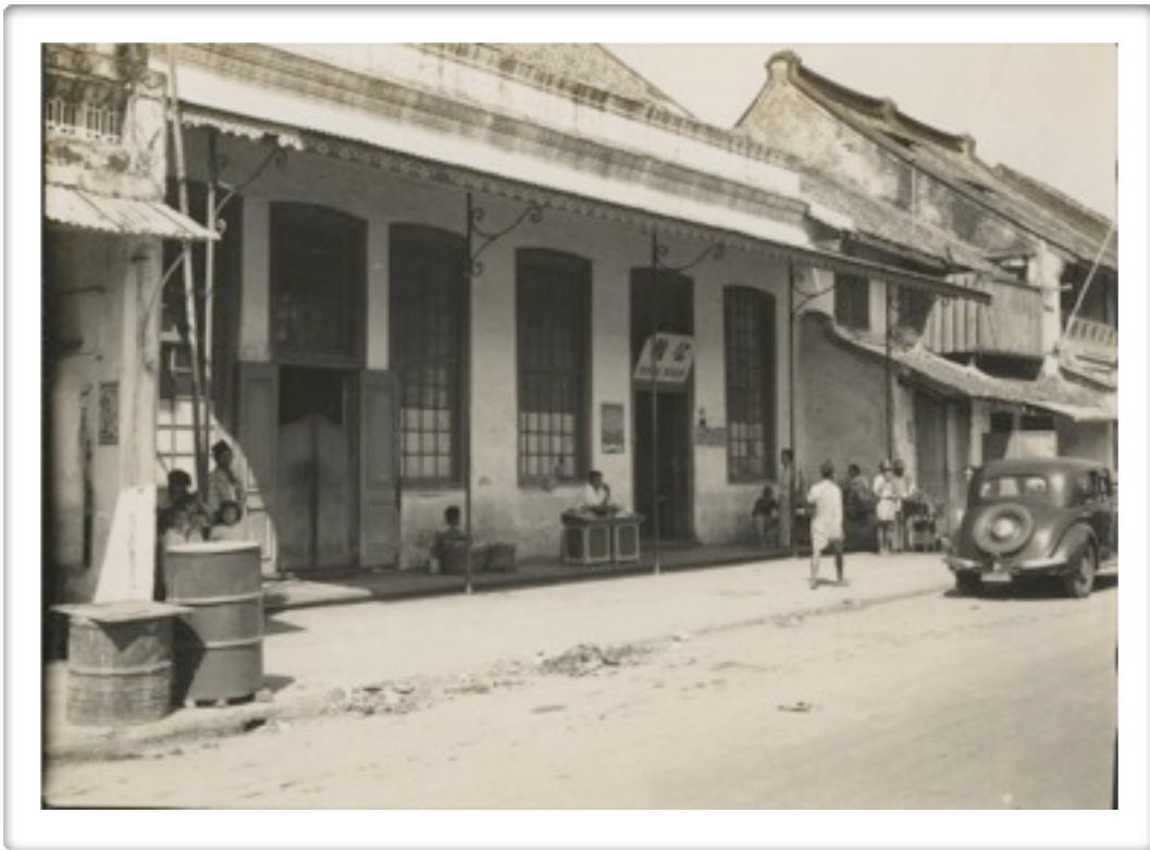
Former office of the Chinese Council of Batavia on Jalan Tongkangan, c.1930