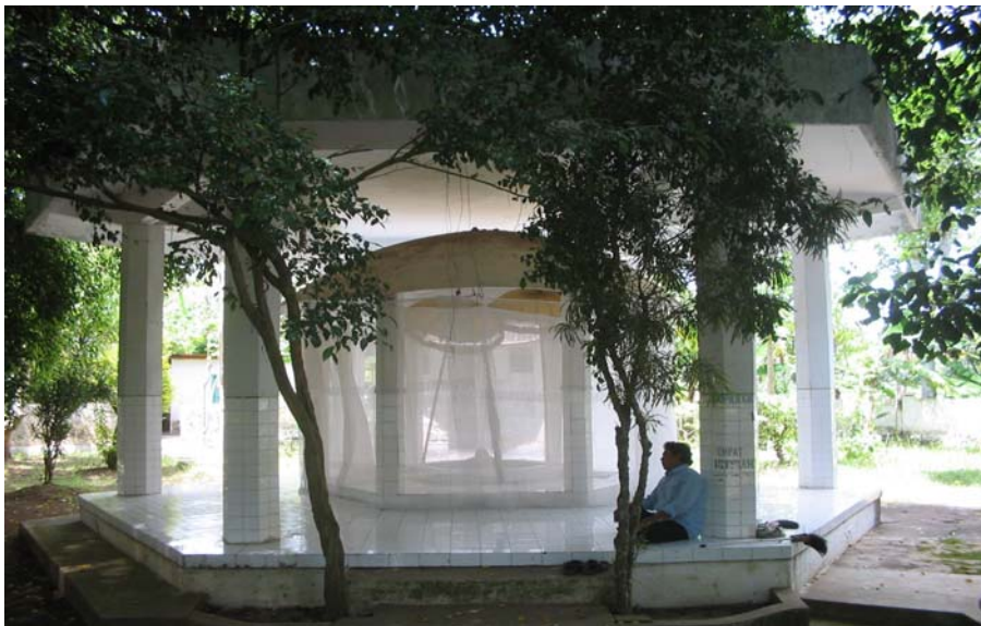
The Grave of Tawangalun in Macan Putih, Banyuwangi (Pic.2004)

During the reign of Amangkurat I (1646-1677) of Mataram, many outlying vassals rose against this tyrant king. In 1680, a Dutch captain, Jeremias van Vliet, was sent to Blambangan to root out the Makassarese and the Malay rebels who had assisted Trunajaya in his rebellion. Van Vliet tried to bring Tawangalun to the Susuhunan of