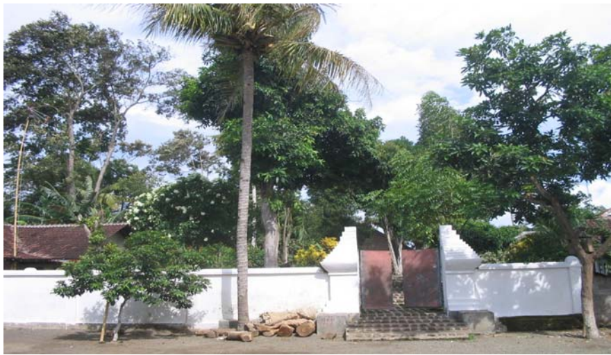
Umpak Songo in Muncar Banyuwangi which is believed to be a remnant of the Blambangan Palace