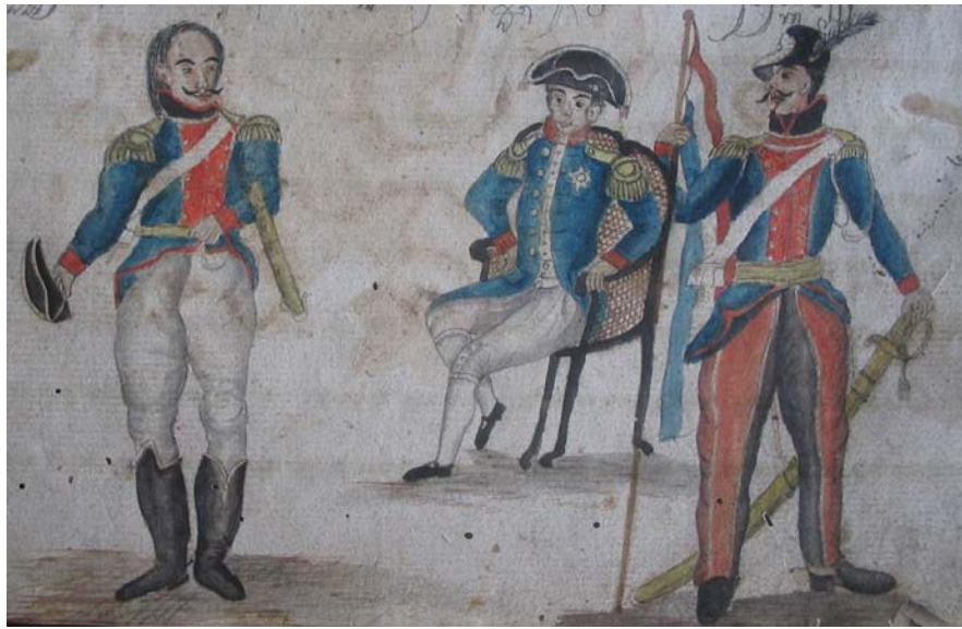
The Governor-General in Batavia discusses the unsolicited invitation from the King of Blambangan