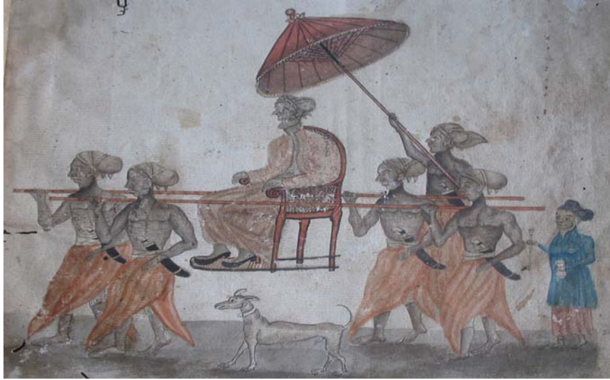
Tumenggung Jayanegara, the Regent of Probolinggo during the expedition to Blambangan (Coll. KBG 63, National Library, Jakarta)

the land road to Surabaya which was not easy either because the steady rains had caused the condition of the roads to deteriorate. 62