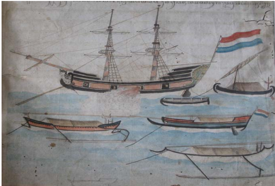
Dutch ships and vessel employed in the Blambangan Expedition 1767

submitted to the Company, but the second chief, who was a peranakan -Macassarese, escaped. Meanwhile, most of the women and children fled away from their village and concealed themselves in the forest, fearful of the supposedly wild and vicious Madurese troops. 65