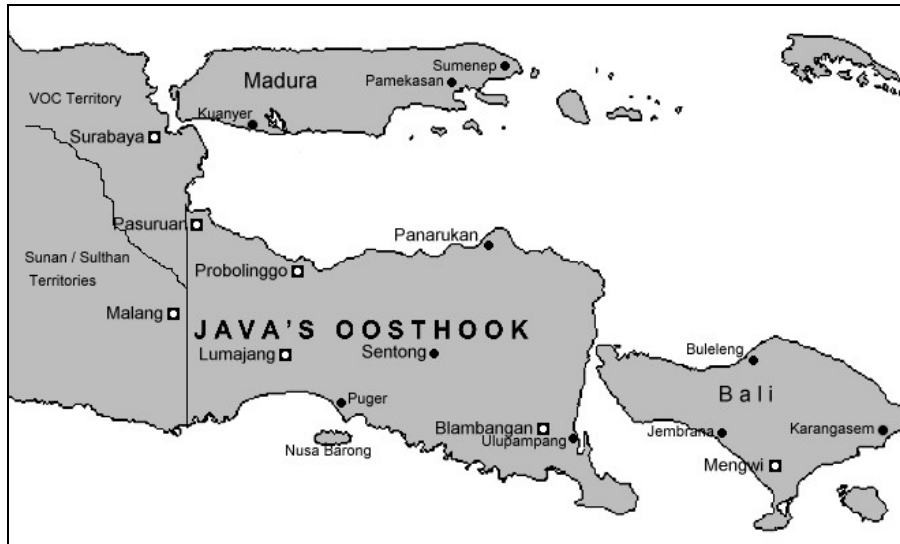
Map of Java's Oosthoek and Bali

After the treaty of 1743, Governor-General Van Imhoff and the Council of the Indies did not take any immediate action to exercise power in Java's Oosthoek , with the exception of Pasuruan and Probolinggo. In both places, Batavia established small fortresses which were manned by only a few European soldiers. The occupation of the rest of the region of Java's Oosthoek remained pending because of two reasons. First of all, the Company was again dragged into political disputes in Central Java which were not settled until 1757 when the Mataram kingdom was split up into three parts. At that time, the Dutch authorities in Batavia were not yet fully aware of the real political situation in the Oosthoek and of the latent threats coming from its main European competitor, the English East India Company, which at that time was extending its tentacles into the Archipelago and had even the temerity to establish an outpost near the Bali Strait. Though Gezaghebber Hendrik Breton of Surabaya had strongly urged for the construction of a new post in Blambangan, Batavia stuck to its decision not to establish a new settlement for the time being because the Company felt it had already overextended its presence in Java.