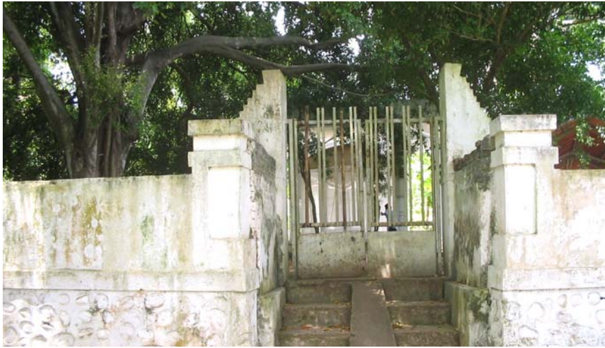
The Grave of Tawangalun in Macan Putih, Banyuwangi (Pic.2004)