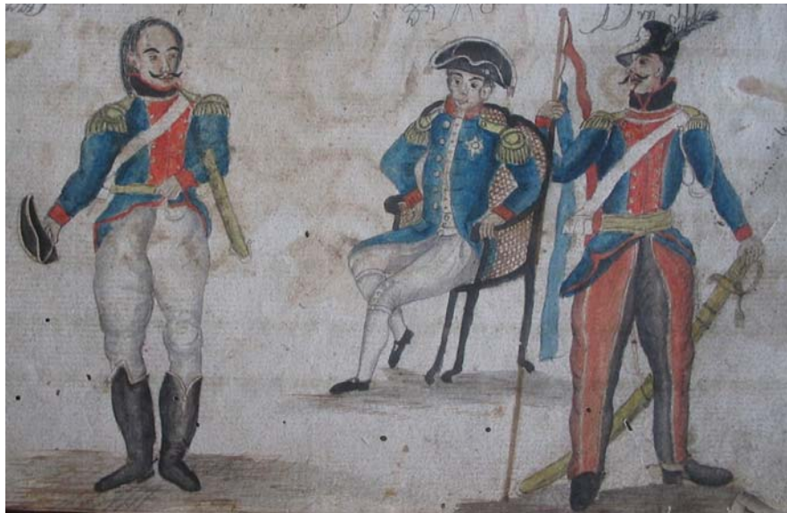
The Governor-General in Batavia discusses the unsolicited invitation from the King of Blambangan