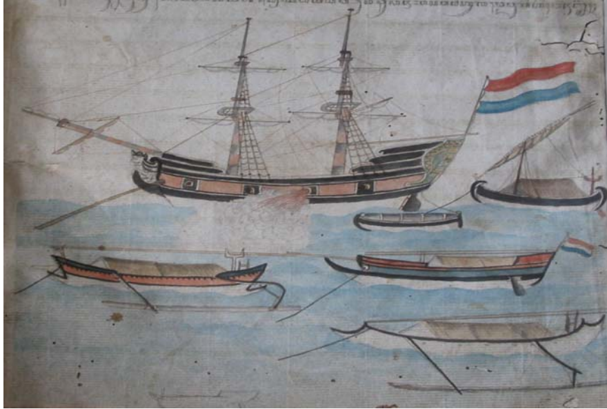
Dutch ships and vessel employed in the Blambangan Expedition 1767

submitted to the Company, but the second chief, who was a peranakan -Macassarese, escaped. Meanwhile, most of the women and children fled away from their village and concealed themselves in the forest, fearful of the supposedly wild and vicious Madurese troops. 65