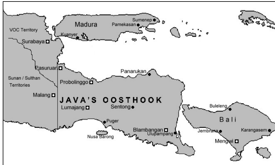
Map of Java's Oosthoek and Bali