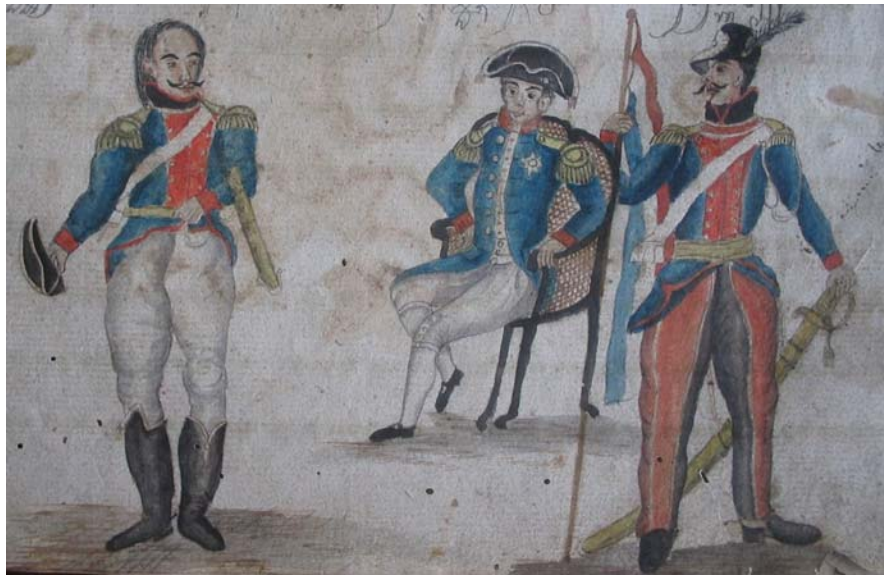
The Governor-General in Batavia discusses the unsolicited invitation from the King of Blambangan (Coll. KBG 63, National Library, Jakarta)