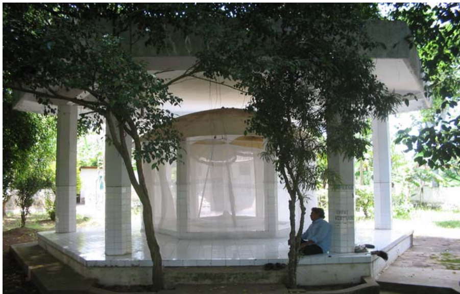
The Grave of Tawangalun in Macan Putih, Banyuwangi (Pic.2004)

During the reign of Amangkurat I (1646-1677) of Mataram, many outlying vassals rose against this tyrant king. In 1680, a Dutch captain, Jeremias van Vliet, was sent to Blambangan to root out the Makassarese and the Malay rebels who had assisted Trunajaya in his rebellion. Van Vliet tried to bring Tawangalun to the Susuhunan of