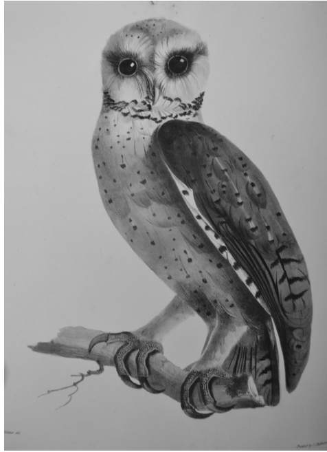
Figure 28: Bird illustration in Horsfield's monograph Zoological researches (1824).

Horsfield to publish his findings. His articles appeared in the Proceedings of the Batavian Society of Arts and Sciences between 1814 and 1816. 28