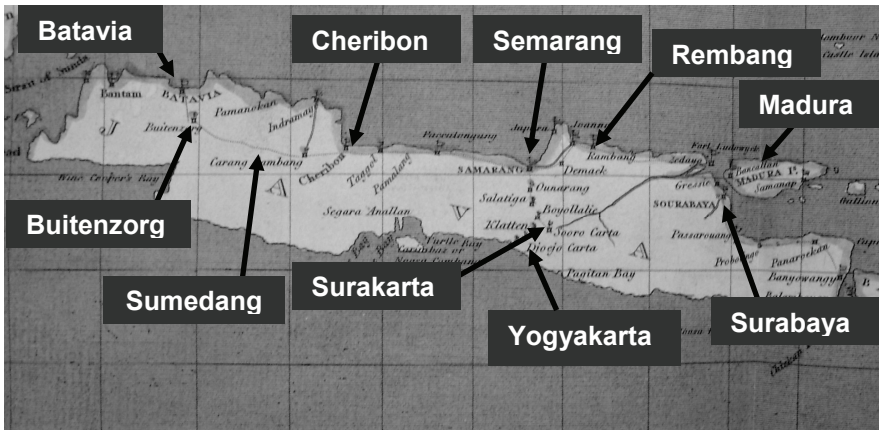
Figure 27: Map of Java with places the General Committee and Reinwardt visited.

neighbouring provinces had assured their loyalty by swearing an oath to the new colonial government, Elout, Van der Capellen and Reinwardt talked with each regent individually in order to gain more information about the current social, political and economic state of their districts. The respective entries in Reinwardt's travel diary give a good impression of the scope and content of these interviews. Reinwardt noted information on the number of families living in the different sub-districts and the production of crops such as coffee, rice, and coconut trees. 10