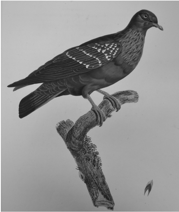
Figure 32: Illustration from Temminck's Histoire naturelle des pigeons (1808).

publication of lavishly produced travel narratives and descriptions of regions that lay beyond the horizon of Europe's learned world. The narrative strategies of these accounts were diverse. While most authors gave a chronological description of their journey based on their travel diaries, others decided to summarize their observations according to self-defined categories. In Observations made during a voyage around the world, on physical geography, natural history, and ethic philosophy (1777), Johann Reinhold and Georg Forster, who had accompanied Cook on his second circumnavigation from 1772 to 1775 summarized their findings by using the following six labels: the earth and its strata, water and the ocean, changes of the globe, the atmosphere, organic bodies and human species. 93