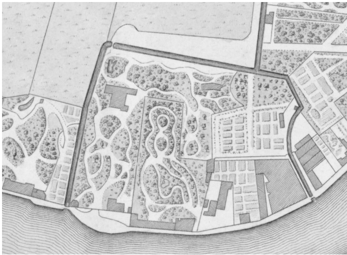
Figure 21: Van Marum's garden, Plantlust, in 1822.

Following the prevailing fashion of the period, Van Marum designed his garden in the organic English landscape style rather than in the more formal and artificial arrangement preferred by the French. He thus carefully integrated the cultivated plants into the natural terrain of the area. The majority of the flowers, trees and shrubs were planted in long rows along the paths that curled through the territory. Van Marum sorted his garden according to the scheme developed by the South African botanist Christiaan Hendrik Persoon (1761-1836). It is highly likely that Van Marum regularly invited friends to his garden to instruct them about the order of plants and their relationship with the environment.