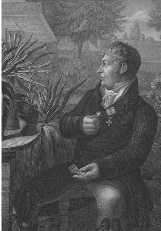
Figure 22: Portrait of Carl Ludwig Willdenow, director of the botanical garden in Berlin, surrounded by plants.

factors that every analysis of vegetation had to take into account. Only such a perspective enabled one to understand how hurricanes, earthquakes, and volcanoes influenced the earth's vegetation. In order to structure such an analysis, Willdenow proposed to divide Europe into five major floristic regions. 69