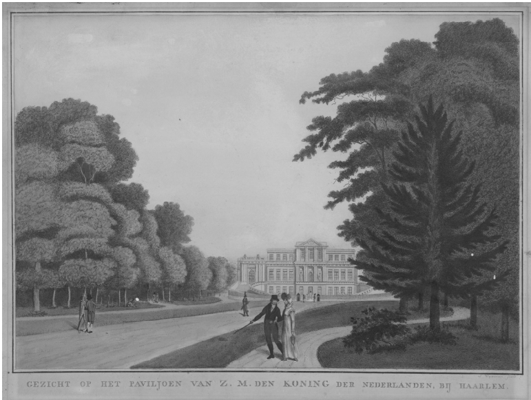
Figure 19: View of the Paviljoen Welgelegen with visitors strolling through the park.

appointed as administrator of the entire royal domain, were lodged in a house closer to the palace. 20