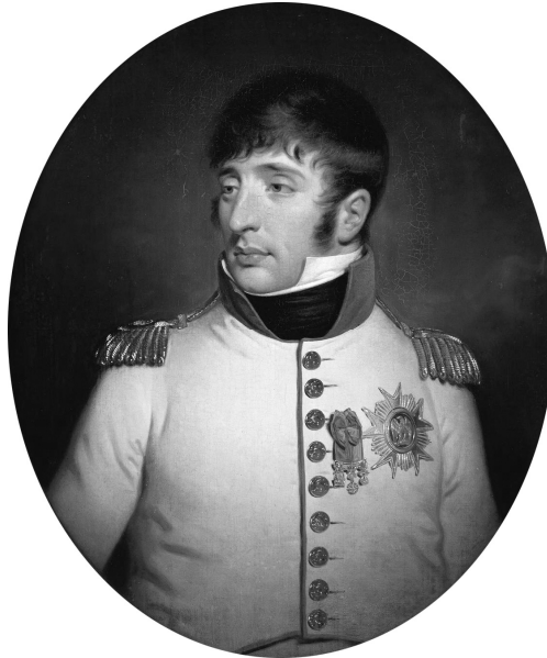
Figure 17: Portrait of Louis Napoleon Bonaparte (1778-1846).

A core part of this policy was the preparation of a new constitution, which was meant to cement the king's central role in the new monarchy above all other representative bodies. The complex history of the constitution illustrates how Louis Napoleon first balanced the different positions and then interfered in an effort to secure his central role in the new state. 3