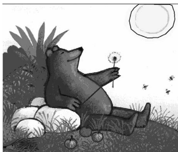
Figure 1 Scene from Bear and piglet . Central elements representing the story text are demarcated by blue lines. Note that the bear needed more than one central element to demarcate as only a maximum of 50 points or coordinates can be used to define elements. The rest was coded as other elements.’ The verbal text with the accompanying picture runs as follows: “Once upon a time there was a lazy bear. Most of all he preferred to doze in the sun. Whenever he was hungry he ate what he could find. Apples, berries and nuts from the forest. He was contented with life and did not worry about the future.” From Bear and piglet , 2003, illustration by M. Velthuijs, Amsterdam: Leopold.

plants, and grass, none of which were referred to by the story text. Fixations on those elements were defined as fixations outside the demarcated zones. Two independent coders agreed on 96% of all elements. Disagreements were resolved in discussion.