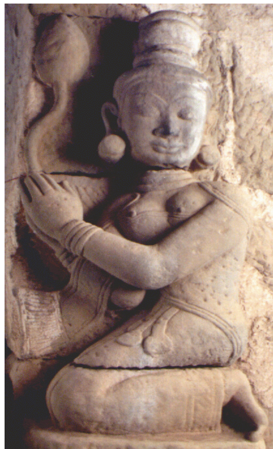
Dukhanthein temple, late sixteenth century - with a Portuguese man and an Arakanese lady paying obeisance to the Buddha from the central inner chamber.