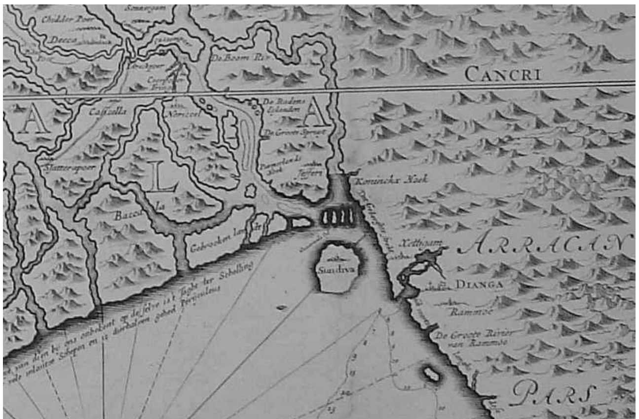
Two Bengal maps based on the 1666 survey by Johan van Leenen. Top a map of the Bay of Bengal with the Arakan coast c. 1690 by Isaak de Graaf; bottom detail of the Dhaka to Chittagong area from Valentyn c. 1726. 53