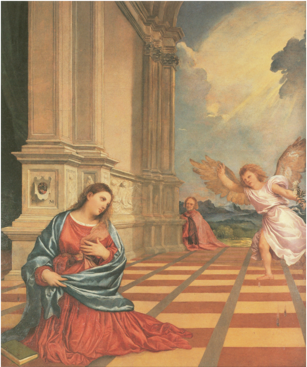
Colour plate 2. Titian, Annunciation , oil on panel, Treviso, Duomo, Cappella dell'Annunziata.