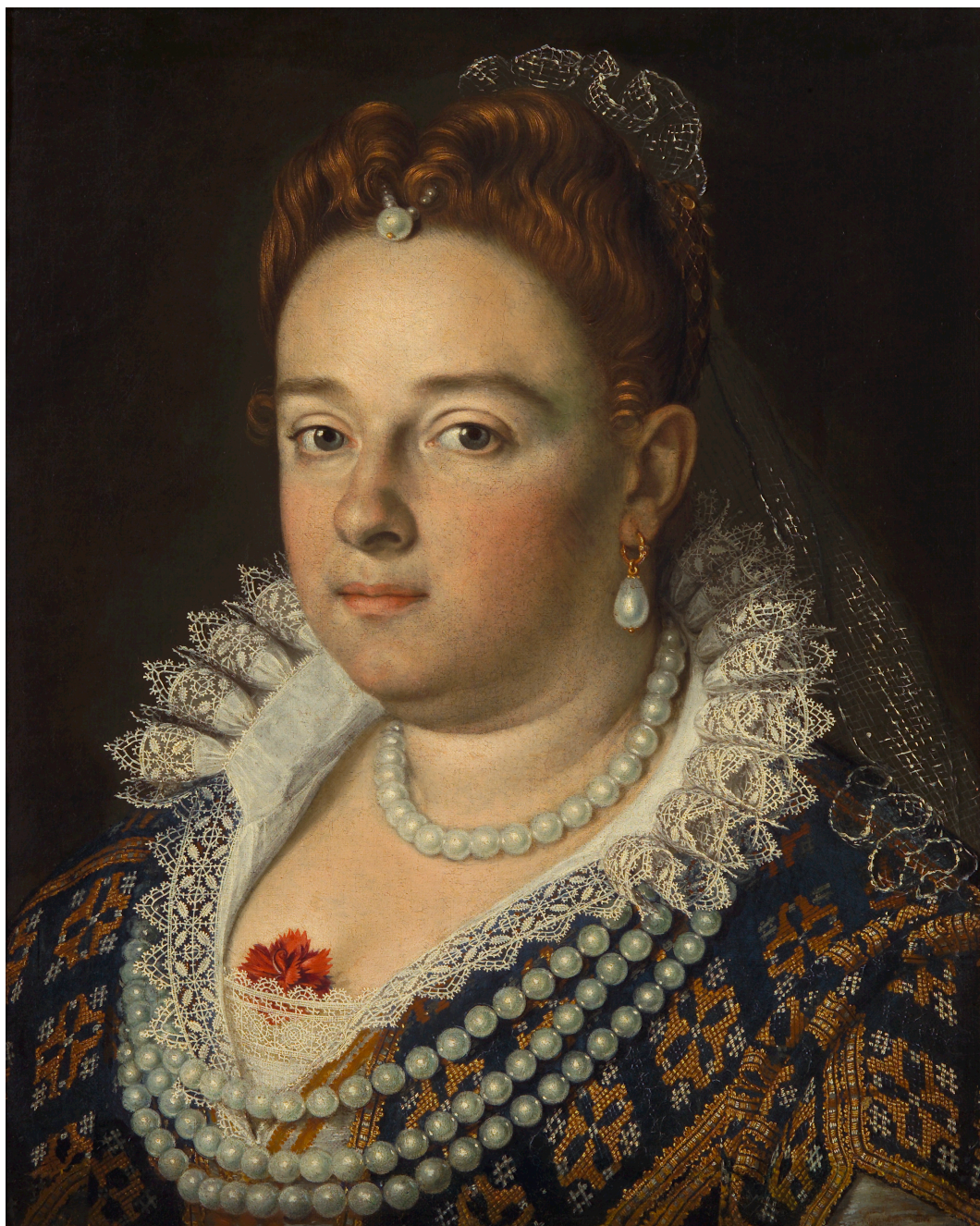
Colour plate 4. Scipione Pulzone, Portrait of Bianca Capello , oil on canvas, Innsbruck, Schloss Ambras.