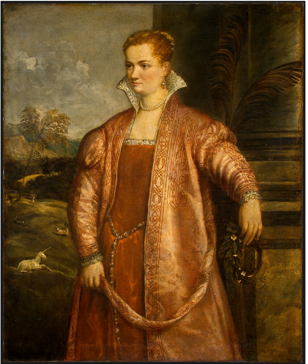
Colour plate 3. Zuan Paolo Pace and Titian, Portrait of Irene di Spilimbergo , oil on canvas, Washington D.C., National Gallery of Art, Widener Collection.