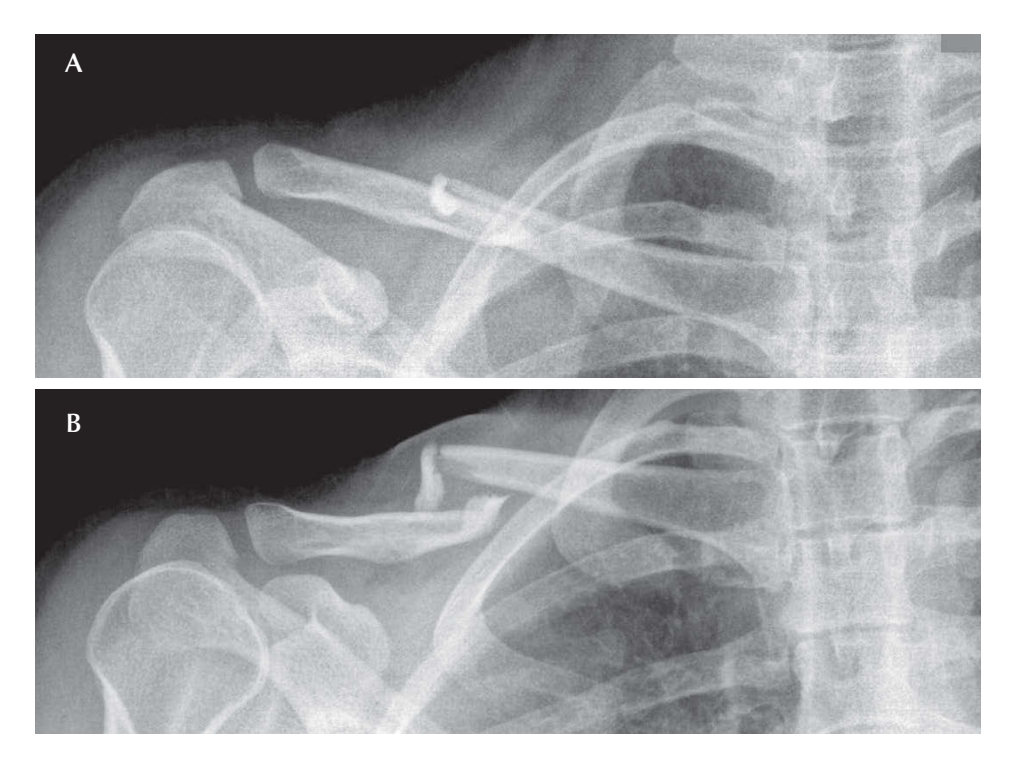
Figure 1. AP view (A) and 30-degree caudocephalad view (B) radiographs of one of the 15 midshaft clavicular fractures presented in the survey.

Fifteen patients were randomly selected from patients who had been treated in the Leiden University Medical Centre in Leiden, The Netherlands for a displaced or comminuted midshaft clavicular fracture in 2010. Their primary AP view and 30-degree caudocephalad tilt view radiographs, which had been routinely made, were retrieved from the hospital records. Figure 1 shows the radiographs of one of the included patients as an example. The 15 fractures were classified according to Robinson as 13 type 2B1 and 2 type 2B2 fractures.<sup>2</sup>