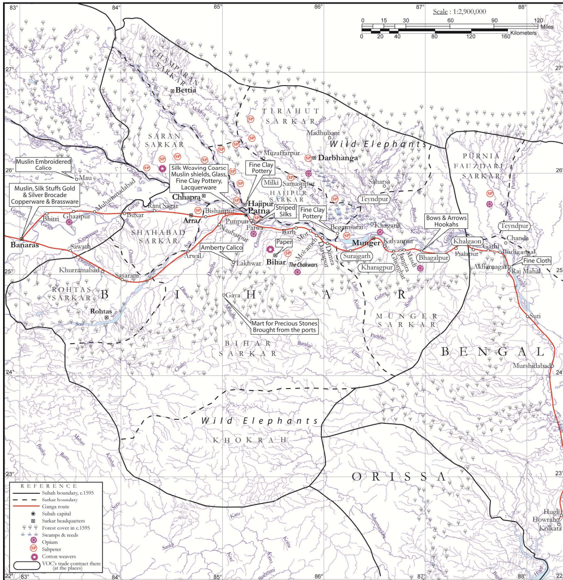
Map 3. The political and economic geography of Bihar in the early modern period. Adapted from Habib's An atlas of the Mughal empire .

through the rivers, in the drier parts, to the south of the Ganga, the overland Ganga Route (or the Mughal Trunk Route) gave access to Rohtas, Bhojpur-Shahabad, Bihar and Munger sarkars. While the headquarters of Mughal administrative units were at locations accessible by river or overland routes, the entire territory of a sarkar was by no means within easy reach of the Mughal cavalry. As a result, some remote areas, especially the hills and jungles to the south and the swamps and Terai areas far north of the Ganga, were only loosely integrated into the Mughal administrative framework. We will see this in more detail while discussing the informal political landscape. In the following paragraphs I shall first describe the formal political landscape.