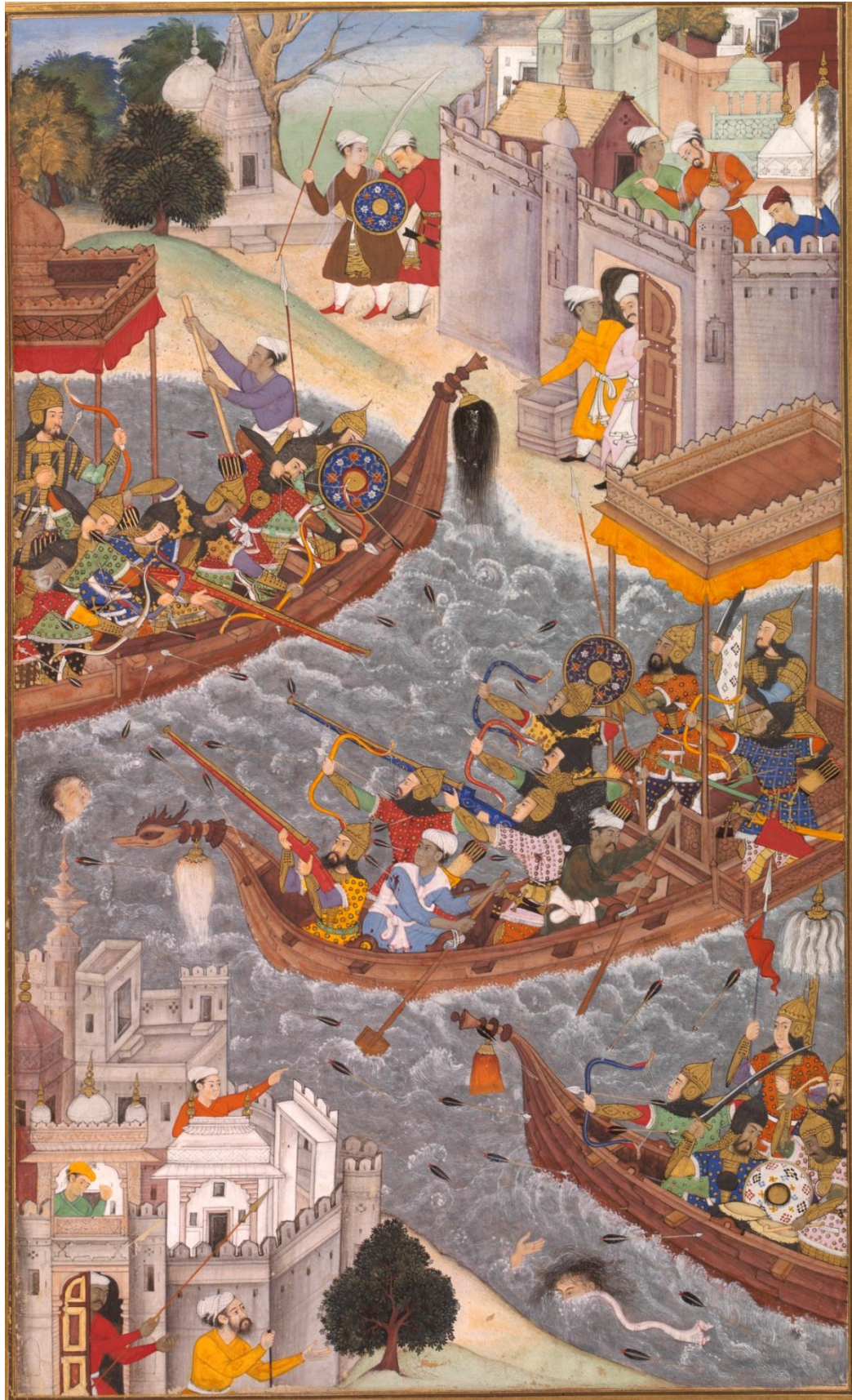
Figure 1. Battle on the Ganga in eastern India in the 1570s, source: The Akbarnama .