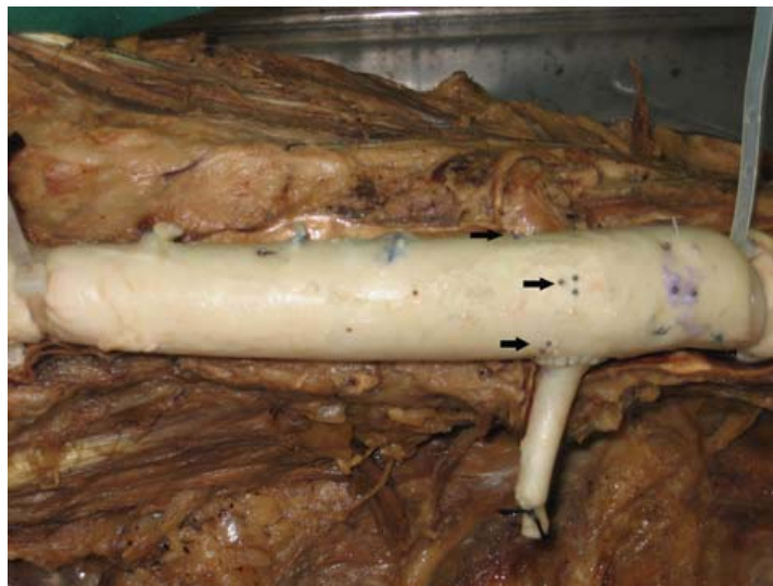
Figure 2. Model of the fresh pig aorta fixed to a human cadaver spine, complete with soft tissue. Three clusters of aortic reference markers are attached to the adventitia (arrows).

The perfusate of this artificial circulation was starch solution with the same viscosity as blood. To generate pulsatility, the model was connected to an artificial circulation set at 70 beats per minute with a 75 mL/s flow rate, which produced a physiological flow and pressure profile. 9,15 The pulsatility resulted in a luminal diameter change from 20.0 to 21.5 mm, as recorded in M-mode ultrasound with a 7.5-MHz linear array probe (ProSound SSD-5500; ALOKA, Tokyo, Japan). This diameter change was induced to simulate aortic diameter changes measured in vivo. 16-18