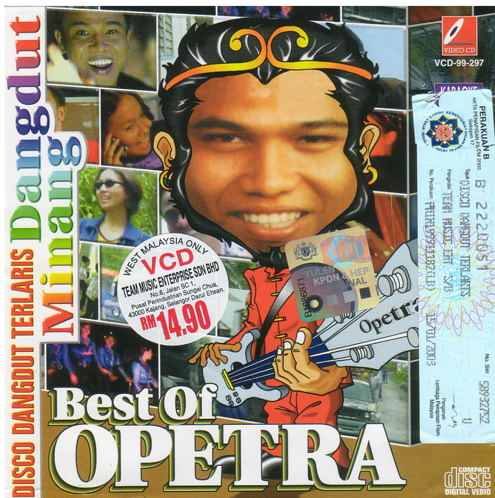
Figure 9.1: VCD cover of Opetra album Dangdut Minang (distributed by Team Music Enterprise Sdn Bhd, 2004) with the sticker of certification issued by the Malaysian Film Censorship Board

During my fieldwork in Malaysia, I did not see cassette shops and stalls selling recordings of Minangkabau verbal arts. But I know from some Chow Kit residents from Minangkabau that they bought such recordings on visits to West Sumatra. The reason that Malaysian producers and sellers do not sell recordings of Minangkabau verbal arts might have to do with the market segment: presumably these recordings would only be attractive to migrants who come from particular regions of West Sumatra, and they tend to be popular only among the older generations of Minangkabau perantau . So, from a marketing perspective, the production and sales of recordings in Malaysia likely are not considered to have the potential to be profitable.