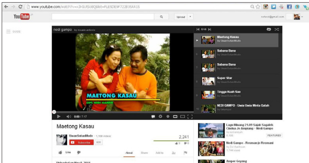
Figure 8.4: A posting of pop Minang on YouTube

My searching on YouTube also shows that products of the West Sumatran recording industry were uploaded to the website as early as 2007 and then in successive years (up to 2013). Some Minangkabau pop song albums were even uploaded in their entirety to YouTube. The number of viewers ranges from thousands to hundreds of thousands, indicating that enthusiasm for Minangkabau pop songs is quite high. This shows that YouTube has become a significant medium for disseminating the products of the West Sumatran recording industry.