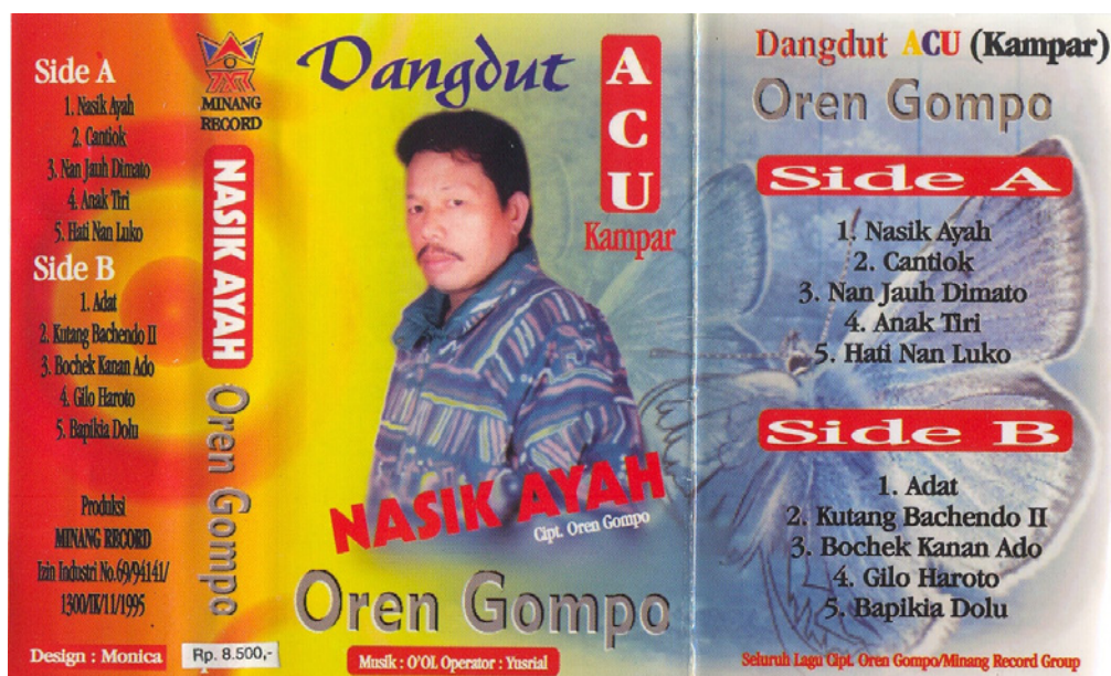
Figure 9.3: Cover image of a Kampar Acu cassette produced by Minang Record in Bukittinggi, 1995