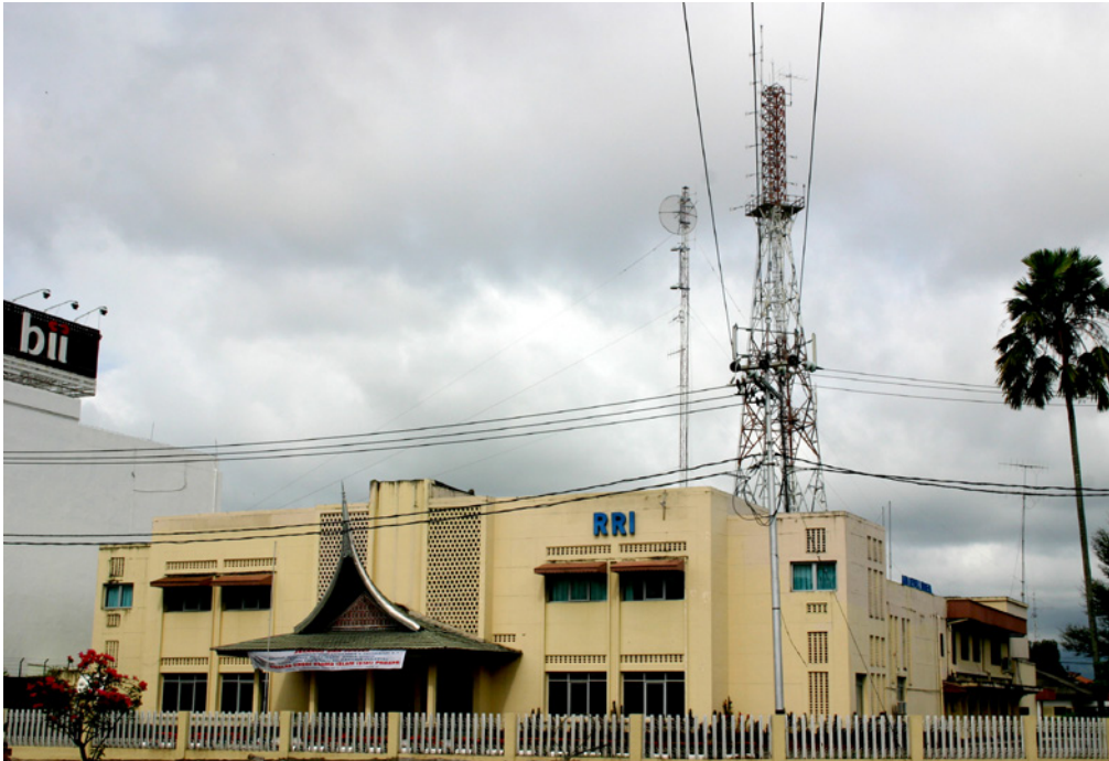
Figure 8.1: Radio Republik Indonesia Padang branch station, at Jalan Proklamasi No. 38A-B, Padang

1961) which hit West Sumatra severely, national soldiers ( tentara pusat ) sent by Soekarno's regime prohibited Minangkabau people from listening to the radio because the radio station operated by PRRI rebels from the Bukit Barisan jungle often broadcast propaganda in the Minangkabau language to seek support from the Minangkabau people in continuing their war against Soekarno's regime.