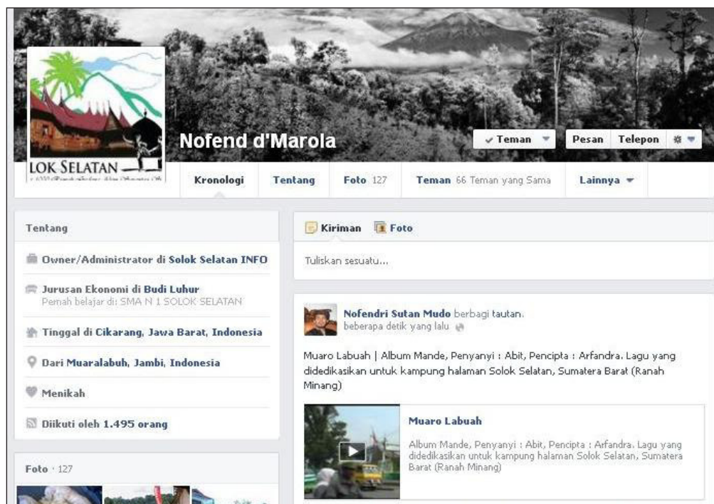
Figure 8.5: Pop Minang postings on Facebook walls copy-pasted from YouTube

Other postings present the transcription of pop Minang song lyrics. It is almost certain that most of the responders who comment on such postings are fellow Minangkabau. The non-Minangkabau responders can be identified from their comments. They state, for example, that they do not understand the song lyrics, and ask the person who posted the song to translate the lyrics into Indonesian.