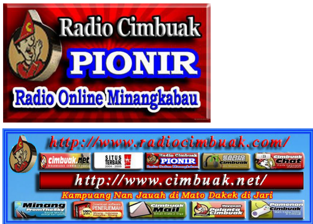
Figure 8.2: Virtual banners of Radio Online Minang Cimbuak, the pioneer of Minangkabau online radio that emerged among Minangkabau migrant communities in rantau ( https://www.facebook.com/groups/Radio.Online.Minang.Cimbuak/559147790814373/?comment_id=559158440813308&notif_t=group_comment_reply ; accessed 10-6-2013)

Belonging to type 4 of the aforementioned categorization, Radio Online Minang services aim to form a good relationship between Minangkabau migrants in rantau and those living in