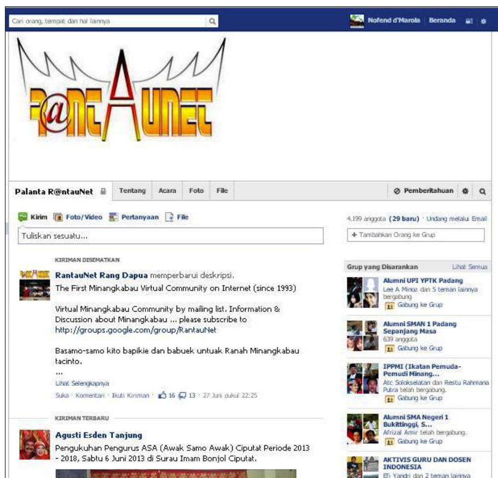
Figure 8.6: Front wall of Minangkabau ethnic-based Facebook group RantauNet

As can be seen in Figure 8.6, using a logo that is like a Minangkabau ‘big house’ ( rumah gadang ), the Facebook forum (also its mailing list counterpart) is called Palanta RantauNet . In