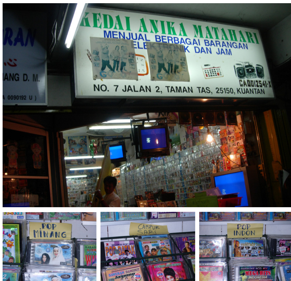
Figure 9.2: Music shop in the Malaysian city of Kuantan that sells Indonesian national and regional cassettes and VCDs (above) and its classification of types of Indonesian music (below) (photographs by Suryadi, 2005)

Kit: Minangkabau migrants form unions such as PIKM (Persatuan Ikatan Minang-Malaysia, 'Association of Minang Society in Malaysia'), and those from the same village seem to remain on very familiar terms with each other. For example, Minangkabau migrants from Sulit Air, a nagari in Solok regency in West Sumatra which became famous because of the success of its perantau in business in various rantau destinations in Indonesia and abroad, formed an association called Sulit Air Sepakat (SAS, 'Sulit Air in Harmony') Malaysia branch in 1996. 349