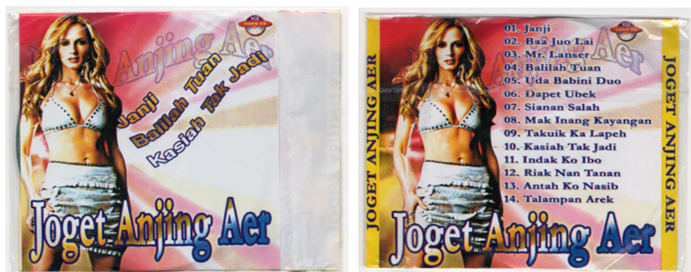
Figure 9.4: Front and back covers of a pirated Minangkabau VCD made and distributed in eastern Indonesia

Pilihan Minang Plones' ('Fourteen selected pop Minang songs in dangdut style', which consists of several volumes), 'Minang Bali Pili' ('Selected pop Minang songs'), and 'Joget Anjing Aer' ('Dance like an otter's motions'), but the titles of songs on the front and back covers are written in the Minangkabau language (Fig. 9.4). So, the pictorial and visual images of these VCDs (the cover and clips) do not always correspond with their audio aspects (the songs). These pirated VCDs are not distributed in West Sumatra.