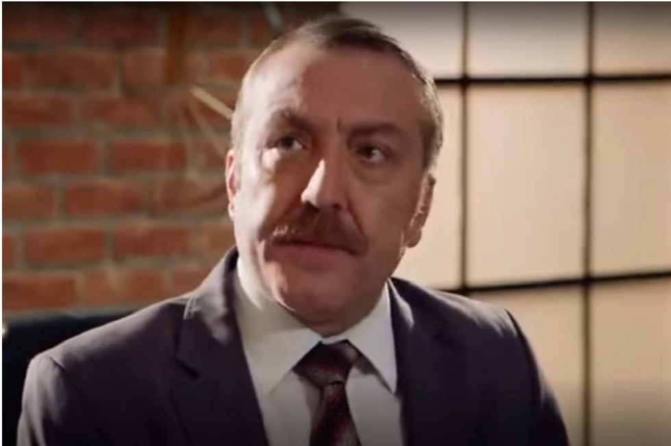
Plate 4: Erdoğan look-alike: Ötesiz İnsanlar final episode 1.26,04 min.