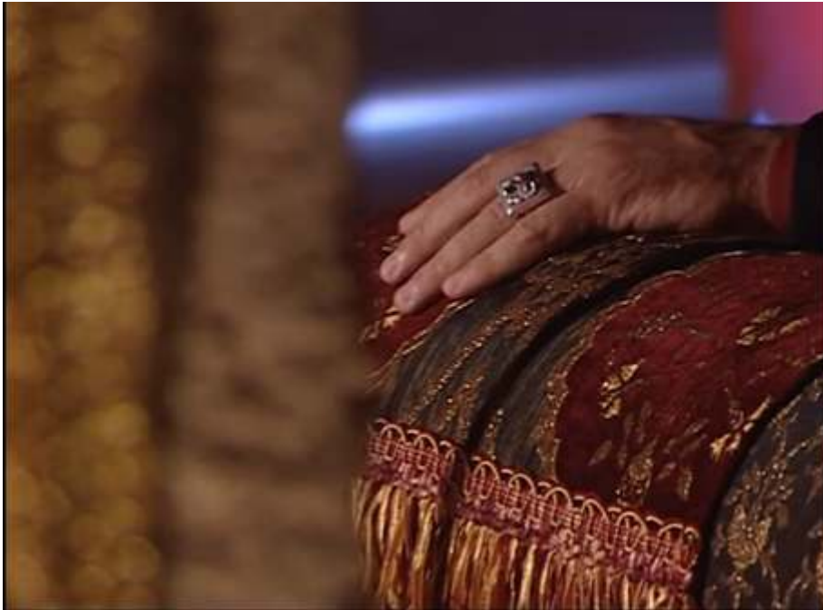
Plate 3: screenshot ring with Bapomet symbol Karar Kurulu [Decision board], Şefkat Tepe 5,04 min. 48