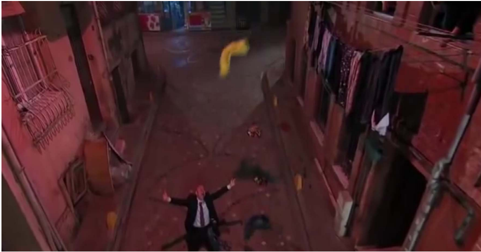
Plate 1: Screenshot Ötesiz İnsanlar , episode 11, 44,05 min.