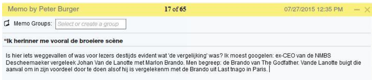
Figure 4. Memo 2:

‘I remember in particular the racier scenes from Last Tango in Paris.’