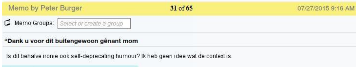
Figure 3: Memo 1: ‘This is irony, but is it also self-deprecating humor? I have no clue about its context.’