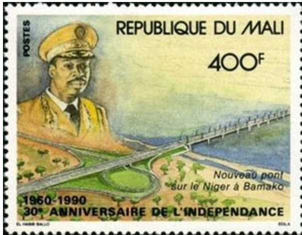
Illustration 3: The 1990 stamp to commemorate the thirtieth anniversary of Mali's independence. This stamp is the only one showing Moussa Traoré's portrait. Leaders of Mali seem to have been reluctant to allow their portraits to be placed on stamps, a phenomenon which cannot be explained simply by Islam's prohibition of pictures of people (cf. note 10) for many countries presenting themselves as Islamic issue numerous stamps showing portraits of their Heads of State. 15

issued each year; indeed overprints dating from those years outnumber new issues. The most interesting stamp from that period is probably the 1990 issue of 'Pont sur le Niger et portrait du chef d'Etat' (Yvert & Tellier), the only stamp with Moussa Traoré's image (see illustration 3).