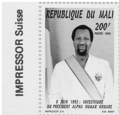
Illustration 4: This stamp from 1995 celebrates the 1992 election of Alpha Oumar Konaré as president of Mali. It was printed in Switzerland and so far is the only stamp from Mali dedicated to Mali’s first democratically elected president.

with images of film stars, rock stars, flowers, the Olympic games, mushrooms, butterflies, dinosaurs; and there were Pope John Paul II, ‘Lady Di’, chess, space travel, painters, cartoons, scouting, and many other topics – often in combinations on the same stamp. Those stamps were issued quite definitely to serve collectors of topical stamps.