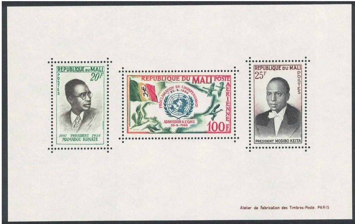
Illustration 2: Souvenir sheet of the three airmail stamps celebrating Mali's membership of the United Nations. This series is the only one with images of Mamadou Konaté, a leading politician who died in 1956, and Modibo Keita, Mali's first president (cf. comments to the next illustration). One notes Mali's flag in 1960 (see note 11). 12

Like most African postage stamps from the period, those of Mali in the 1960s represent a vision in which traditions of agriculture, fishing, and artisan crafts are harmoniously combined with modernization and campaigns against lethal diseases. Moreover, such stamps highlight pan-African events, beautiful flowers and magnificent animals, great inventions and important sporting events, as well as great politicians of the world, from Lumumba to Lincoln. Most of the stamps are relatively small in physical size, often smaller than 2.5 by 3.5 centimetres. From the