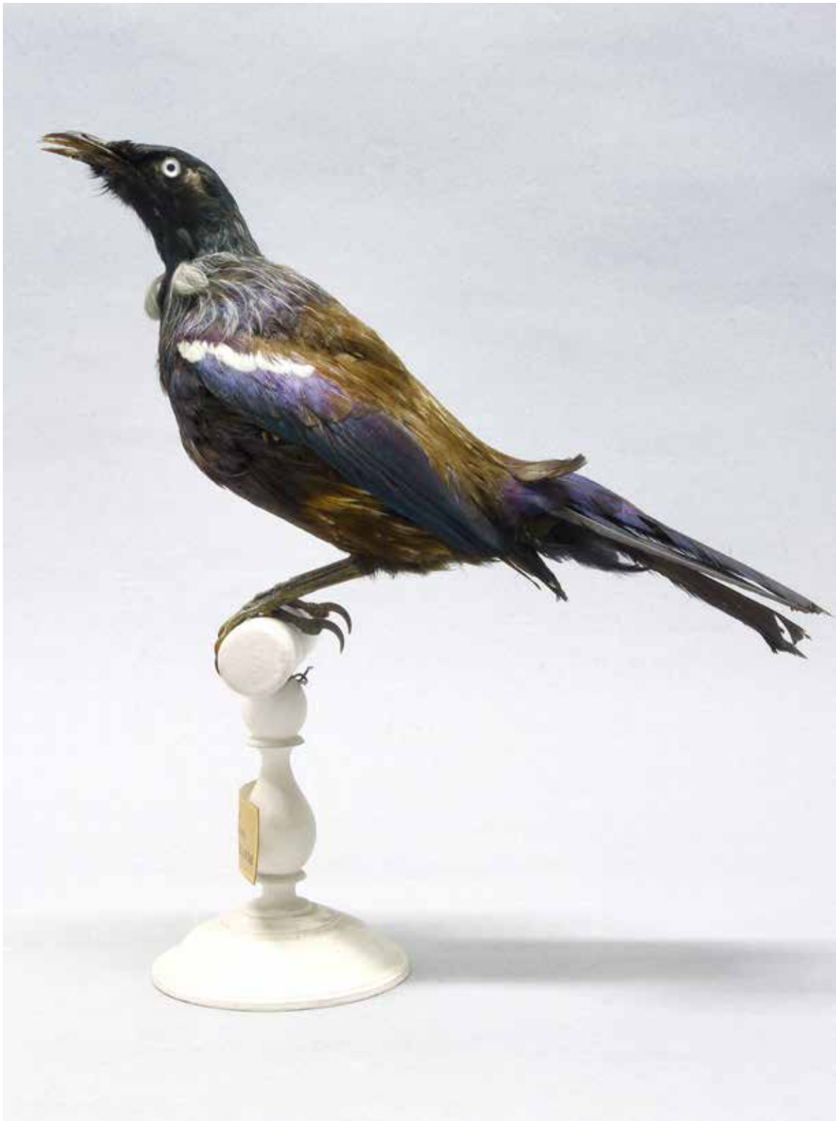
Fig. 3-051 | TUI Prosthemadera n novaeseelandiae , 23 February 2015, MNHN-ZO-2014-432. Collected at Dusky Sound, South Island, New Zealand, 6-21 December 1801, arrived at 18 July 1804 in France aboard the Géographe .