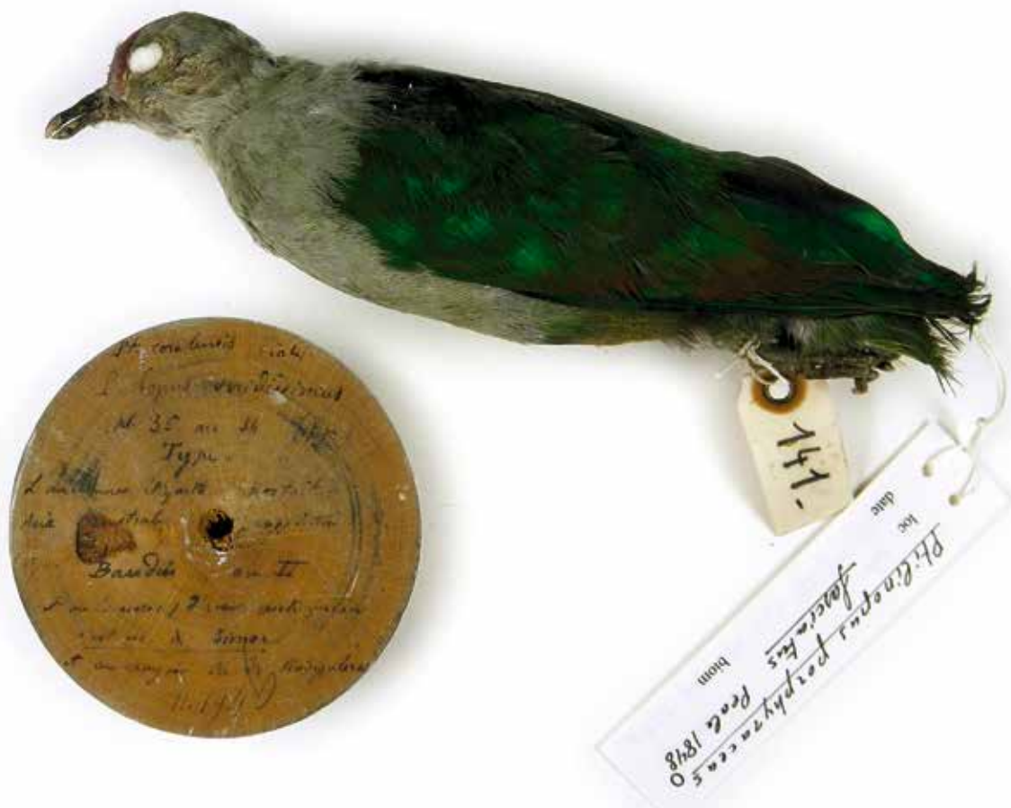
Fig. 3-050 | SAMOAN FRUIT DOVE Ptilinopus fasciatus, 28 February 2015, MNHN-ZO-2005-2563. Collected on Samoa, caught in 'September or October 1802' and shipped alive on Le Naturaliste. It arrived alive in France at 7 June 1803, but died soon after.

pièce d'étoffe de plusieurs aunes de longueur en trois doubles, dont l'un noir, l'autre jaune, le 3e jaune strié de noir" ("Large piece of fabric several yards in length in three doubles, one black, the other yellow, the third streaked with black"). The striking colors indicate that this may have been a feather cloak made from the black and yellow feathers of the Hawaii Mamo Drepanis pacifica and Hawaii Oo Moho nobilis .