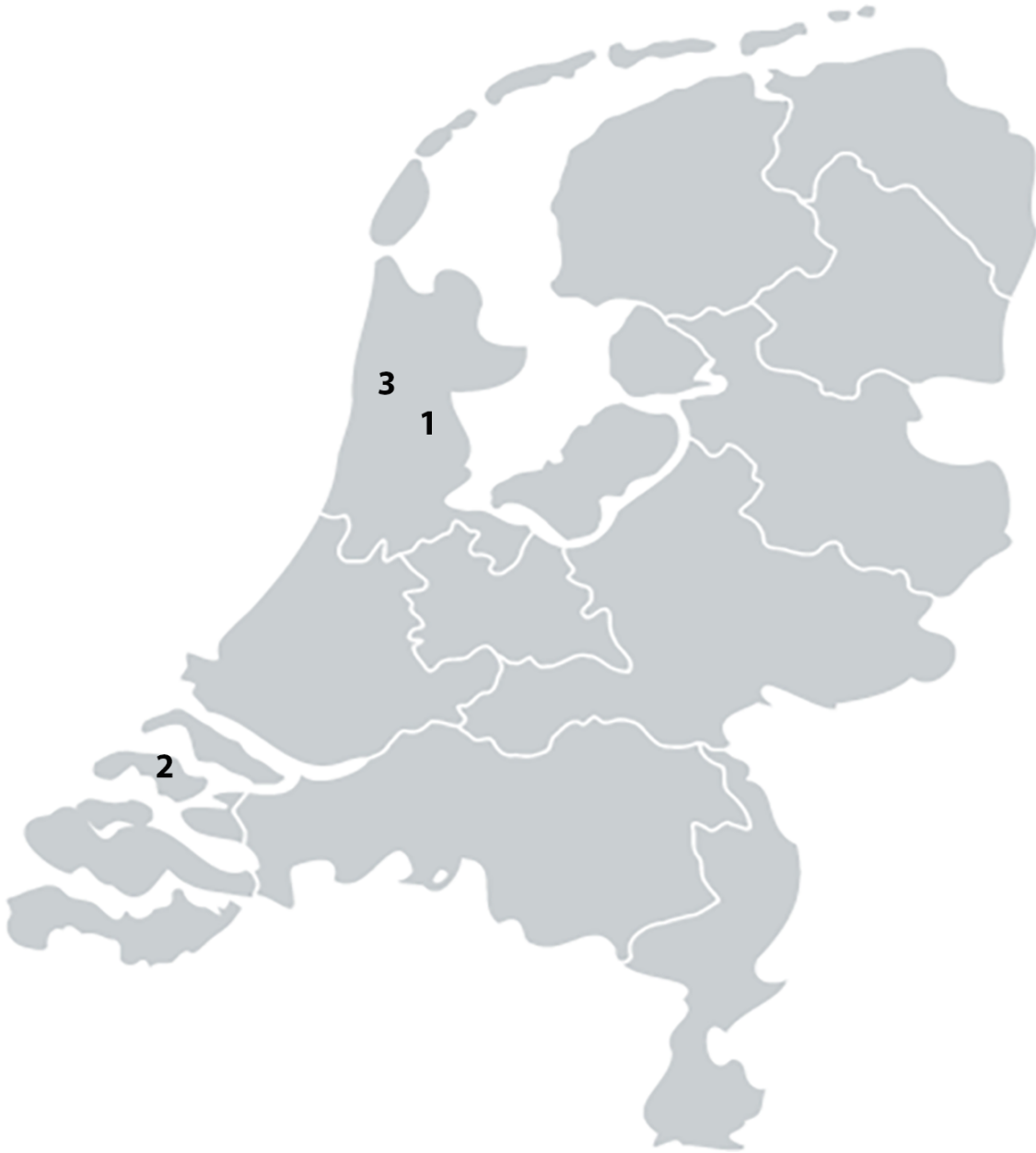
Figure 1. Map of the Netherlands with locations of the three sites: Middenbeemster (1), Klaaskinderkerke (2), Alkmaar (3).