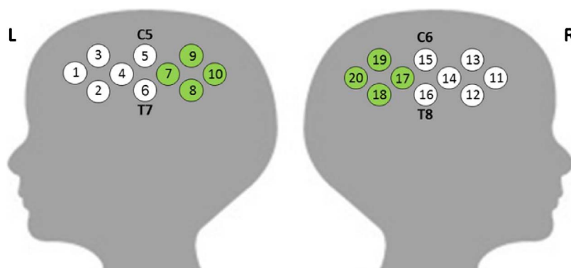
Fig. 1. Location of the NIRS channels over the left and right hemisphere, relative to 10–20 positions T7 and T8. Channels within the Region of Interest are marked green.

To assess Negative Affect in infants, parents were asked to complete the Infant Behavior Questionnaire – Revised – Short form (Gartstein and Rothbart, 2003; Putnam et al., 2014). This questionnaire consists of 91 questions regarding the behavior of the infant in a multitude of possible situations over previous week(s). Questions are rated on a 7-point Likert-scale (1 = never; 7 = always). Four scales are used to measure Negative Affect (25 questions): fear, distress to limitations, rate of recovery from distress, and sadness (Cronbach's \alpha in our sample was 0.75). Negative Affect thus gives an indication of how frustrated or negative infants react to situations, people and their general environment with a minimum score of 1 and a maximum of 7, with higher scores indicating higher level of Negative Affect . Mean score on Negative Affect was 2.5 (range: 1.33–4.07; SD = 0.66) for the infants included in the analysis.