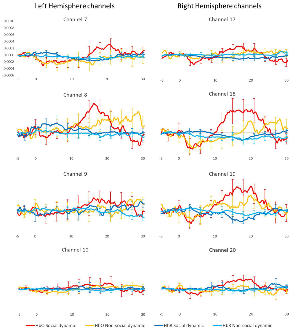
Fig. 2. Grand mean average time courses with Standard Error of HbO and HbR changes in millimolar (mM) as a function of time (stimulus block starts at 0) for each of the experimental conditions in the posterior temporal channels.

these children as there was no association between Negative Affect and either the number of excluded infants or the number of valid trials or channels within the included infants.