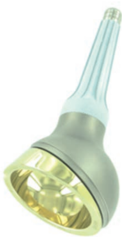
Figure 1. The LUMiC prosthesis consists of a separate cup and stem, both available in different sizes and with different coatings (reproduced with permission from implantcast).

(implantcast, Buxtehude, Germany). The LUMiC prosthesis is a modular device, built of a separate stem (hydroxyapatite [HA]-coated uncemented or cemented) and acetabular cup (figure 1). The stem and cup are available in different sizes (the latter of which is also available with silver coating for infection prevention) and are equipped with sawteeth at the junction to allow for rotational adjustment of cup position after implantation of the stem. We hypothesized that aforementioned features would lead to a lower risk of aseptic loosening, dislocation, and infection and better restoration of lower limb function. The current study was initiated to evaluate the short-term clinical results of this implant.