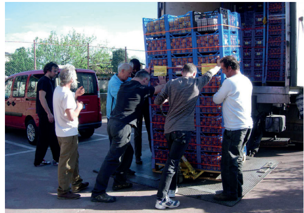
Figure 4. 'Orange landings' (Sbarchinpiazza) in Bergamo, April 2012.

To give you a concrete example of what I mean, let's start from a picture of a Solidarity Economy Network in Italy. Here, critical consumers organize themselves to create so-called 'short food chains'. In the photo, members of a Solidarity Purchase Group in Northern Italy have bought a truck-full of oranges from a cooperative of farmers in Sicily (about 1300 km away). The growers cultivate lands confiscated from the mafia (which notoriously thrives on agribusiness: Forno 2011). The 'consumers' unloading the truck are performing together a political role together through their collective purchase. Is