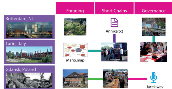
Figure 3. Comparing network types by context. Diagram and photos courtesy of Federico de Musso, Jaro Stacul, Cinzia Terruzzi, and Orti Urbani.

Comparing by context , we will match these participants' narratives with each other, across three locations and three cross-cutting types of action (foraging, short food chains, and local governance), using digital media to navigate multiple types of materials: texts, photographs, maps, audio recordings, edited footage, or audiovisual material produced by research participants.