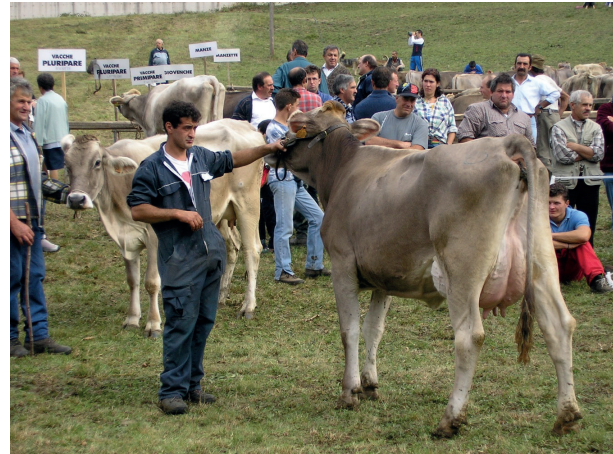
Figure 2. Cattle fair, Valtaleggio, Italy, 2004. The ‘queen’ of the fair is being paraded.

Skilled visions are not innocent: they always incorporate assumptions and criteria of preference. They may well presume a body of knowledge that defines a derogatory and exploitative gaze on an objectified other. It is this presumed body of knowledge that allows the viewer to interpret a range of cues within a process of recognition . This body of presumed knowledge may well consist of cultural stereotypes, racism, sexism, or exploitative views on nature and animals. Thus skilled visions are part and parcel of the ambivalent privilege of culture (Herzfeld 2007).