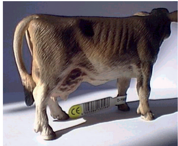
Figure 1. Plastic toy cow made in China for Schleich, Germany, 2001.

In the case of dairy cows, their functional beauty represents 'traits' that stand for good milking and reproduction potential. Such traits are standardized and disseminated through internationally recognized models, but also incorporated in everyday artefacts such as plastic toys, photos and trophies. These items populate everyday conversation and play, public events and domestic interiors, and thus confirm a certain way of viewing animals as 'good looking'.