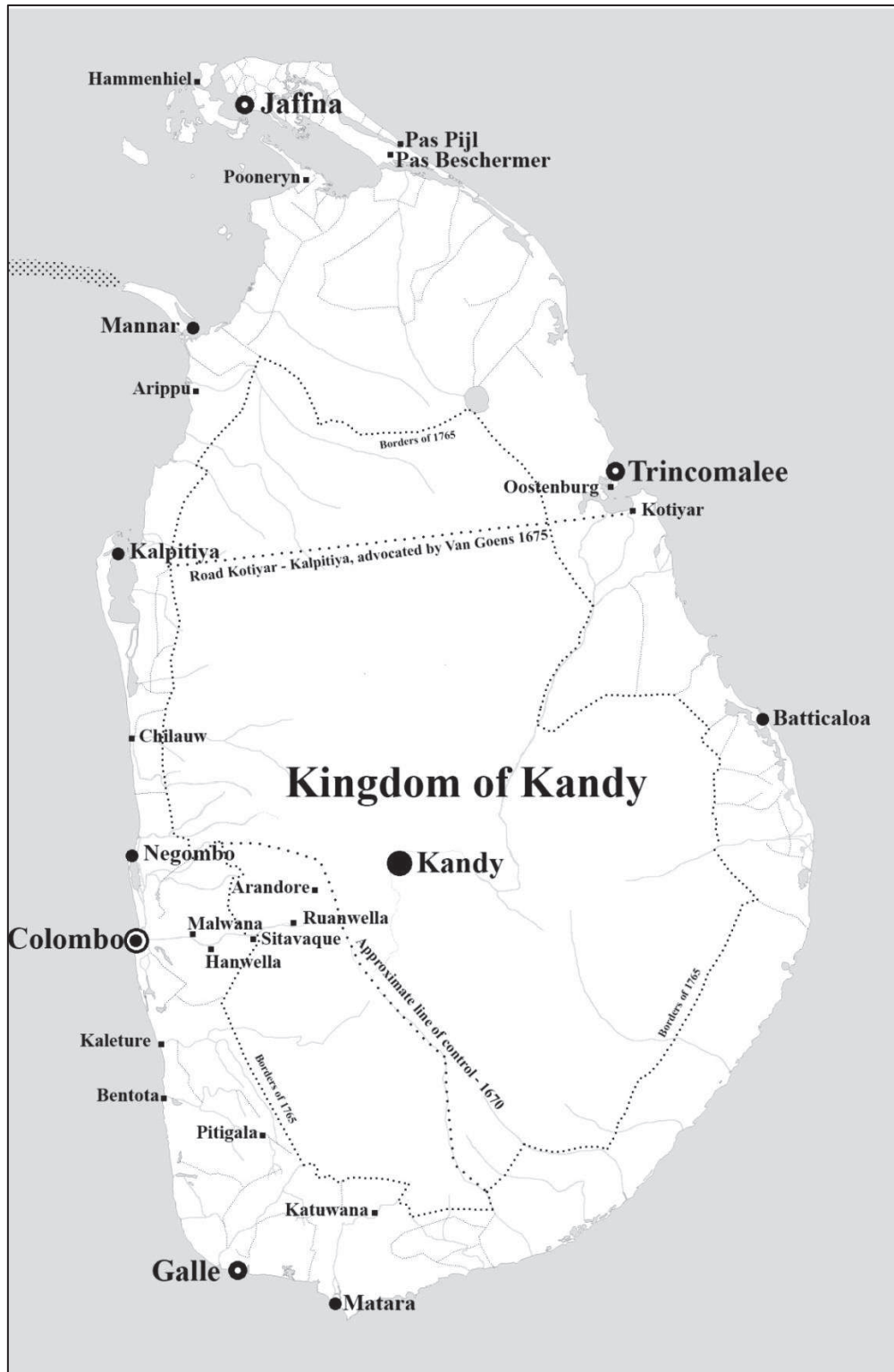
Figure 20: Political map of Ceylon 1670

Source: Goonewardena, Dutch Power in Ceylon . as a base map the British 1805 map by A. Arrowsmith was used, as this precisely showed the positions of forts and the existing borders. As reference, the post 1767 borders are also shown, illustrating the territorial control in the west in Van Goens's period.