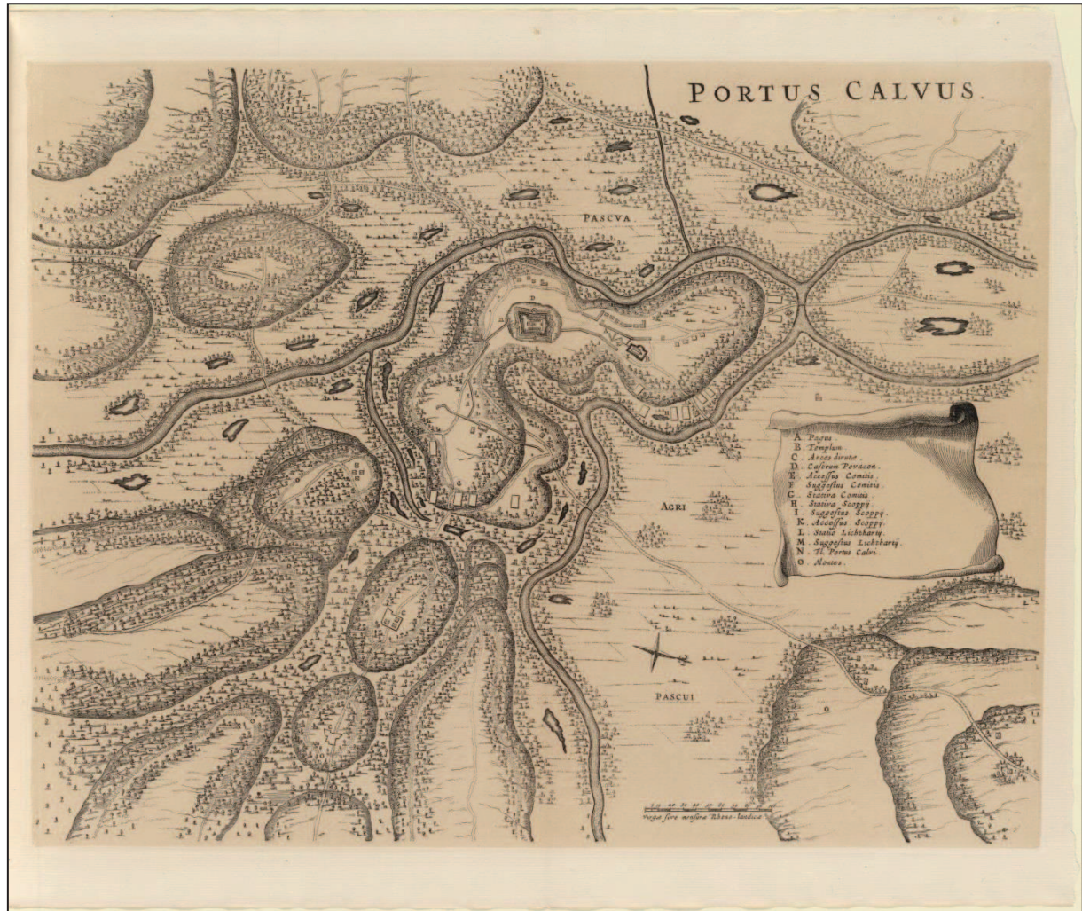
Figure 12: The Siege of Porto Calvo according to Johan Maurits