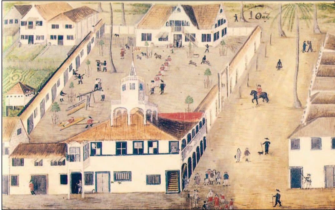
Figure 8: Johan Maurits' house in Recife

The next step in building a court was the construction of accommodation fit for a nobleman-governor. Initially, Johan Maurits found accommodation in one of the houses in Recife itself. This house was recorded by Zacharias Wagenaer in his Thierbuch (see Figure 8).