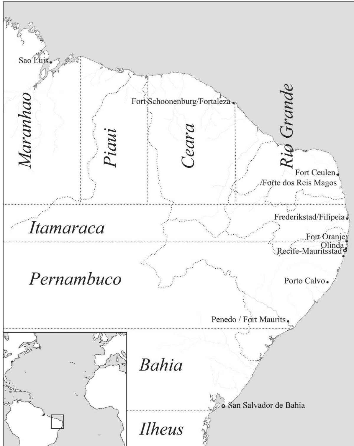
Figure 10: Map of northeastern Brazil showing the important forts and cities