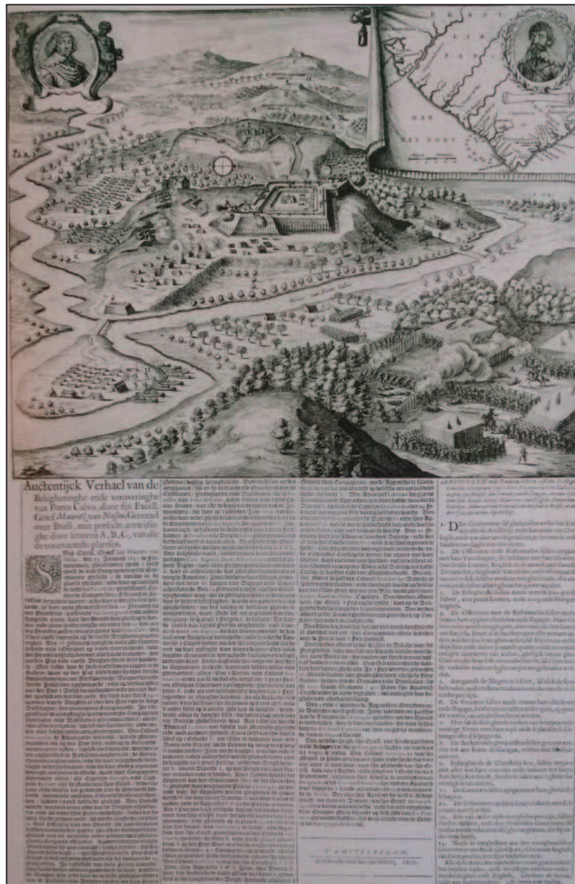
Figure 11: News-map of the Siege of Porto Calvo