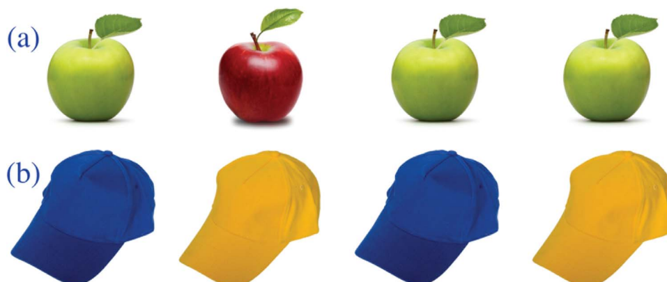
Fig. 1. Example trials of the social mindfulness task (SoMi), displaying (a) an experimental trial (3:1 ratio presentation) and (b) a control trial (2:2 ratio presentation). The stimulus was displayed for 5000 ms, followed by an inter-stimulus interval (0, 1000, or 2000 ms).

The SoMi task requires that the participant and a (fictitious) second person each choose one item from a set of four among which one is unique and the rest identical (e.g., three green apples and one red apple, see Fig. 1) (Van Doesum et al., 2017). The paradigm has been