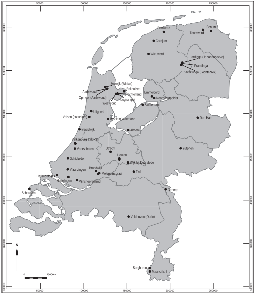
Figure 6. Map of locations in the Netherlands where Holocene remains of brown bear were found. Drawing: W. Laan (Archol).

and Luxembourg was more or less the same. It is possible that bears were still present in the southern and eastern parts in these countries until the 12 th century (Ervynck 1993).