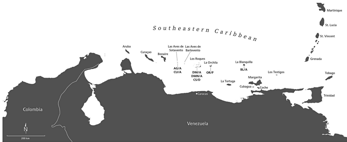
Figure 1. Venezuelan Caribbean islands and archaeological sites discussed in this paper within the geographical context of the Southeastern Caribbean.

Sal (Antczak and Antczak 2006). Next is the La Orchila Island group represented by the OR/F site at the locality of Los Mangles (Antczak and Antczak 1989). The bearers of the Valencioid and Ocumaroid cultures from the north-central Venezuelan mainland established campsites in Los Roques and on La Orchila Island where specialised groups of adult and adolescent males extracted, processed and preserved such marine resources as queen conch, reef fishes, turtles, and birds for both in situ and delayed consumption (Antczak and Antczak 1991a, 1999). The last site, BL/E, is situated on La Blanquilla Island. The bird remains from this site were attributed to more recent unidentified post-Saladoid occupants of the site dating to after AD 900 (Antczak and Antczak 1991b). All remaining indigenous temporary occupations of the islands discussed here occurred between ~AD 1000 and 1500 (Antczak and Antczak 1993, 2006).