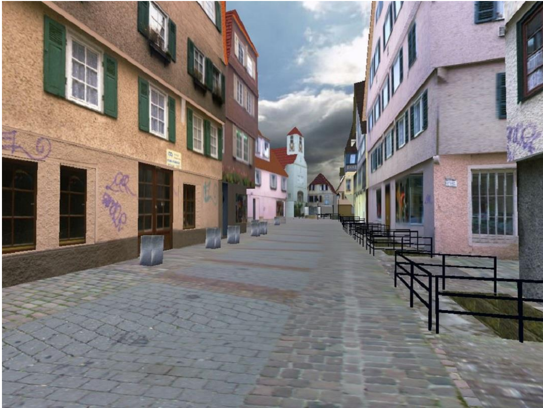
Figure 1. Impression of Virtual Tübingen.