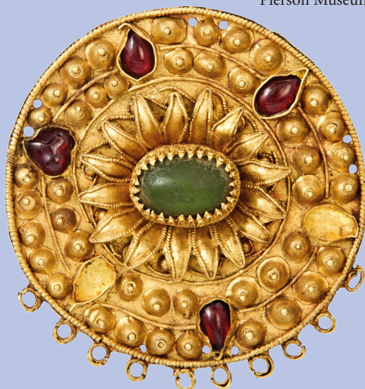
FIGURE 3. Brooch (Scythian, 900-100 BC). Gold gemstone and green glass. Loaned to the Allard Pierson Museum.