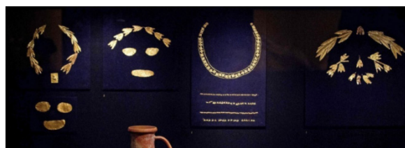
FIGURE 8. Headline from Andrew Roth's article in The Washington Post .

to allow the Crimean treasures to remain in the Crimean Museums.