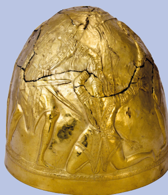
FIGURE 4. Helmet (Scythian, 900-100 BC). Gold. Loaned to the Allard Pierson Museum.