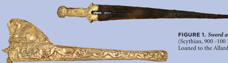
FIGURE 1. Sword and Scabbard (Scythian, 900 -100 BC). Gold. Loaned to the Allard Pierson Museum.