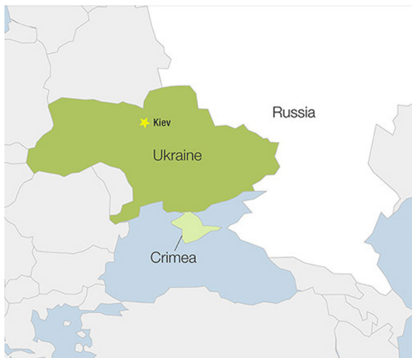
FIGURE 6. Map showing Ukraine and Crimea in relation to Russia.