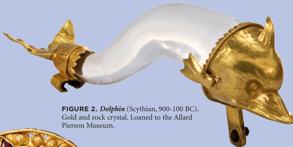
FIGURE 2. Dolphin (Scythian, 900-100 BC). Gold and rock crystal. Loaned to the Allard Pierson Museum.