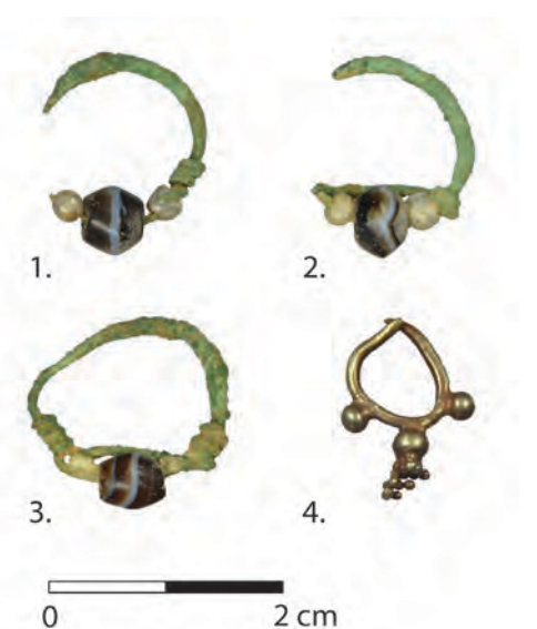
Figure 8. Earrings made of bronze and gold, from the cist graves at the site of QUR-2 (nos. 1–3) and from one of the ring cairns at QUR-9 (no. 4).

surface. True inhumations, in the sense of burial pits dug into the ground, seem to occur relatively late in the local sequence, namely, from the fourth century C.E. or Byzantine period onwards.