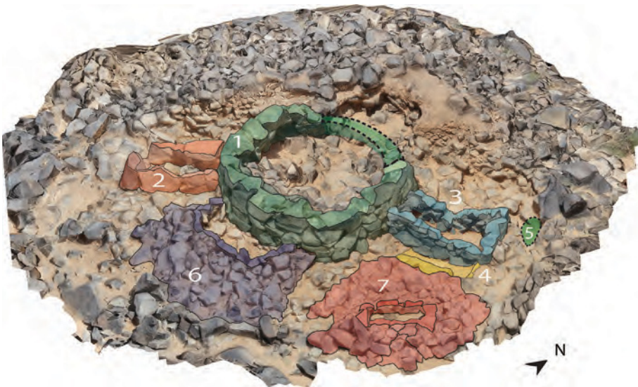
Figure 6. A 3D image of the tower tomb and its associated burials at the site of QUR-2 in the Jebel Qurma region: (1) central tower tomb of the first century B.C. to first century C.E.; (2–5) cist graves (and remnants thereof) of the first to second century C.E.; (6–7) late Ottoman to colonial-period Islamic cairns. Indication of scale: the central tower is 4.8 m in exterior diameter.