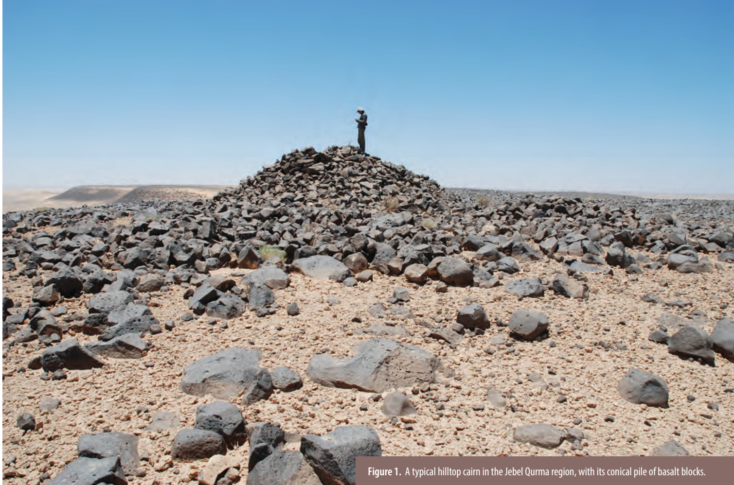
Figure 1. A typical hilltop cairn in the Jebel Qurma region, with its conical pile of basalt blocks.