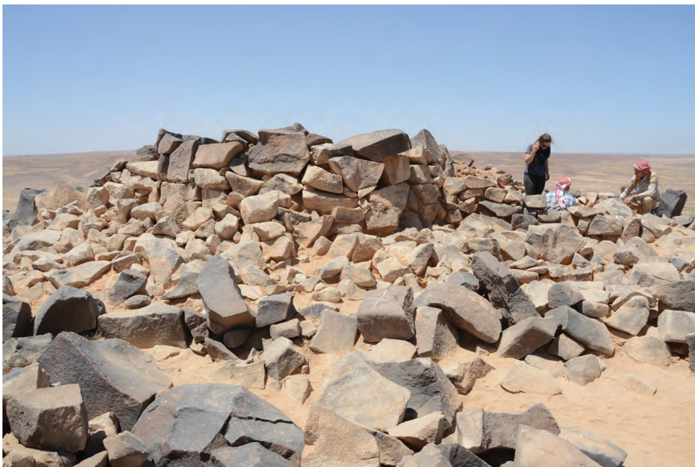
Figure 4. The tower tomb at the site of QUR-2, with its straight façade made of large basalt slabs. Many of these building stones weigh around 200–300 kg, suggesting that the construction of the tower was the work of a team instead of an individual.