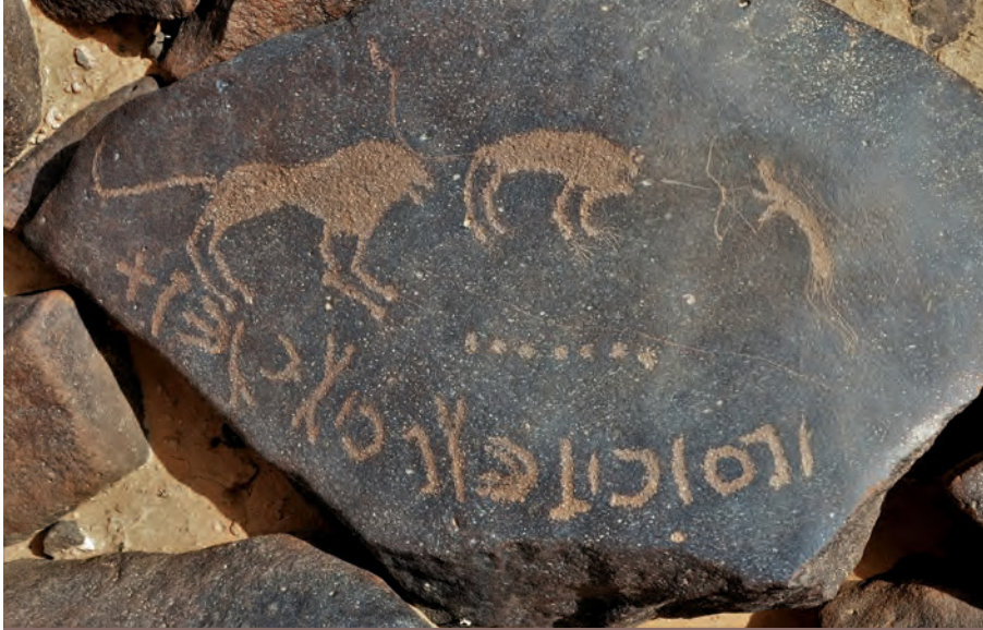
Figure 5. A beautiful piece of rock art from the burial site of QUR-529, showing an archer hunting two lions. The associated inscription in Safaitic reads: l rgl bn zmhr bn 's h-hyt , which is translated "By Rāgel son of Zamhar son of 'Aws are the animals."