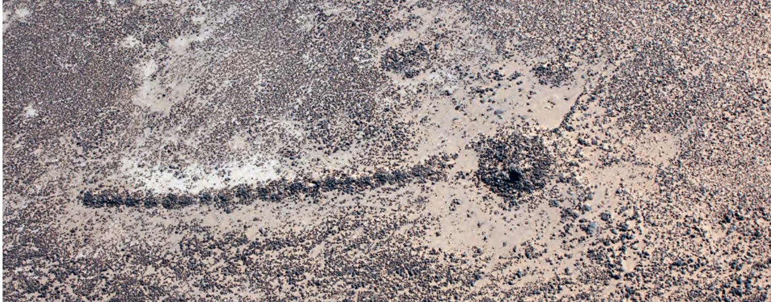
Figure 10. Aerial photo of a “pendant burial” in the Jebel Qurma range. The chain consisting of about twenty small, individual cairns leads to the left of the large cairn at the head.