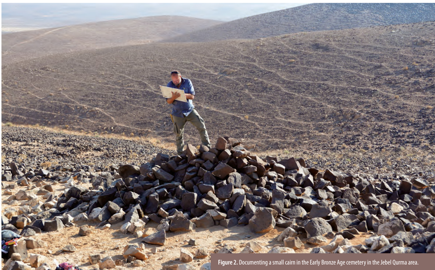
Figure 2. Documenting a small cairn in the Early Bronze Age cemetery in the Jebel Qurma area.