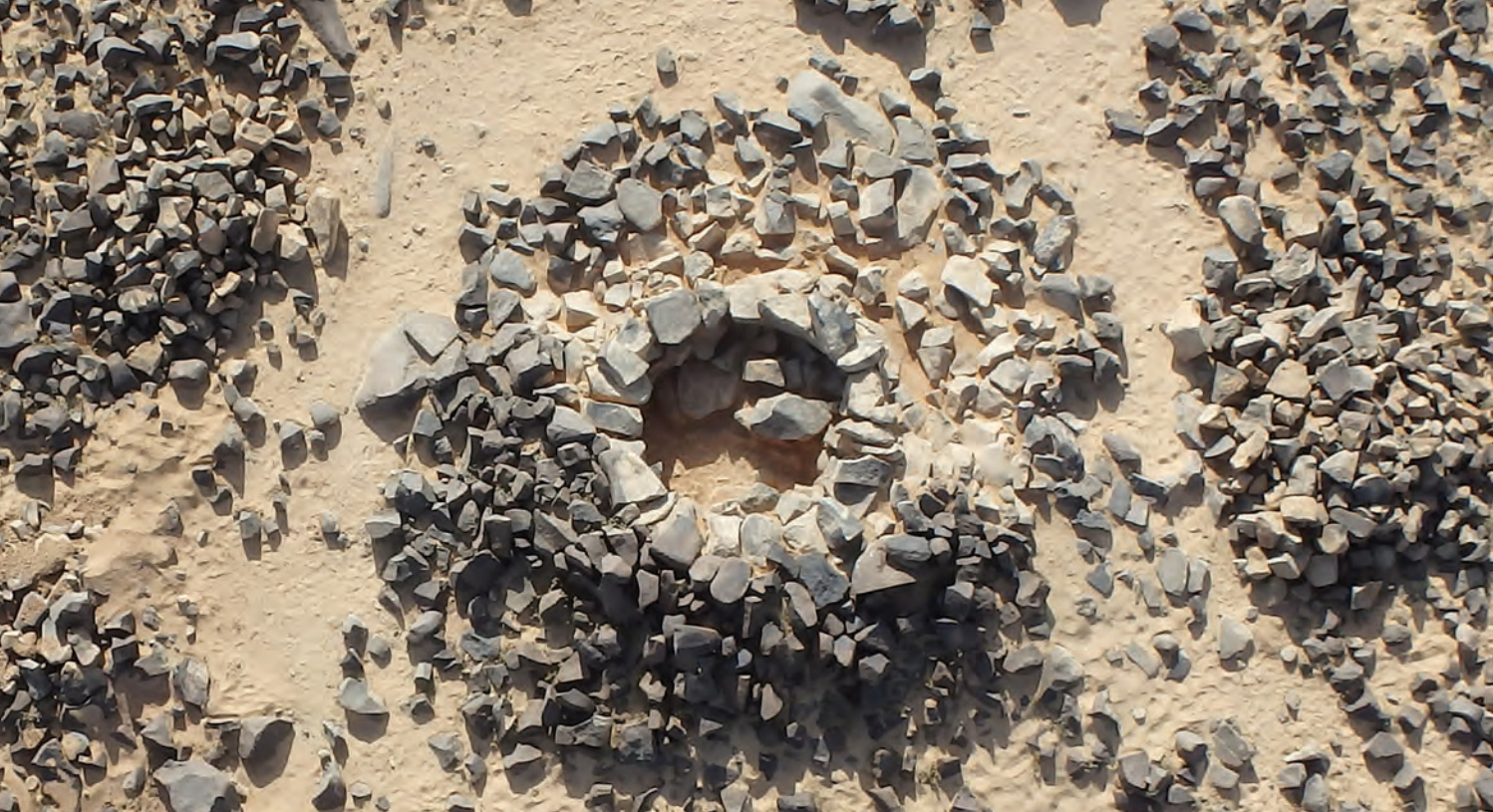
Figure 9. Aerial photo of a typical “ring cairn” at the site of QUR-9 (structure 5). The circular burial chamber in the heart of the cairn is clearly visible, with a cover of basalt blocks around it.

century C.E., although many preexisting cairns received new interments long after that. Cairns, it appears, were avoided for the disposal of the dead during almost the entire Islamic period and only were commonly reused for graves from the (late) Ottoman period onwards. The latter observation is at odds with commonly held perceptions of the Muslim treatment of the dead; however, Jenny Bradbury has recently (2016) argued against an idealized, static, or uniform portrayal of Islamic burial practice, underscoring instead the considerable variation over time and space.