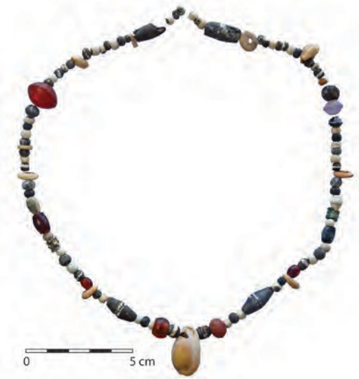
Figure 7. A colorful necklace with beads made of stone, glass, and shell, from one of the cist graves at the site of QUR-2.