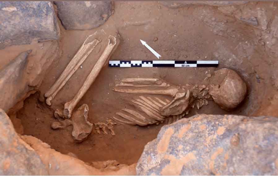
Figure 12. The grave of a young man, buried in an extremely contracted position on his side inside the ring cairn 9 at QUR-9. The well-preserved skeletal remains were radiocarbon-dated to 425–580 cal C.E. (95.4% reliability).

B.C.E. and the first century C.E., although they appear to have been reused repeatedly for burial in later periods.