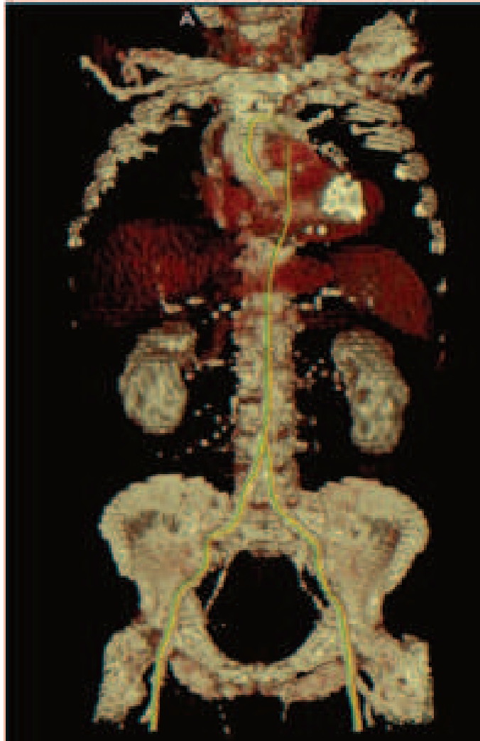
Fig 2.2. Three-dimensional volume rendering and the extracted vascular centerline (yellow curve).