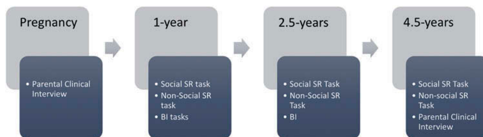
FIGURE 1 Time flow of the current study. Mothers and fathers of each participating child joined the lab visit at each measurement point. At 2.5 and 4.5 years measurement, there was also a home visit. SR = Social referencing; BI = behavioral inhibition.

At 2.5 years, BI was observed in eight observational tasks derived from the Lab-TAB (Goldsmith, Reilly, Lemery,