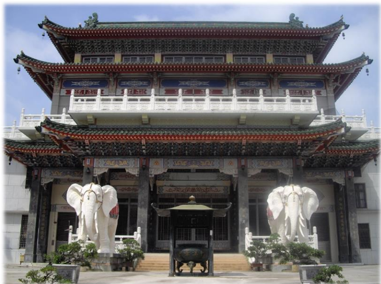
Figure 5: Modern façade of Zhuxi Temple.