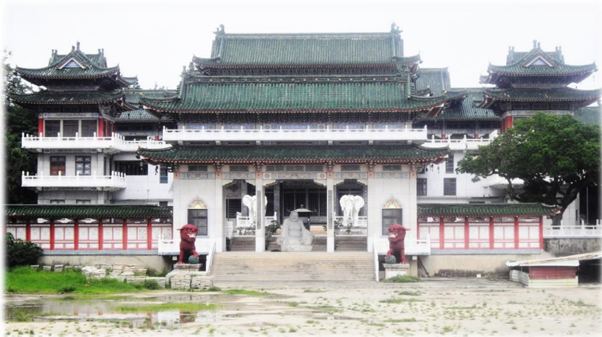
Figure 6: Modern façade of Zhuxi Temple.