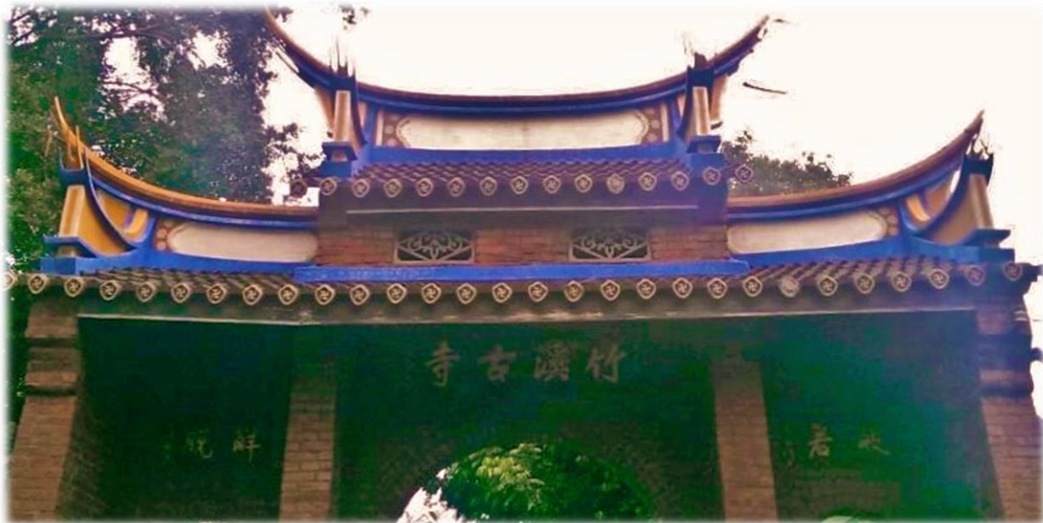
Figure 7: Older gate of Zhuxi Temple.