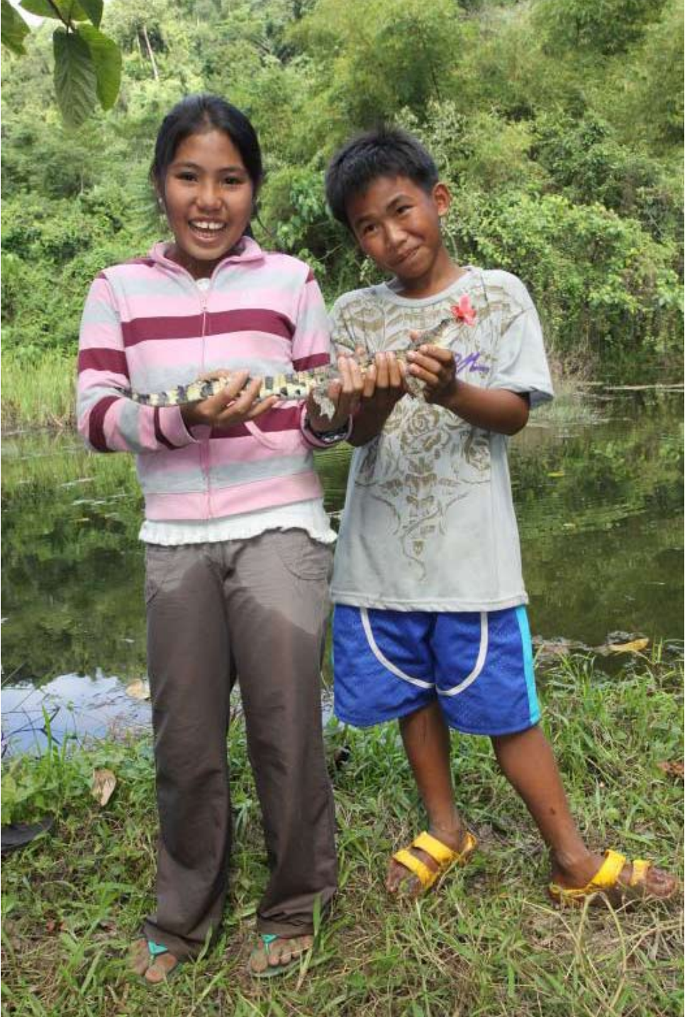
Figure 3.7: Schoolchildren release a captive-raised juvenile Philippine crocodile into the wild.