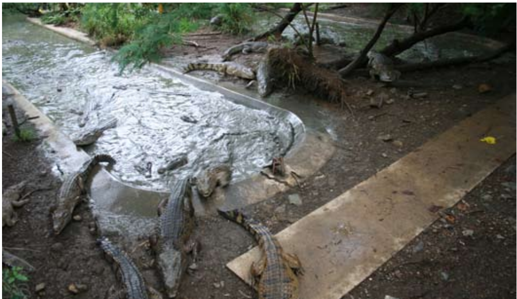
Figure 3.2: The Crocodile Farming Institute maintains around 540 Philippine crocodiles in captivity.

CFI successfully bred crocodiles in captivity and succeeded in establishing a crocodile industry. It made headway in educating the general public about the economic importance of crocodiles (figure 3.3). But little was done to inform rural communities living in crocodile habitat on the risks and benefits conserving crocodiles. 9 The activities of CFI have not led to the protection of crocodiles in the wild, or to the improvement of rural livelihoods. Nonetheless, the attention of the national government, scientists and international donors continues to be almost exclusively focused on market-based approaches to conserve crocodiles. Research activities are focused on husbandry, genetics and diseases of the captive population, and discussions on protecting crocodiles in the wild tend to revert to the management of the captive population.