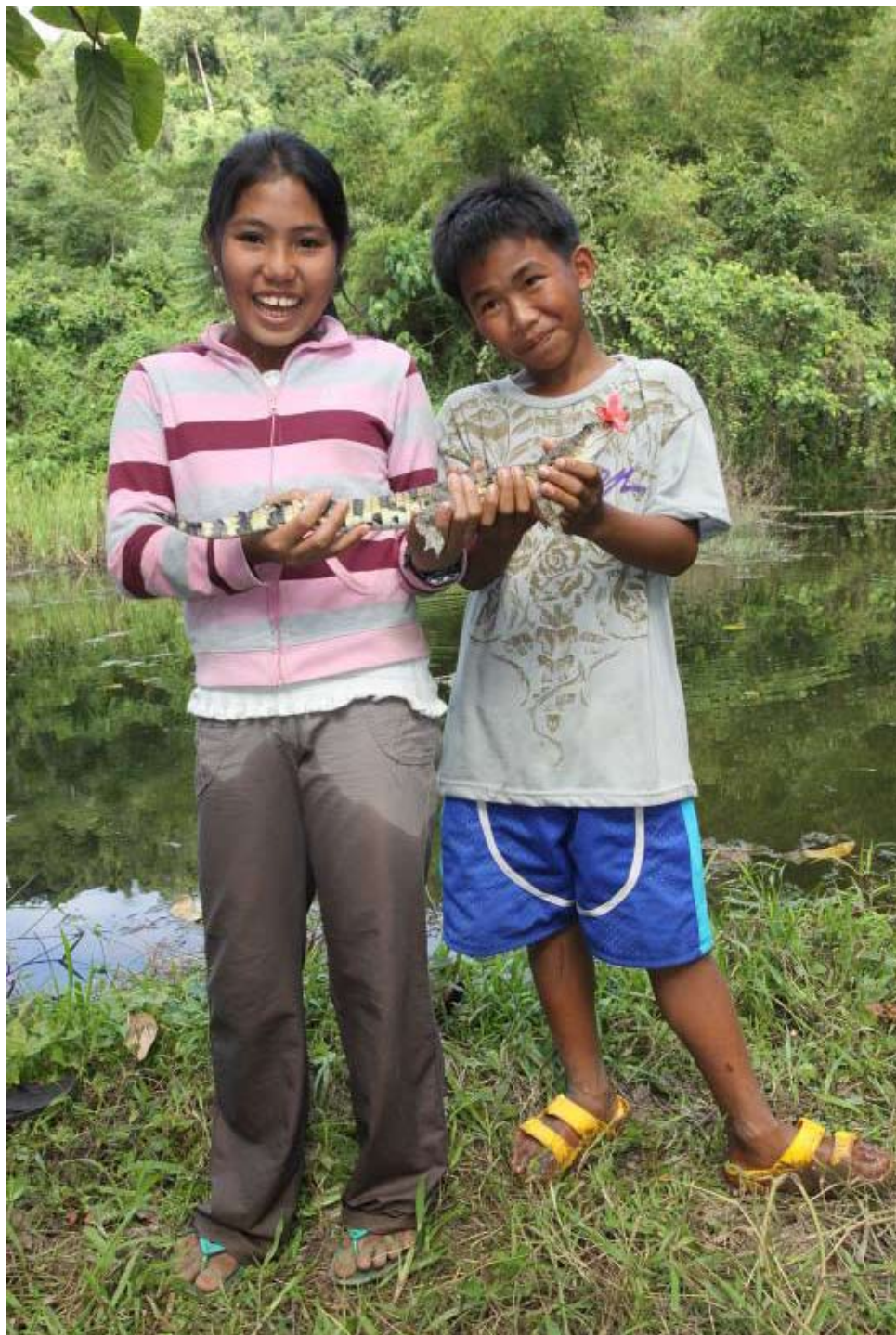
Figure 3.7: Schoolchildren release a captive-raised juvenile Philippine crocodile into the wild.