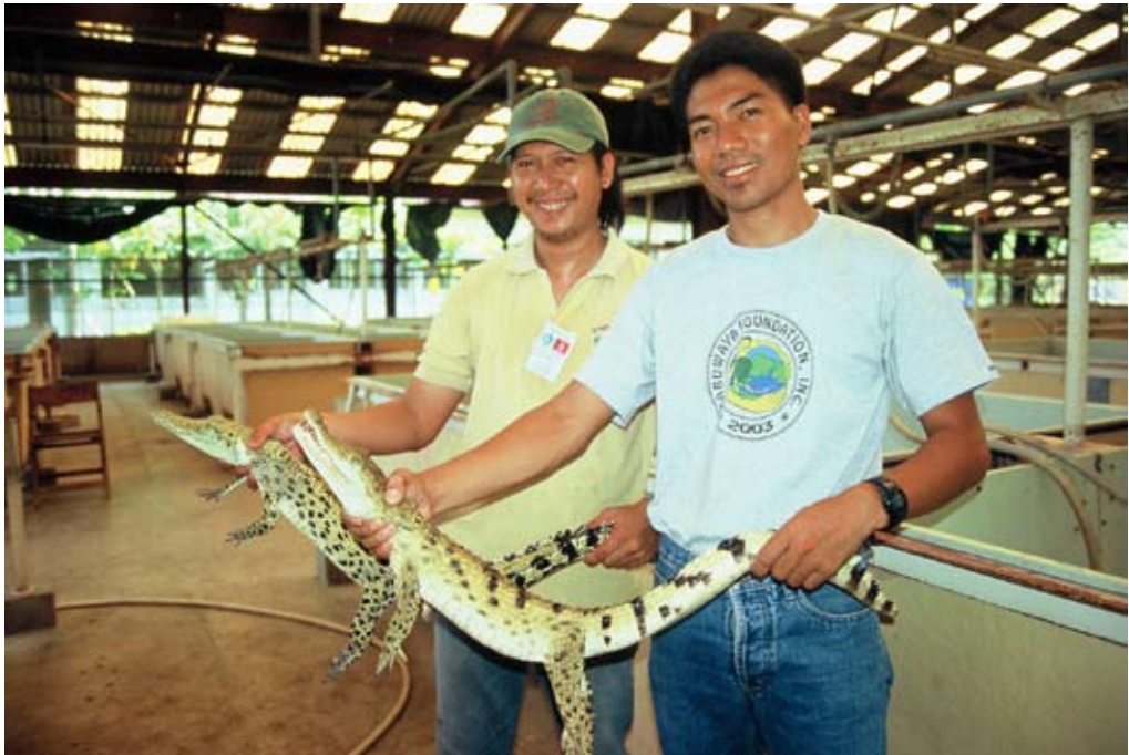
Figure 3.1: The Crocodile Farming Institute aims to conserve the Philippine crocodile (front) by generating public revenues through farming saltwater crocodiles (back). Photo by J. van der Ploeg (2004).

2008: 3). But instead of buying juvenile crocodiles yearly from CFI, these entrepreneurs associated in Crocodylus Porosus Philippines Inc. (CPPI) eventually opted to start breeding saltwater crocodiles themselves. They now own approximately 6,000 saltwater crocodiles and have the capacity to breed thousands saltwater crocodile hatchlings per year. Members of the IUCN Crocodile Specialist Group provide technical advice to CPPI on crocodile farming, tanning procedures and CITES regulations. The farms, located near urban areas, function as closed-circuit crocodile farms: eggs and hatchlings are not harvested from the wild as was originally envisioned, but bred in captivity. As such the farms do not have, nor create, a direct economic interest in preserving crocodiles in the wild or wetland habitat. 7 Problems with husbandry and government permits have so far hampered the export of crocodile leather (Limketkai 2008). Meanwhile saltwater crocodile populations in the wild continued to decline and rural communities living in crocodile habitat have not profited from the emerging leather industry, as was originally envisioned by CFI.