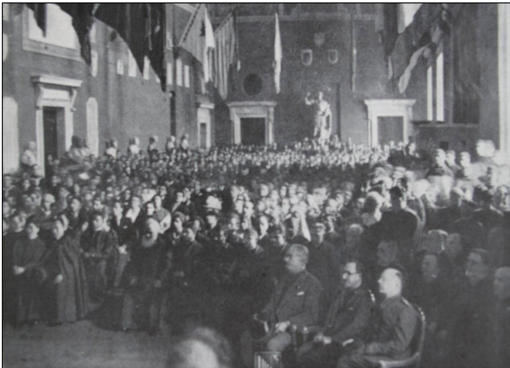
Fig. 5. Inaugural meeting of the Asian Students Congress [ Young Asia 1:1 (1934), Kern Collection].

The next part of Mussolini's speech was devoted to a critique of the imperialist powers of northern Europe, which had, instead of an equal union based on the best of both East and West, created a relationship based on subordination and materialism, using Asia as a market and a source for raw goods ( fonte di materia prime ). These powers, said Mussolini, were incapable of understanding Asia, and they had created and diffused an image of Asia as Europe's enemy. It was these joint forces of capitalism and liberalism, which had taken over the world, that fascist Italy was combating today. The fascist renaissance that Mussolini heralded as a spiritual renaissance above all ( rinascita soprattutto spirituale ), would lead Italy and the Mediterranean to resume its role as a cultural unifier. In a time of mortal crisis, civilization could be saved by the collaboration of Rome and the Orient, which was the reason the congress was convened: it would augur in a restoration of a community, of a tradition of millennia, of constructive collaboration. 192