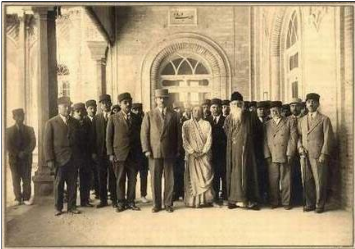
Fig. 2. Tagore in Persia [Saubhadra Chatterjee, ‘Tagore’s plaque in Iranian Parliament’ Hindustan Times , 29 October 2011].

I am sure that this individual fact of a poet belonging to a distant corner of the earth and speaking a different language finding his seat of welcome at your Majesty’s table this evening is not a mere accident but has deeper historical significance. It is a generous gesture of the national self-respect of a nascent Asia, its expression of intellectual hospitality. ... I pray that Iraq may realize this great responsibility of a coming civilization. 40