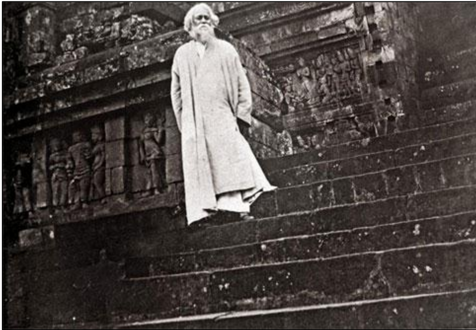
Fig. 3. Tagore at the Borobudur ['Tagore's visit to Java, 1927': Viśva Bharati Publication Department, Kolkata].

are conscious of their Indian connection and are anxious to renew cultural relations'. 59 In 1939, two Viśva Bharati students, one of whom was Tagore's own granddaughter, embarked on a study of Javanese dancing in the Dutch East Indies. 60