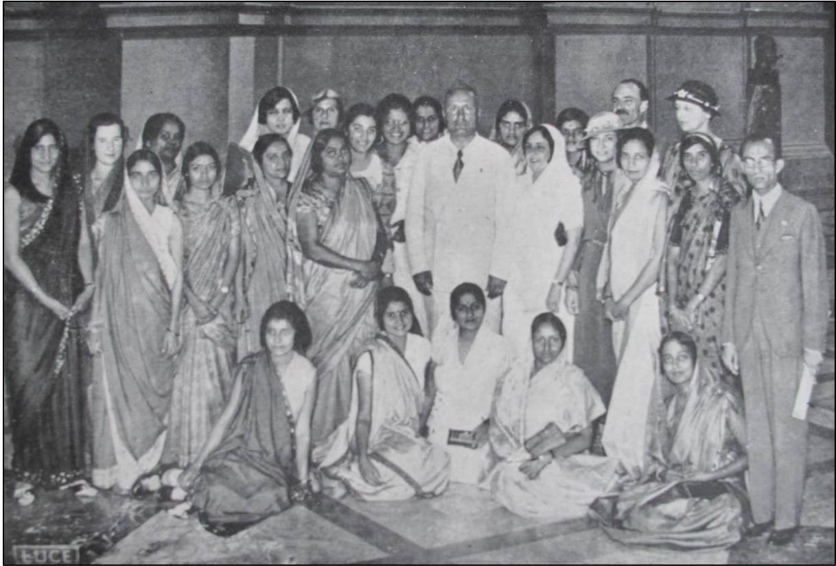
Fig. 7. Visit of Indian women to Mussolini [Young Asia 1:3 (1934), Kern Collection].

But the Confederation at La Sapienza was not destined to become an enduring organization. From 1936, the discourse that had surrounded this temporary Italo-Asian alliance started to sound different. Earlier, the invocation of past Roman regional hegemony and the image of Italy as a nonracist, non-colonial power had spoken strongly to Indian anti-imperialist sentiments. But from the Abyssinian invasion and Italy's racist citizenship laws of 1936, the same words took on new meaning. 205 The earlier sympathy for Italy's rise from agricultural nation to industrial and political power of note, gave way to a strong sense of solidarity with Abyssinia. Indian public opinion called for a boycott of all things Italian and regular 'Abyssinian solidarity days' were observed throughout India. 206 The Abyssinian war had exposed the imperialist agenda of the Italian regime and with it disqualified Rome as a sponsor of Asian anti-imperialism.