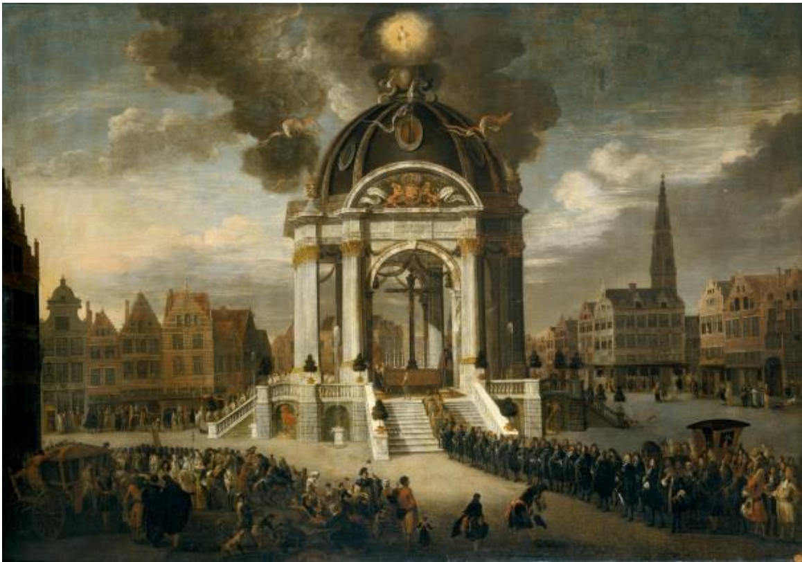
Fig.53 Hendrik van Minderhout, The magistrate's temple on the Meir in Antwerp during the festivities in 1685 (Museo Nacional del Prado, Madrid).

The magistrates' display on the Meir was depicted in prints and paintings several times in and after 1685. Besides the two prints in De Smidt's guide, no fewer than four paintings were made of the festivities (fig.53). 89