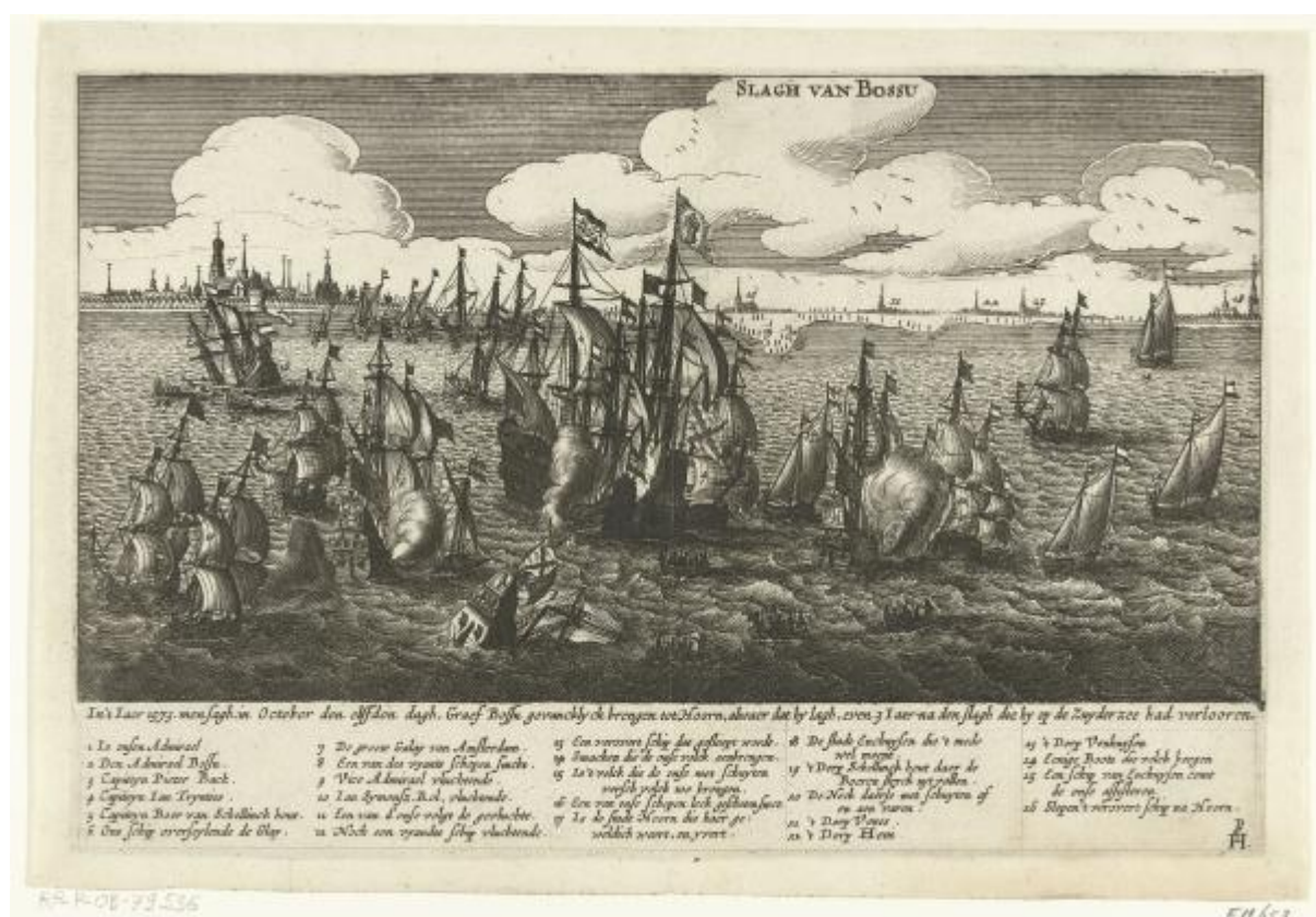
Fig.51 Hendrik Cornelisz Pot, the battle of the Zuiderzee in 1573 as depicted in the second half of the seventeenth century, 1647-1676 (Rijksmuseum Amsterdam).

In addition to the difficulties that arose for religious minorities, however, the end of the war also instigated a new phase in urban memory practices. After the celebrations for the end of the war in June 1648 subsided, moves to commemorate the Revolt quickly followed. Especially on a local level, authors, playwrights and ministers were keen to supply the growing demand for (re)interpretations of the past. After all, the Revolt had started more than eighty years ago, which meant that the last people who had experienced the iconoclasm of 1566 had been dead for quite some time. From 1648 onwards memory practices therefore slowly changed in nature while they became embedded in national and local history. From the communicative phase of memory, described by Jan Assmann, the memories of the Revolt now entered the phase of cultural memory. The memories exceeded 'everyday interaction and communication' and became institutionalized, preserved and reinterpreted for new generations. 17 The war had become a part of history.