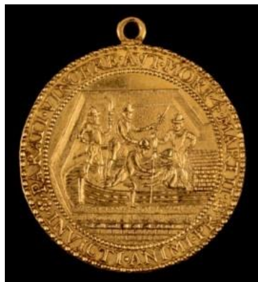
Fig.27 Medal representing the attack with the peat barge on Breda in 1590 (Het Noordbrabants Museum 's-Hertogenbosch).

Apart from changes in design, the Revolt inspired national, provincial and local governments to reward different sorts of people. 61 The majority of the rewards were still received by members of the elite, but the Revolt opened up opportunities for people of lesser rank to be rewarded as well. The usual recipients, such as delegates, town council members, ambassadors and envoys were now supplemented by men who were rewarded for extraordinary (military) services. 62 The medal that stands out the most, and reflects the addition of 'common' men to the traditional recipients of medals, is the one issued by the States General to celebrate the victory in Breda in 1590. Seventy-six gold medals were minted to reward the officers, soldiers and skippers who executed the attack on the city (fig.27). 63