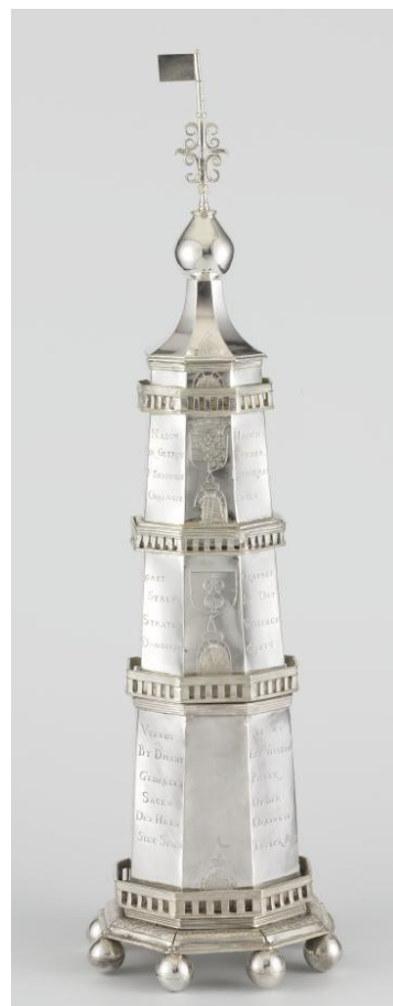
Fig.26 Silver condiment tower depicting the St Janschurch in 's-Hertogenbosch.