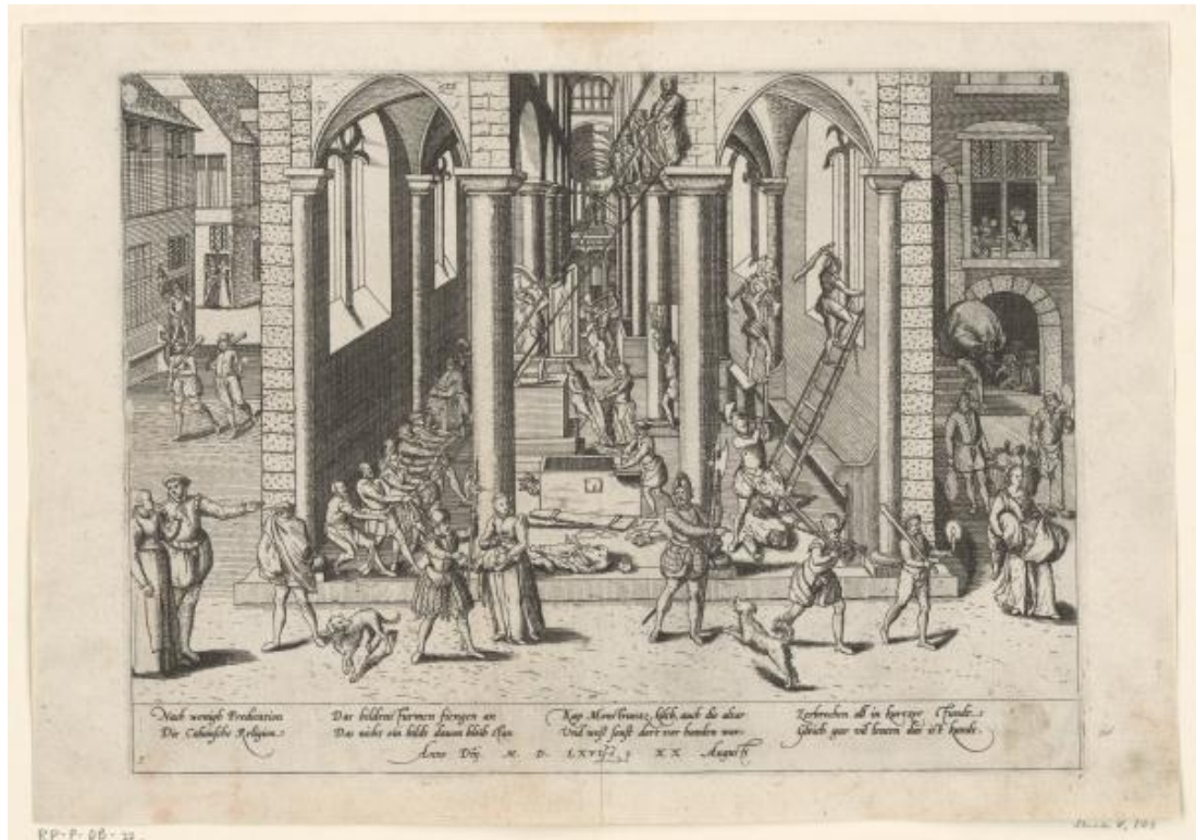
Fig.3 Frans Hogenberg, Iconoclasm in 1566, 1566-1570 (Rijksmuseum Amsterdam).

Different interpretations of iconoclasm and its aftermath surfaced from the end of the sixteenth century onwards. 114 The earliest interpretations appeared in newsprints made by Frans Hogenberg who worked from Cologne (fig.3). 115 Simultaneously at least one anonymous print which propagated iconoclasm circulated in 1566. This print celebrated the breaking of images and statues and represented the Catholics venerating a seven-headed monster. 116 Unlike other episodes of the Revolt such as sieges or attacks, iconoclasm was not a popular event to depict. Besides the two prints only one medal is known which shows images not only of people tearing down statues from a church but also the offering of the Petition of Nobles to Governess Margaret of Parma and other scenes that represented the troubles between 1560 and 1566 (fig.4). 117