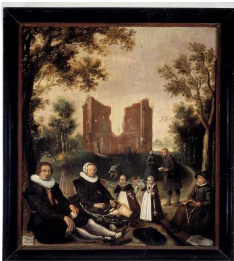
Fig.7 Gerrit Pietersz. de Jong, Catholic family at the chapel of Our Lady of Succor in Heiloo, 1630 (Museum Catharijneconvent Utrecht).

These depictions of the ruined chapel in Heiloo were not unique. After its destruction in 1573 the abbey of Egmond, another village in Holland near Alkmaar, was depicted multiple times in the seventeenth century. While drawings and prints depicted the ruinous state of the building, paintings showed the abbey and castle in their full glory. 138 From the 1620s until the 1640s the image was very popular as one in a set of three paintings that showed the abbey, the castle and the nearby village Egmond aan Zee. These paintings were made in the workshop of Claes van der Heck, and at least forty are still known today. 139 Who bought or commissioned these paintings is unclear, but it is certain that they were popular in the seventeenth century. Since they were usually commissioned in a set of three it may well have been a local interest in Egmond that inspired these paintings, but this argument does not fully seem to account for the fact that the abbey and castle, both symbols of the old Catholic heritage of the village, were depicted in full glory.