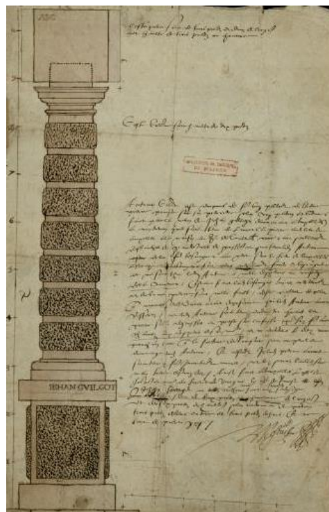
Fig.14 Column at the former site of the Culemborg palace

In the Habsburg Netherlands more drastic measures were also being taken to eradicate any traces of heresy. When the Duke of Alva arrived to restore order after iconoclasm in 1566, he immediately ordered the demolition of several Calvinist churches in Antwerp; to purify the land, crosses were to be put in their place. 201 Fifty years later, as another act of symbolic repression, an Augustinian monastery would be founded on the site of one of these churches. 202 This type of symbolic purification also occurred on the site of the Culemborg palace in Brussels. In 1568 the palace had been demolished because heretical nobles had organized their resistance against the king from this residence. The Duke of Alva ordered the land to be sown with salt to make the soil infertile and had a column erected to commemorate the demolition. During the Calvinist Republic the column was removed, but after 1584 a new convent for the Discalced Carmelites was built on the site to cleanse the land completely (fig.14). 203 This sort of commemoration also happened on a smaller scale.