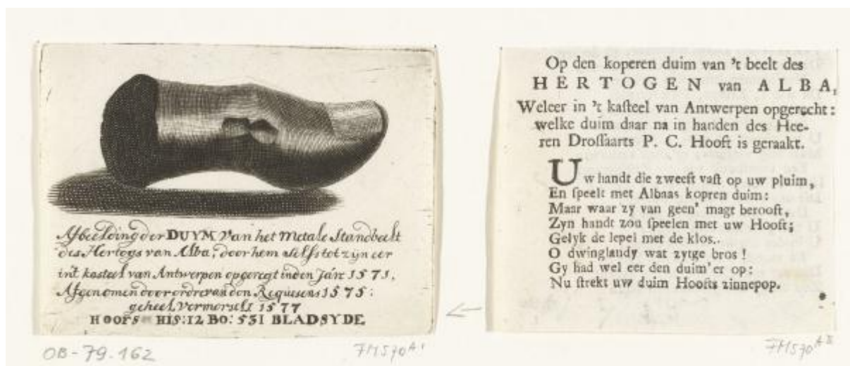
Fig.13 Metal thumb, said to have been from the statue of the Duke of Alva in the castle in Antwerp (Rijksmuseum Amsterdam).

In the Habsburg Netherlands, particularly after 1585 when Alexander Farnese had the citadel rebuilt, it seems unlikely that these depictions would still be considered suitable for display in public. Like the images of ruined chapels in the Dutch Republic these objects therefore formed a set of counter-memories of the Revolt. Yet, because the message of emphasizing civic unity, and the involvement of a variety of citizens and liberty, was rather more political than religious, it may have been considered less threatening after the Catholic restoration than purely Calvinist symbols or the destruction of religious imagery would have been, which may explain why so many of these depictions still survive today.