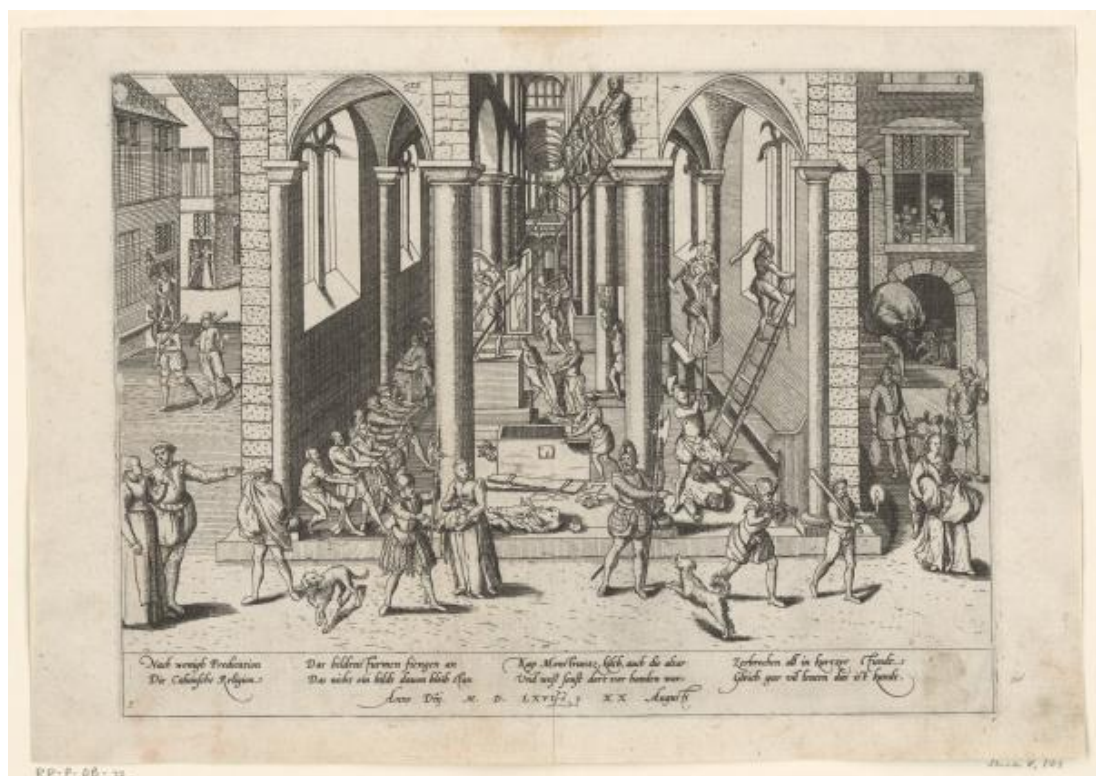
Fig.3 Frans Hogenberg, Iconoclasm in 1566, 1566-1570 (Rijksmuseum Amsterdam).

Different interpretations of iconoclasm and its aftermath surfaced from the end of the sixteenth century onwards. 114 The earliest interpretations appeared in newsprints made by Frans Hogenberg who worked from Cologne (fig.3). 115 Simultaneously at least one anonymous print which propagated iconoclasm circulated in 1566. This print celebrated the breaking of images and statues and represented the Catholics venerating a seven-headed monster. 116 Unlike other episodes of the Revolt such as sieges or attacks, iconoclasm was not a popular event to depict. Besides the two prints only one medal is known which shows images not only of people tearing down statues from a church but also the offering of the Petition of Nobles to Governess Margaret of Parma and other scenes that represented the troubles between 1560 and 1566 (fig.4). 117