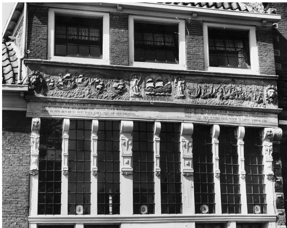
Fig.16 One of the so-called Bossuizen 1 on the Grote Oost and Slapershaven in Hoorn.

The elaborately carved and colored gable stones were placed around 1650 and display and explain the battle and its meaning for Hoorn. 220 The first stone refers to the battle itself and Hoorn's fight for the fatherland; 'there one fights without pay for the dear fatherland'. 221 The second connects the citizens of Hoorn to the battle at sea 'and without doubt are these also in the thick of it, as there are people ashore who pray to God with Moses'. 222 And the third stone commemorates the battle as an act of God, 'the country shakes and trembles, the enemy is coming. He wants to defeat Israel with Amalek, he comes with great force, but God has given us also Aaron and Hur whose names are written'. 223