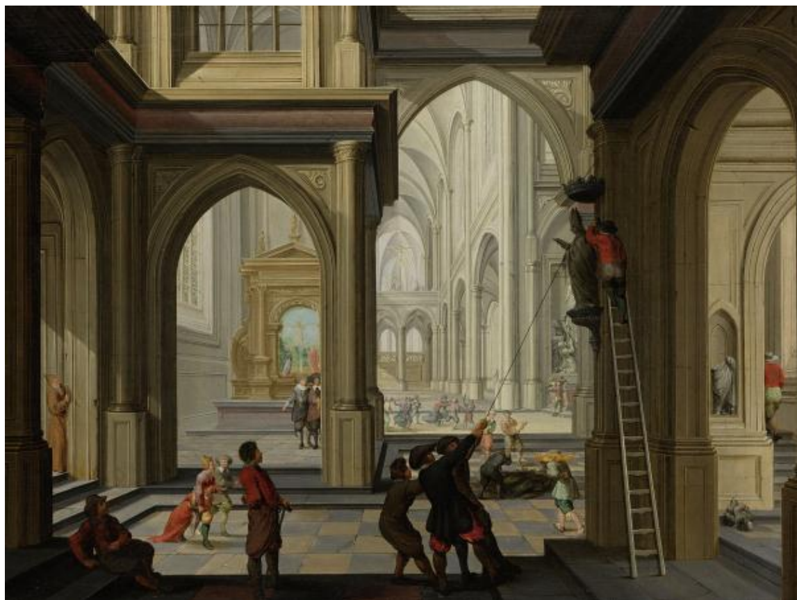
Fig.5 Dirck van Delen, Iconoclasm in a church with a Catholic clergyman watching, 1630 (Rijksmuseum Amsterdam).

Not only the destruction of 1566, but also the image breaking of the 1570s and 1580s was recorded. In Utrecht antiquarian and humanist Arnoldus Buchelius felt the need to preserve the Catholic past for future generations after the change of regime in 1580. For this purpose Buchelius kept several manuscripts which described the physical changes in the urban landscape and decorated them with numerous drawings. 120 The rapid changes to the landscape also inspired individuals to commission paintings of religious buildings that had been demolished after 1580. 121 In 1630, more than forty years after the new regime was installed, the St Salvatorchurch was painted by an anonymous artist. The building itself had been demolished in 1587, and the artist probably used a drawing from Buchelius' manuscript for the exterior of the church. 122 Buchelius' work had therefore achieved what he had hoped