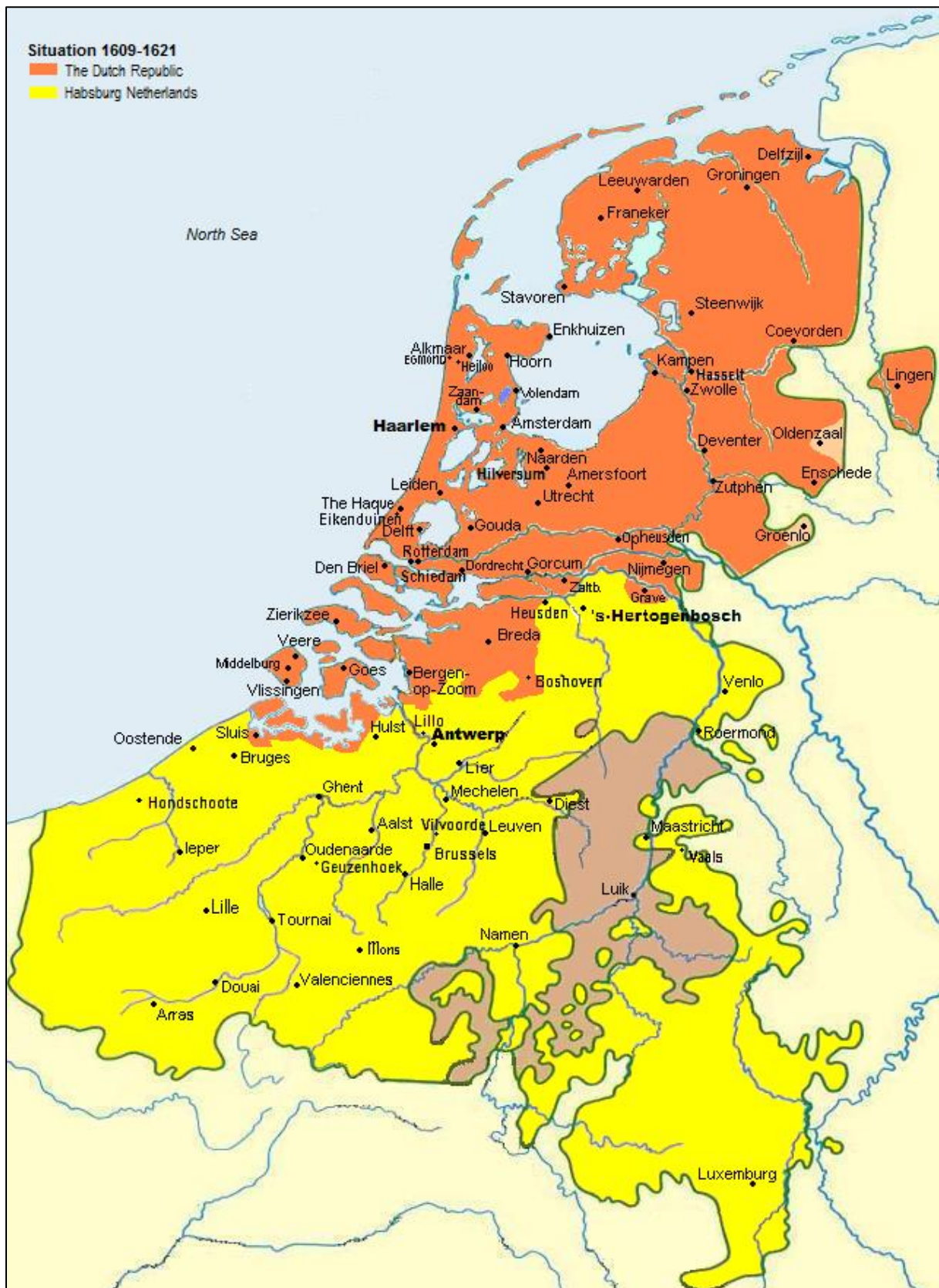
Map 2 Map places of memory.

inspired by events during the Revolt, but they literally shifted the existing memories from the mind to the streets.