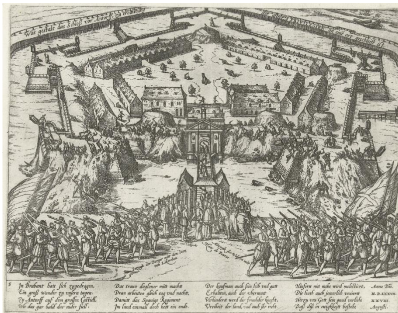
Fig.11 Frans Hogenberg, Afbraak van de citadel van Antwerpen, 1577.

Other memorabilia ranging from prints to medals and plaques were made to commemorate the event. In 1577 stones of the castle had been distributed among the public. 174 As early as 1577 a first print of the subject was published by Frans Hogenberg (fig. 11). 175