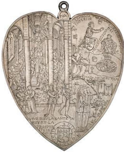
Fig.4 Medal depicting Iconoclasm in 1566 (De Nederlandsche Bank).

Two paintings, however, shed light on the way iconoclasm was perceived in the Dutch Republic apart from the prints. The first is dated between 1610 and 1630 and made by Hendrik van Steenwijck II. It shows statues being taken down from their plinths in an orderly fashion under supervision of a man in the left foreground. 118 A second version of the iconoclastic fury appeared in 1630. The destruction of statues was painted by Dirck van Delen in 1630 as part of a church interior (fig.5). Several statues have already been smashed, and a Catholic priest is watching several men tear down one of the final saints in the foreground. 119 By contrast to Van Steenwijck, Van Delen depicted the scene as less orderly and also showed a Catholic clergyman watching the destruction. This variance suggests that the patrons for these paintings differed in their opinion about iconoclasm. More than fifty years after the event took place there was thus room for interpretation of this episode during the Revolt.