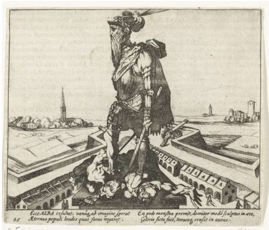
Fig.12 Simon Frisius, the Duke of Alva as giant in the castle in Antwerp, 1613-1615 (Rijksmuseum Amsterdam).

Pieter Cornelis Hooft wrote in his history of the Revolt that the statue was taken to the wharf and cut to pieces which were subsequently taken home and put on display. 183 Hooft himself believed he owned the thumb of the statue on which poet Joost van den Vondel wrote a short verse in 1641 (fig.13). 184 The statue and its removal thus inspired artists and authors to use the memory of the statue inside the citadel and transform it to their own advantage, demonstrating the hatred towards Alva and his Spanish regime in the Low Countries. 185