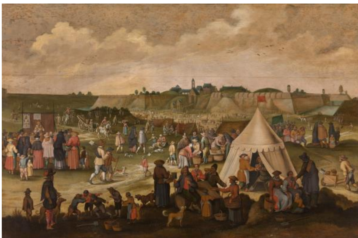
Fig.10 Anonymous, demolition of the castle in Antwerp 1577, ca. 1600 (Koninklijk Museum voor Schone Kunsten Antwerp).

In the seventeenth century the demolition of the castle in Antwerp became a popular subject to remember. 168 Unlike the depictions in Utrecht, however, depictions of the Antwerp castle feature only the actual demolition of the building instead of the castle in its full glory. 169 For example, an anonymous painting, formerly attributed to Peter Goetkint, represents the castle in the background while in the foreground a large crowd is either taking part in or watching the demolition (fig.10). 170