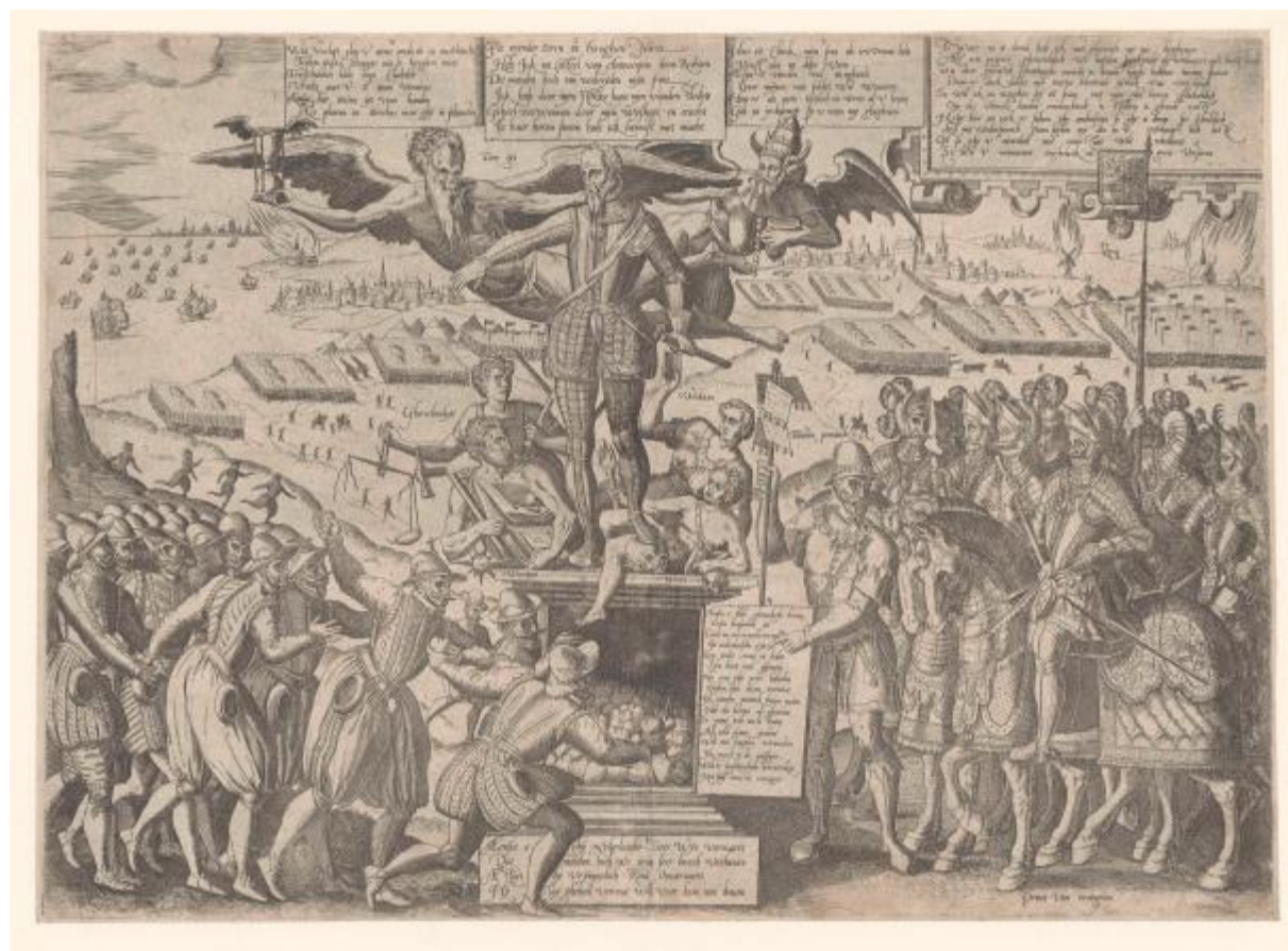
Fig.9 Allegory with the statue of the Duke of Alva in the castle in Antwerp, ca. 1572 (Rijksmuseum Amsterdam).

Yet, the demolition of the castle itself was not the first cleansing related to this structure. The citadel and statue had been erected to represent Alva's pride in defeating the heretics. The bronze for his statue came from the rebel cannon which had been taken from victorious battle at Jemgum in 1568. As an image of Alva trampling heresy and rebellion, the statue contributed to the duke's unpopularity. 164 Soon it became clear that the statue was not received well in and beyond Antwerp. In 1572, for instance, an anonymous print was published which depicted an allegory of the duke presented as an image of his statue (fig.9). 165