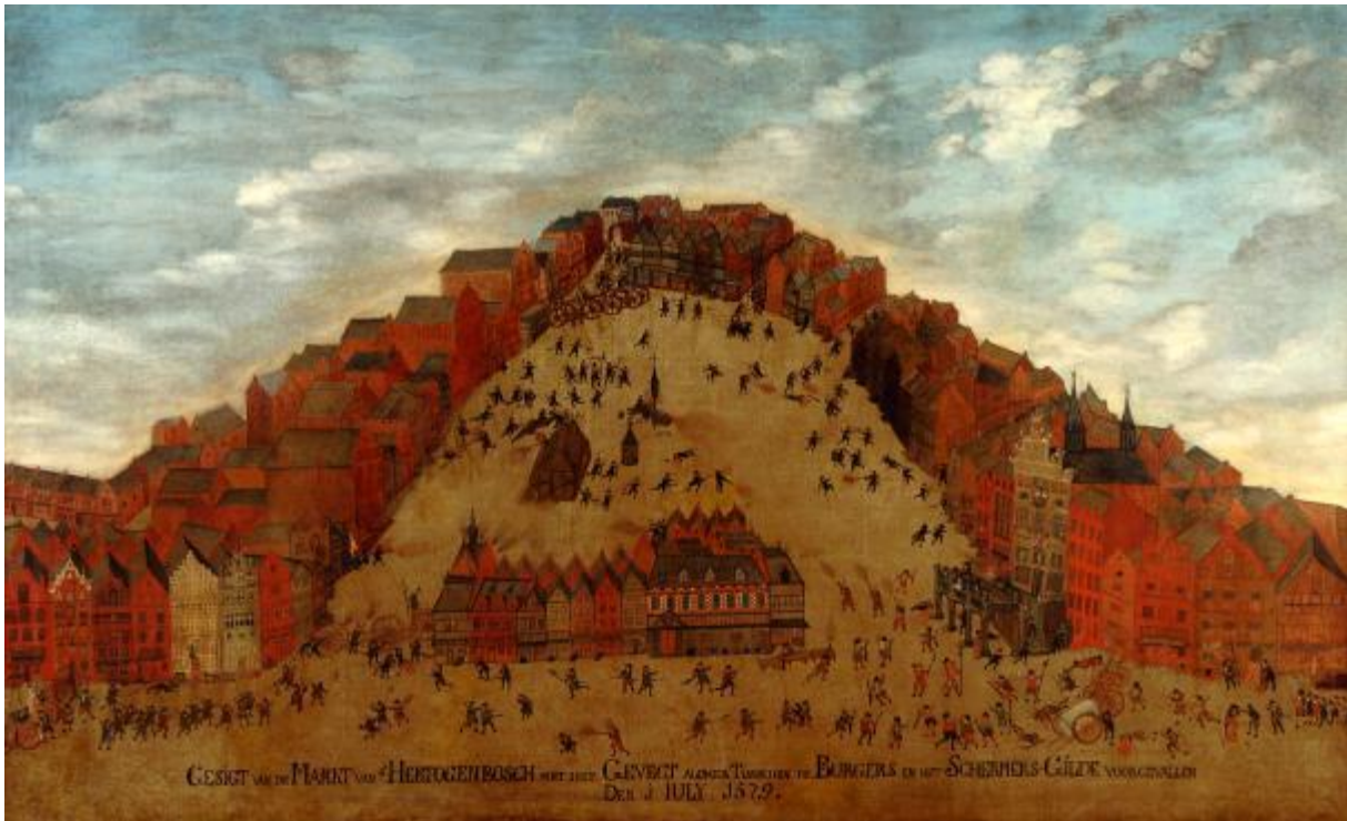
Fig.1 Jan van Diepenbeeck, Schermersoproer in 's-Hertogenbosch, 1600 (Het Noordbrabants Museum).

Van Diepenbeeck's work in 1600 consisted of several small scenes, and a painting which depicted the fight on the market square (fig.1). Twenty-one years after the Calvinists had left 's-Hertogenbosch the day of the 'fury' was commemorated annually with a procession for which several altars were erected in the city and with a dinner for the victorious combatants at the town hall. Moreover, the memories of the fight had been adapted to suit the present needs of the city magistrate. 's-Hertogenbosch had reconciled with the king in December 1579 and prided itself on its Catholic identity. The events of 1579 were thus portrayed as a victory over the Calvinists rather than the civic dispute they had been. 4 From 1600 onwards Van Diepenbeeck's painting was the centerpiece of this celebration. The scene depicted the market square during the fight, with the town hall in the lower right corner. On the balcony the magistrate is still present after the proclamation of the Union of Utrecht. The Calvinist militia in the right foreground is raising a barricade, the Catholics are consolidating their position on the market square. Only one name is mentioned on the painting, that of 'Lokere', the Catholic governor who ended the fighting after half an hour. 5 Lokere's presence confirmed that the city did not need a garrison to expel the