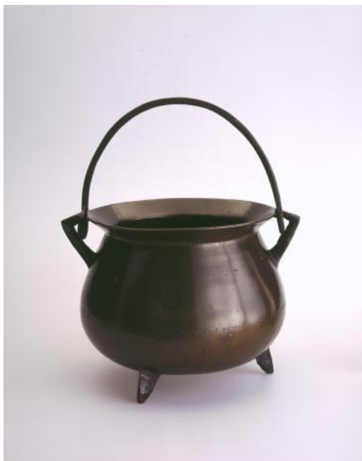
Fig.2 Cooking pot found in the Lammenschans in Leiden on 3 October 1574 (Museum De Lakenhal, Leiden).