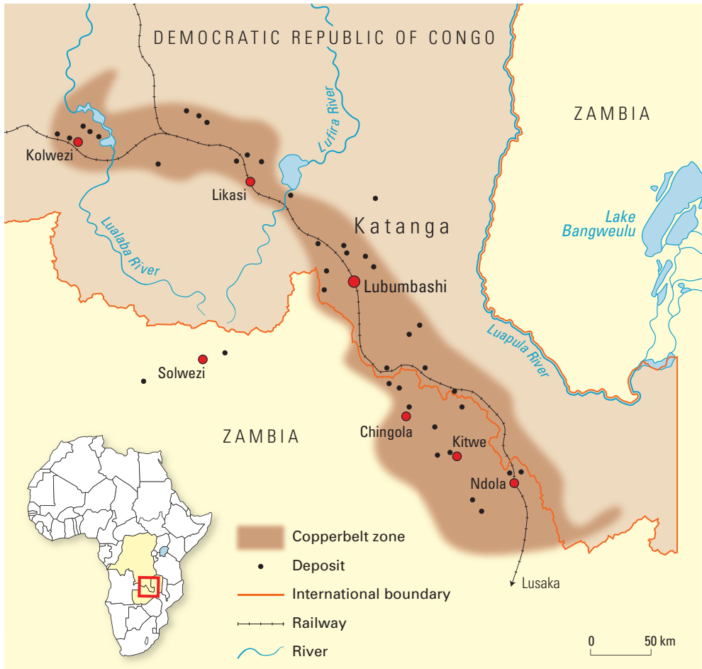
Map 1.1 The Copperbelt as it stands across the Congo-Zambia border.