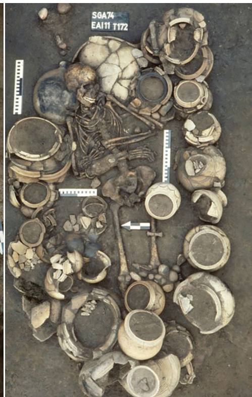
Figure 2.2 Sanga, Tomb 172. This is a particularly rich tomb, including a copper necklace; iron bracelets and one copper bracelet; iron pendants on the waist; animal bone; ivory pendant.