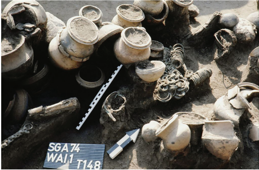
Figure 2.4 Sanga, Tomb 148. Copper Bracelets can be seen in the middle.

The second is that political centralisation, the spread of its symbolic imagery and the interplay of several cultural traditions are all ancient processes. Copper seems to have played an essential role in these processes through its use not only for functional objects, but also for items imbued with less utilitarian purposes: status display (jewellery), symbolism (bells), or exchange (crosses). Lastly, these are only small fragments of information about very ancient and badly-known processes. Archaeology for this period remains virtually unknown, which means that, in reality, very little is known about the early occupation of central Africa.