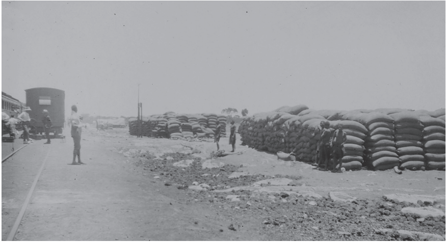
Figure 4.4 Rhodesian maize waiting to be loaded on the train to Katanga in Lusaka train station, 1912.

Our economy is still, broadly speaking, at the extractive stage. Secondary and light manufacturing industries are not established here. 144