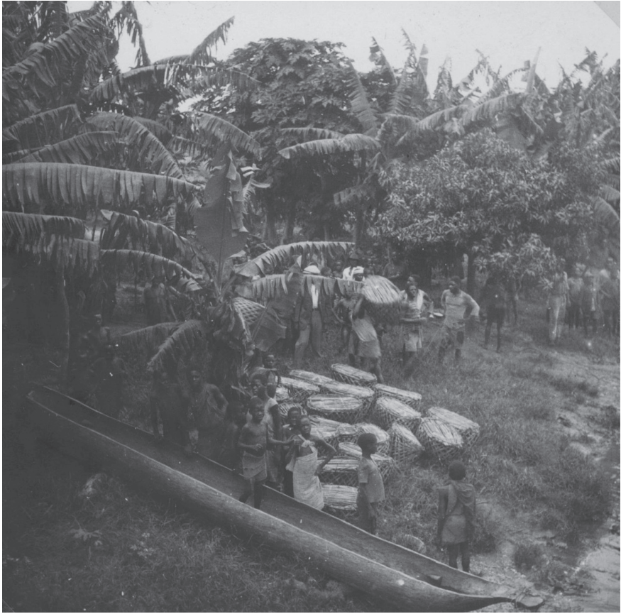
Figure 4.7 Kisenga on the Luapula (Northern Rhodesia). Dry fish en route to the Katangese mines, 1931.

and dried, that became the winning asset of the Mweru-Luapula. The Mweru-Luapula had no shortage of water, hosting or being adjacent to three lakes (Lake Mweru, Lake Tanganyika and Lake Bangweulu), two rivers (the Luapula River and the Kafue River) and the Lukanga swamps. As a result, the volume of trade between the lower Luapula valley and the Katangese mining towns increased substantially between 1912 and 1915 ( Ibid. : 55-56). By 1927, the urban population of southern Katanga – the main market for Luapulan fish throughout the colonial era – reportedly consumed ‘some 500 tons of fish worth £5,000 and nearly the same quantity of native flour valued at £600.’ 147 The fishing industry was inherently unstable, since its success was