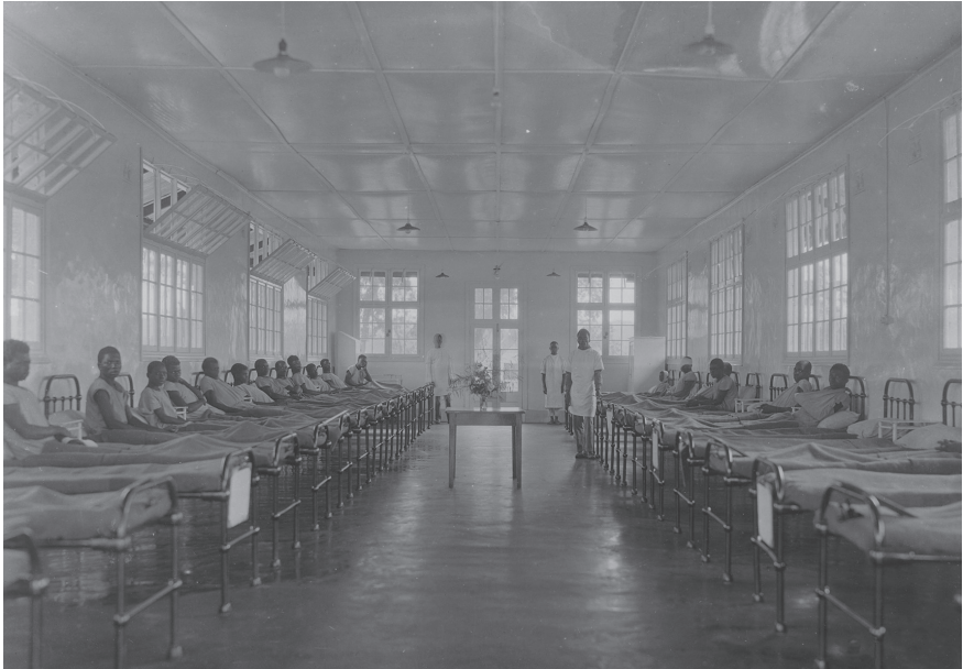
Figure 4.3 New 'native' hospital in Elisabethville, 1928.

ly, though not exclusively, sought to attract men from within the Congo or Rwanda-Urundi. 127 In order to attract settled labour, the Katangese mines dramatically upgraded African conditions of living by the end of the decade: the company built better houses and hospitals for employees as well as granted small salary increases and better food (Fetter 1976: 94). 128 This made Katanga very attractive for Rhodesian workers and, even though the UMHK did indeed increasingly hire labour from within Congo, many Northern Rhodesians were still hired (Fetter 1973: 32; Parpart 1983: 32), as is apparent from the UMHK recruiting statistics in the 1920s (see tables 4.1 and 4.2).