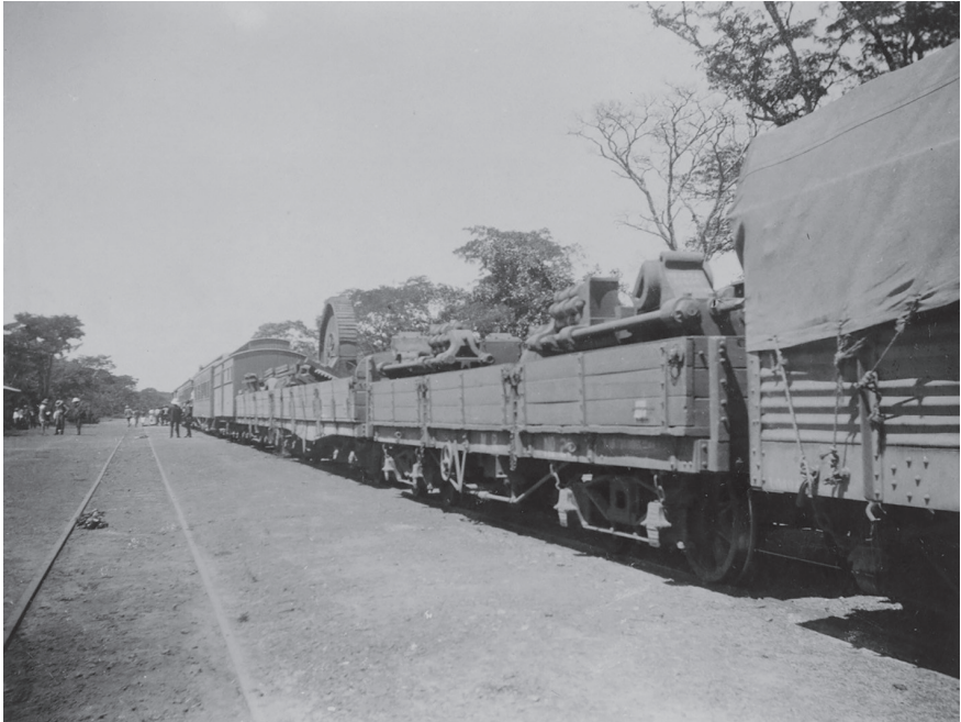
Figure 4.5 Livingstone Station: train leaving for Elisabethville with goods.

northeast. These, however, in the absence of river routes or railways, were too difficult to reach. There were some attempts to deal with the problem locally, such as the attempt to build up a substantial European farming community, but none proved to be successful. 145 Eventually, it became imperative to find new food-supplying areas (Jewsiewicki 1977: 318-321). One of the most immediate candidates was Northern Rhodesia. Thanks to the BSAC railways, Northern Rhodesia had a straight line of transportation to Katanga starting in 1910, and since the Katangese mines were already tapping into Northern Rhodesian labour reserves, it was not much of a stretch to include foodstuffs into the deal as well. Accordingly, in March 1911, Robert Williams & Co. contracted the firm King and Werner in north-western Rhodesia to supply the mines with large quantities of grain and beef (Perrings 1979: 19). These were, for the most part, raised by white immigrants, mainly Afrikaners from South Africa, who had begun to settle in Northern Rhodesia in the years that followed the Boer War. They had established themselves along the railway that