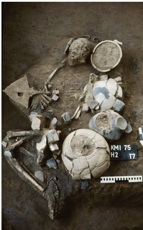
Figure 2.1 Kamilamba, Tomb 7. An example of ceremonial axe and small bells can be seen on the left side.

this change is linked to the establishment of several major kingdoms in the interlacustrine region further to the north and the new diffusion stream that this might have created and activated (Phillipson 2005: 292-5). Zambia, is a notable exception to this and, though sharp changes in pottery did occur, there is no evidence that the eastern pottery style ever spread there. Instead, by the twelfth century, central and north-eastern Zambia was predominantly inhabited by a people whose pottery belonged to a common 'Luangwa' tradition, which differed sharply from the Early Iron Age pottery that previously dominated the area. It has been suggested that the makers of this Luangwa pottery belonged to a 'distinct group of people, who had entered the country from elsewhere' (Roberts 1976: 36-7). In turn, the archaeologist D.W. Phillipson argued that the differences between Luangwa pottery and the pottery found in virtually every other area of east-southern Africa suggest that,