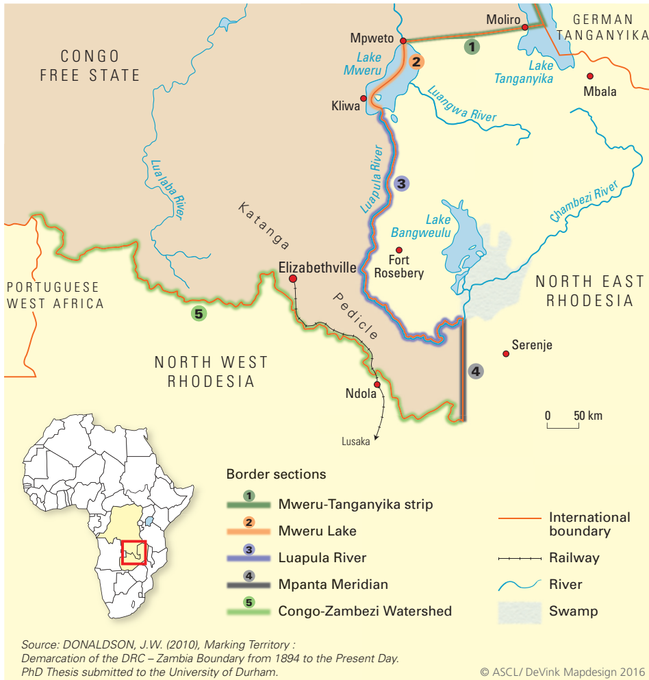
Map 3.1 The sections of the Congo-Zambia Border.

The real novelty was that the 1894 treaty ensured that the delimitation of the boundary was legally recognised and bilaterally agreed boundary between two recognised sovereign States. Perhaps the most important effect of this border agreement was to create the ‘Katanga pedicle’, a long arm of Congo territory that effectively split the upper part of the BSAC territory, from then on known as Northern Rhodesia, into two sections. This configuration has been hampering transport and communication between the eastern and western areas of the country ever since (Donaldson 2008: 473; Roberts 1976: 162). Yet, while the 1894 Anglo-Belgian treaty established a legal territorial boundary, recognised by those in power in Europe, it did not make any phys-