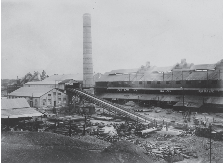
Figure 4.1 Copper foundry of the 'Star of the Congo' mine, Elisabethville (present day Lubumbashi), 1920.