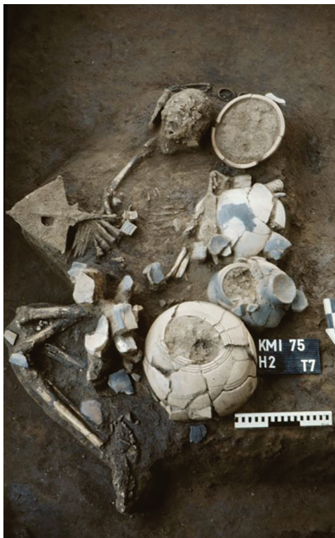
Figure 2.1 Kamilamba, Tomb 7. An example of ceremonial axe and small bells can be seen on the left side.

this change is linked to the establishment of several major kingdoms in the interlacustrine region further to the north and the new diffusion stream that this might have created and activated (Phillipson 2005: 292-5). Zambia, is a notable exception to this and, though sharp changes in pottery did occur, there is no evidence that the eastern pottery style ever spread there. Instead, by the twelfth century, central and north-eastern Zambia was predominantly inhabited by a people whose pottery belonged to a common 'Luangwa' tradition, which differed sharply from the Early Iron Age pottery that previously dominated the area. It has been suggested that the makers of this Luangwa pottery belonged to a 'distinct group of people, who had entered the country from elsewhere' (Roberts 1976: 36-7). In turn, the archaeologist D.W. Phillipson argued that the differences between Luangwa pottery and the pottery found in virtually every other area of east-southern Africa suggest that,