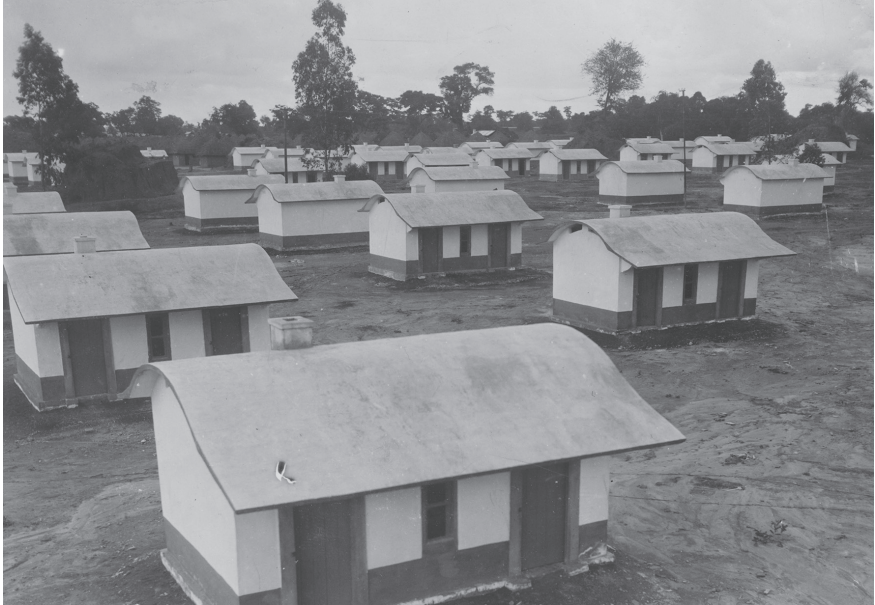
Figure 4.2 Example of native housing in Lubumbashi, 1929.

as ‘positively amazing’ by Orde Browne in 1929. 123 From 1926 on, to palliate the effects of the Northern Rhodesian government’s decision to restrict the number of Northern Rhodesians in Katanga, the Union Minière had decided ‘on an attempt to settle a native population on their properties and thus provide themselves with a permanent resident labour supply.’ 124 This meant that the UMHK was now after two things: more local and permanent sources of African labour, which would limit Katanga’s dependence on foreign labour on the one hand, 125 and, on the other, a more stable and skilled workforce, since allowing workers to stay for longer periods of time meant reducing dependence on a constant large supply of unskilled workers. 126 From 1927, the UMHK began to enlist workers on three-year contracts and increasing-