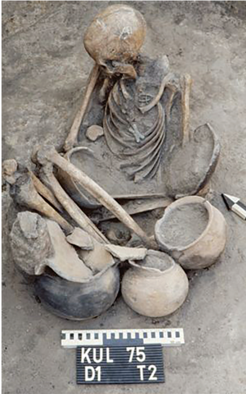
Figure 2.3 Kikulu, Tomb 2. A copper cross can be seen, sitting on the ribcage.

by then, there was not one but two clear separate 'streams' of cultural diffusion: a western one, centred in Zambia and south-eastern Katanga and an eastern one found in the remainder of eastern and southern Africa (Phillipson 2005: 251-2). In turn, archaeologist Thomas N. Huffman's interpretation of the two-stream directions, based on a study of motifs and typology, places the origin of the twelfth century spread of 'Luangwa' pottery from somewhere to the north-west of the modern Copperbelt – i.e. in south-eastern Katanga (see Huffman 1989). This abrupt change in pottery has often been described as having accompanied, from around the eleventh century, important migrations of people into central, northern and eastern Zambia (Phillipson 2005: 294-5; Roberts 1976: 38). If such a movement of people did take place, it is not yet possible, from the archaeological evidence, to identify these people or know where they came from for certain. However, as Andrew Roberts notes, 'the known distribution